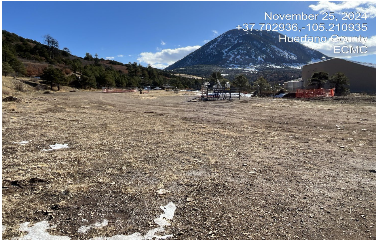
Photo 12. Facing southeast toward the location.