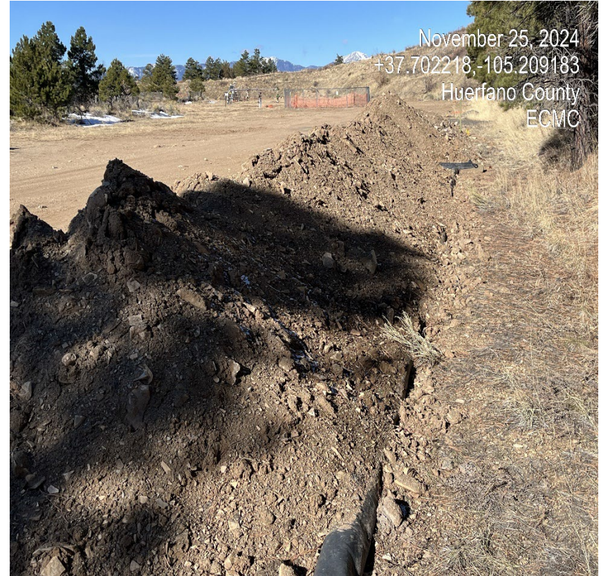
Photo 4. There are contaminate piles stored on location with a liner however material is falling over the liner berm.