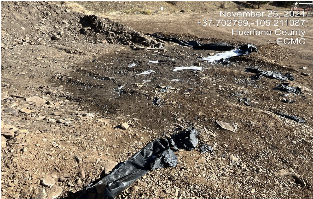
Photo 11. The waste material is contained and the liner is torn.