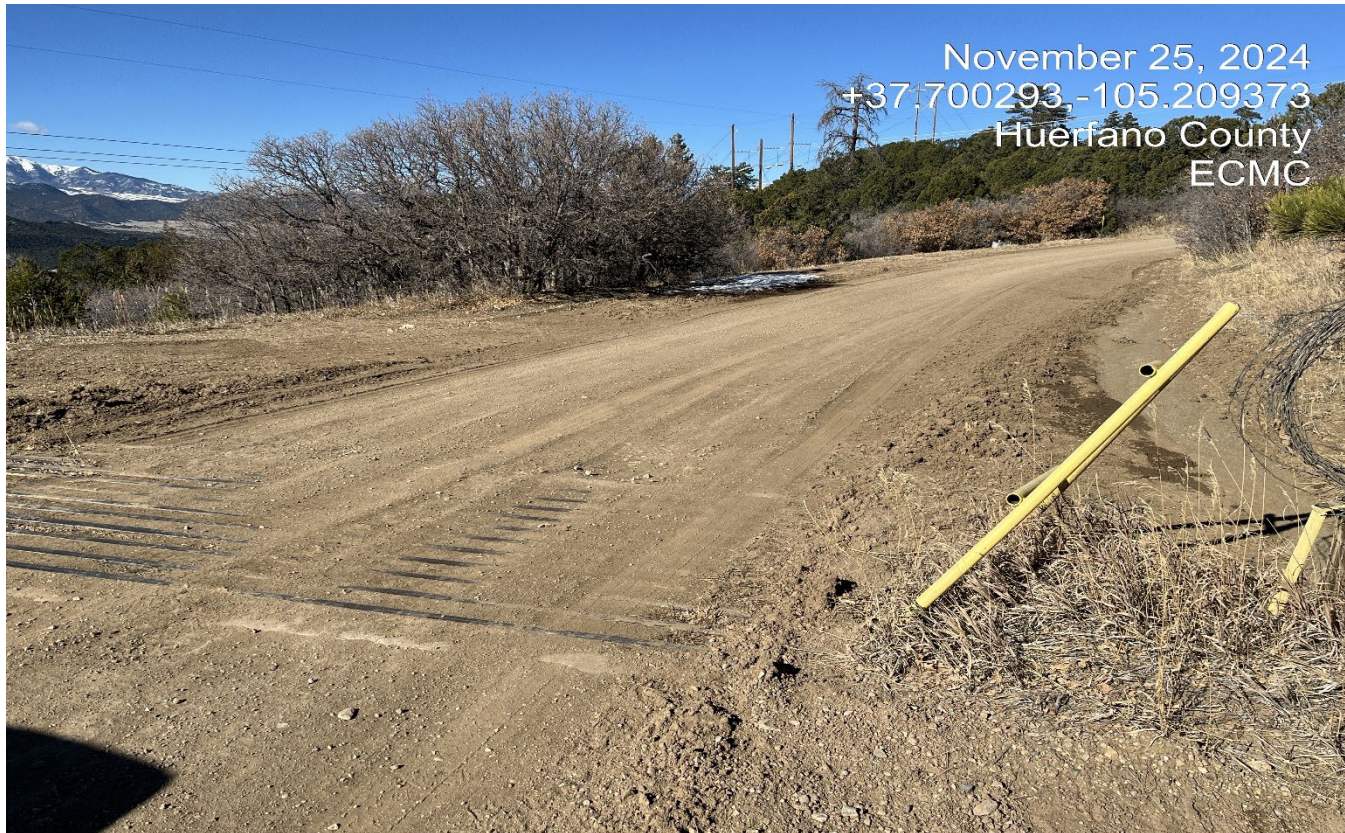
Photo 1. Facing toward the access road. The cattleguard has filled in with sediment and will need to be cleaned out..