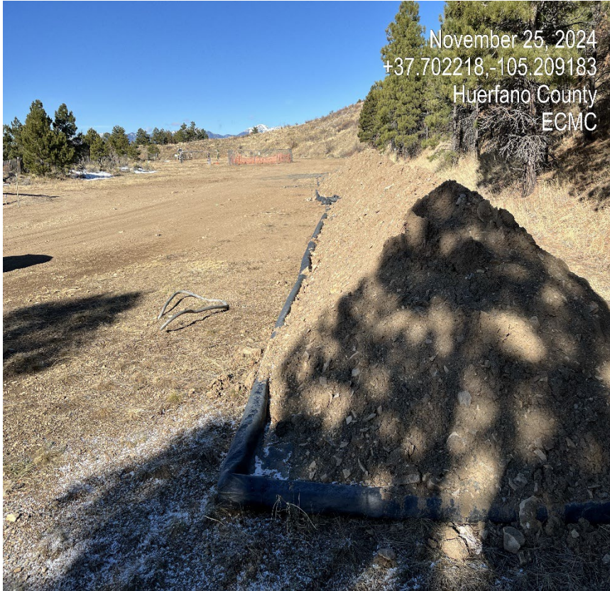
Photo 3. There are contaminate piles stored on location with a liner however material is falling over the liner berm.