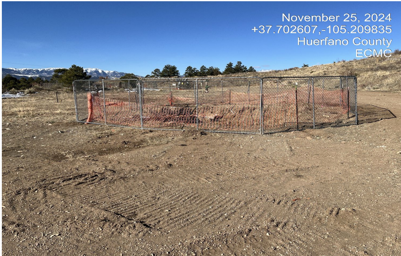
Photo 7. Facing northwest toward the abandoned well where remediation is in process.