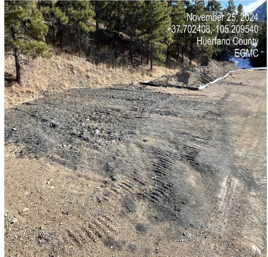
Photo 6. There is blacken material spread off of the liner.