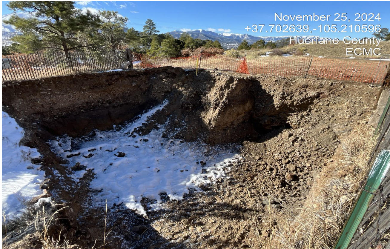
Photo 8. Facing toward the pit where remediation is in process.