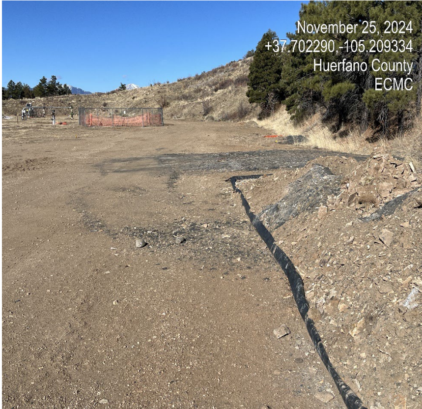
Photo 5. There are contaminate piles stored on location with a liner however material is falling over the liner berm. There is blacken material spread off of the liner.