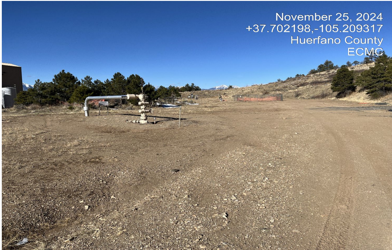
Photo 2. Facing north toward the location.