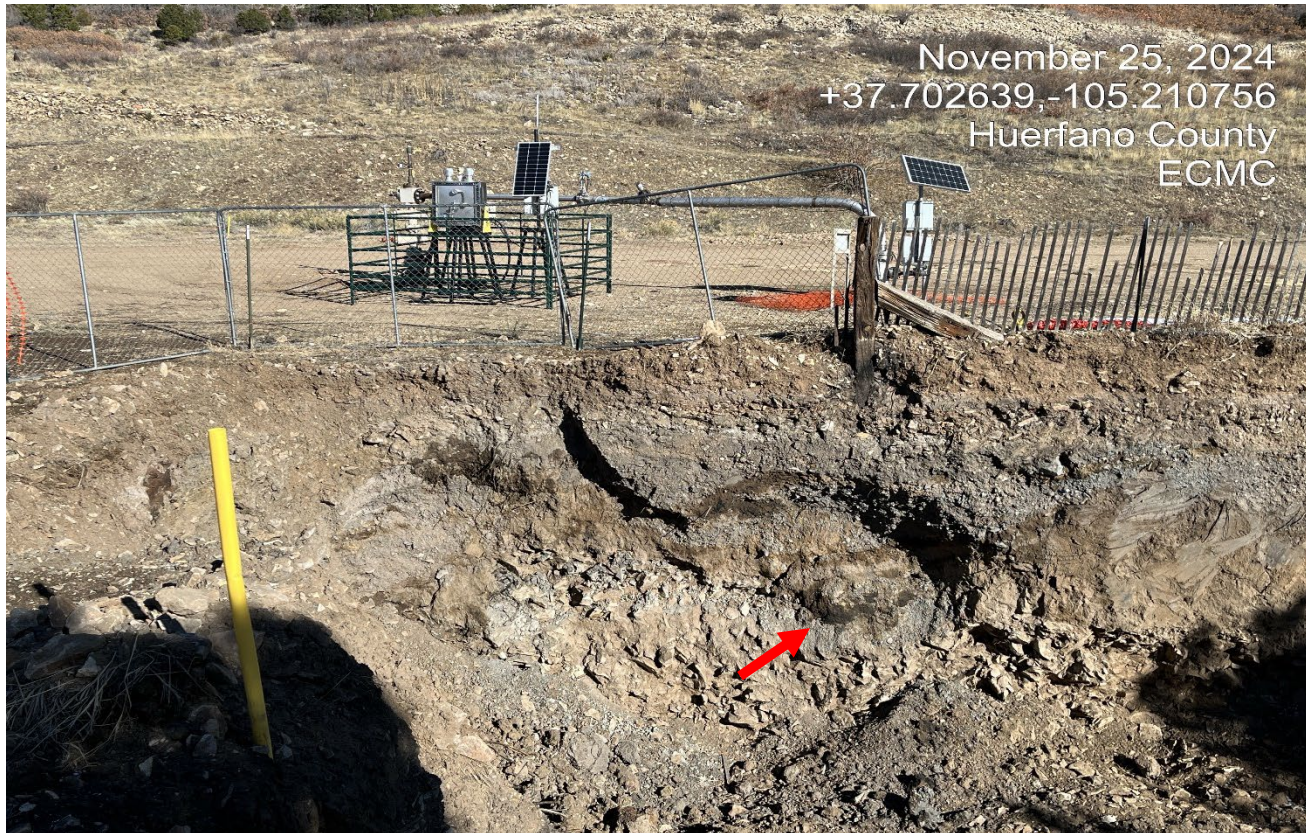
Photo 9. There appears to be impacted stained material shown at red arrows that needs to be further excavated and removed.