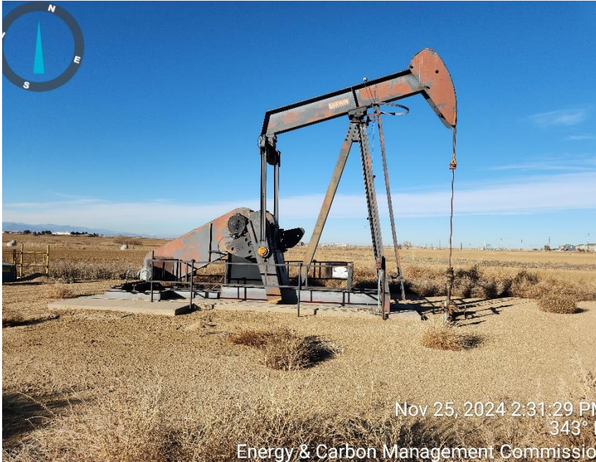
Photo 1 well head and equipment