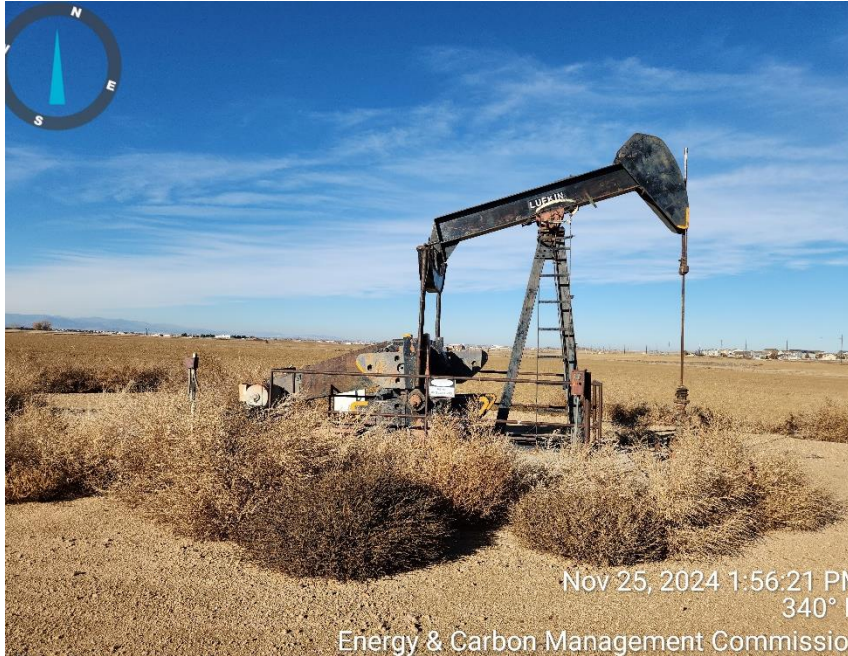
Photo 1 well head and equipment