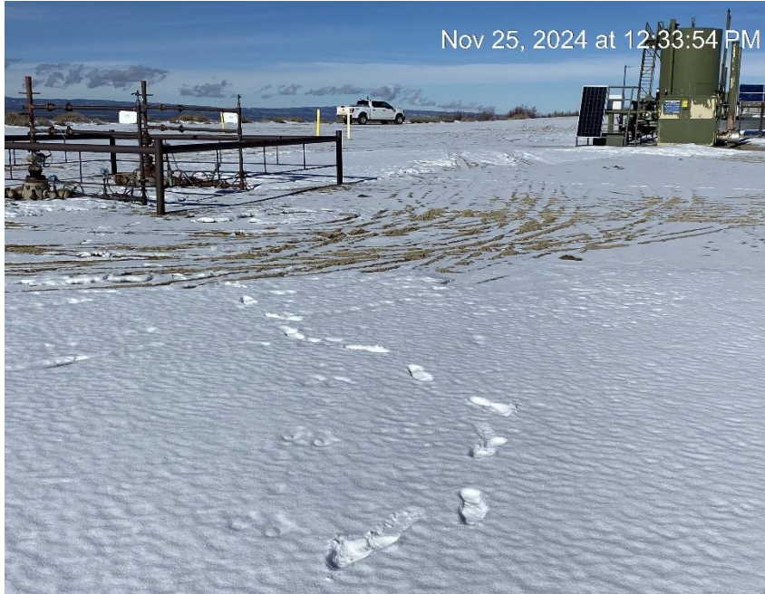
Location from South corner