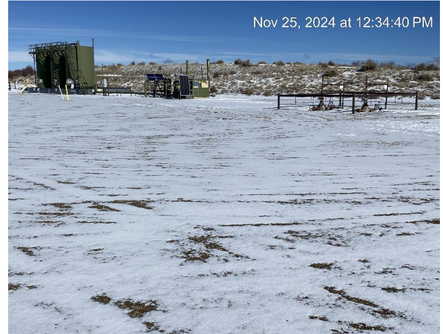
Location from West corner