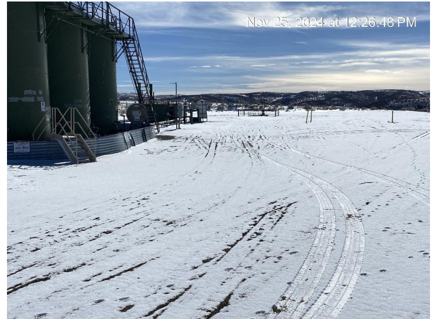
Location from Northeast entrance