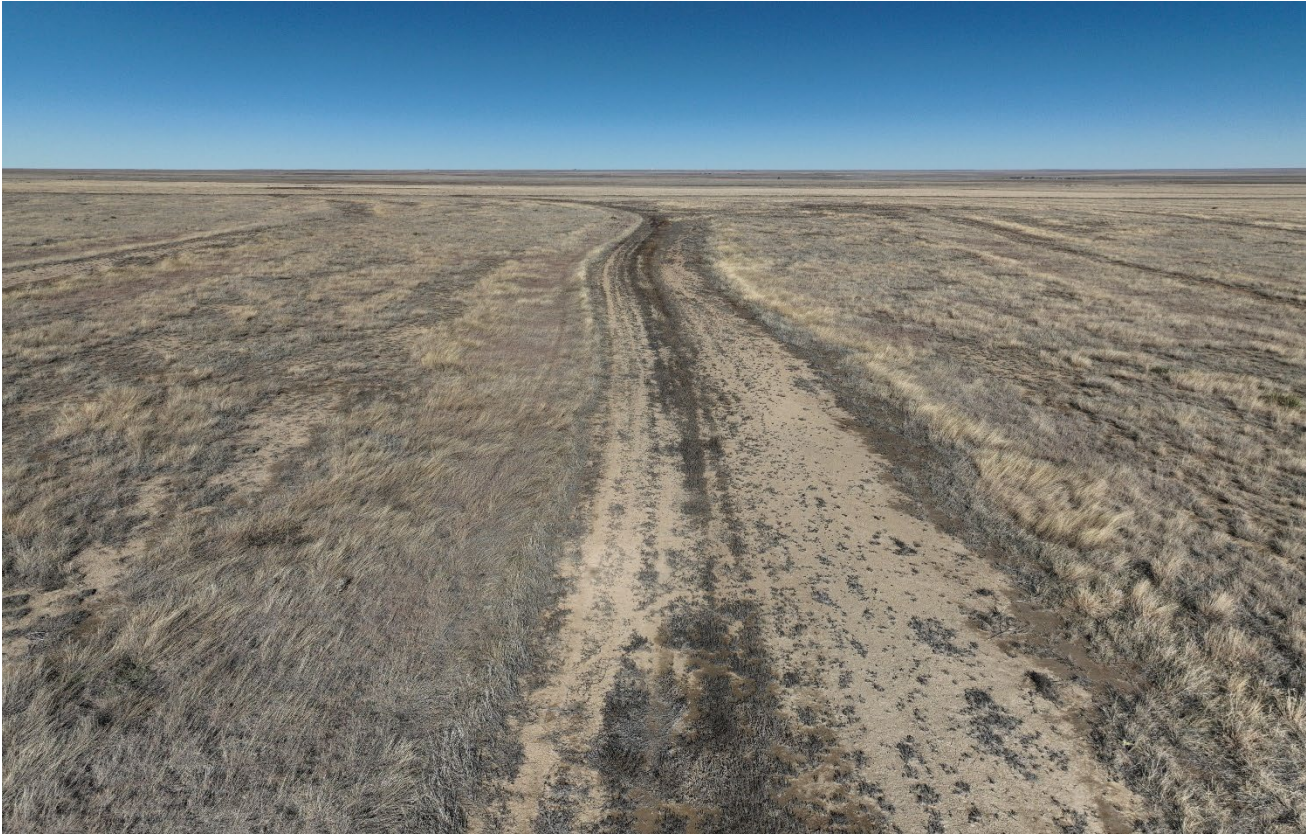
Photo 3. Drone aerial photo facing northeast along the former access road. The perennial vegetation does not appear to be establishing.