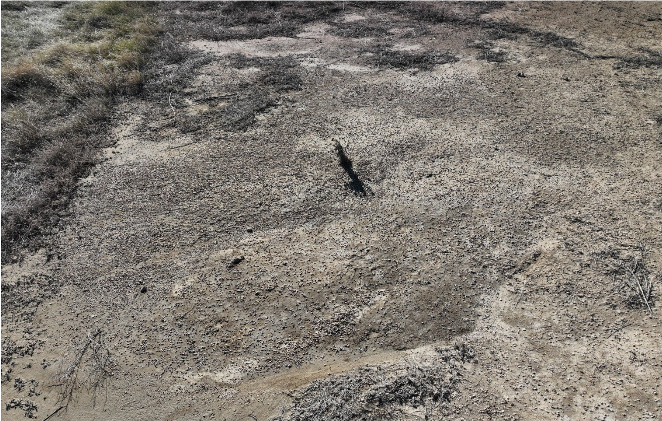
Photo 6. Drone aerial photo facing down toward the bare area with no vegetation.