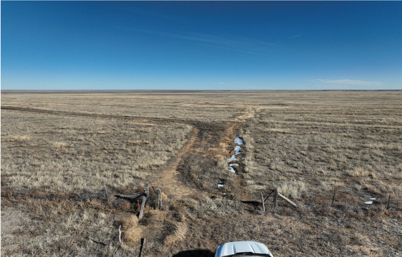
Photo 2. Drone aerial photo facing east at the access road. The cattleguard has not been removed and has filled in with sediment. The access road has not been recontoured or reclaimed in this area.