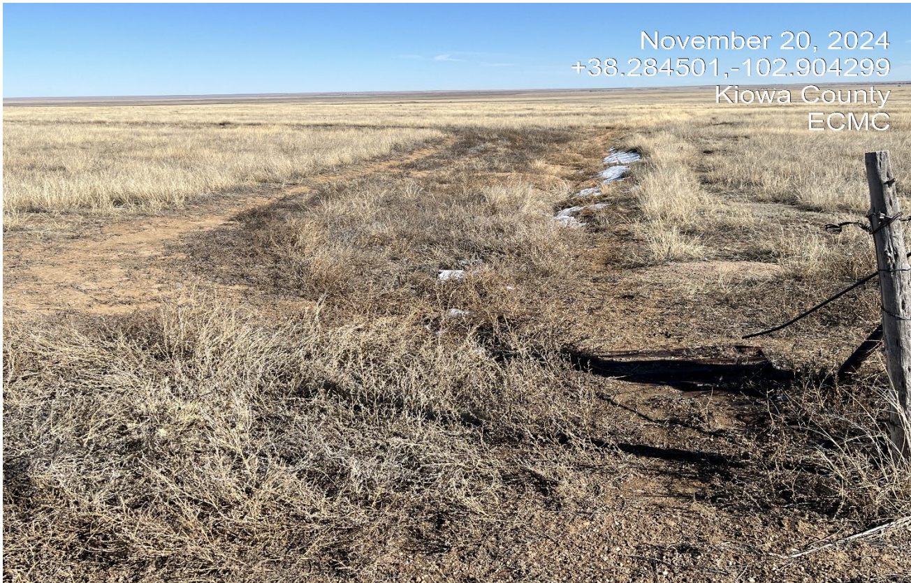
Photo 1. Facing east at the access road. The cattleguard has not been removed and has filled in with sediment. The access road has not been recontoured or reclaimed in this area.