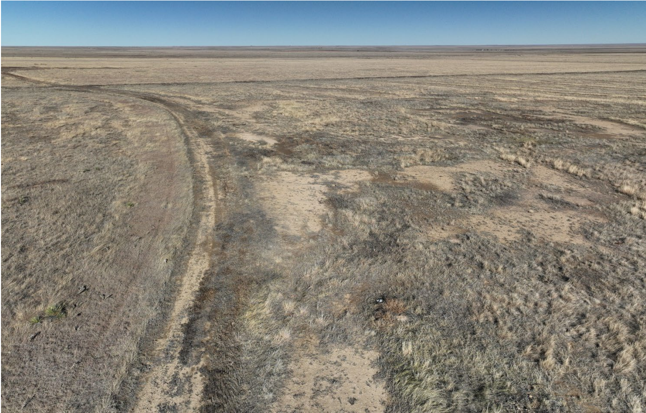
Photo 4. Drone aerial photo facing northeast overlooking the location. There are areas of the location with no vegetation that will need to be reseeded.