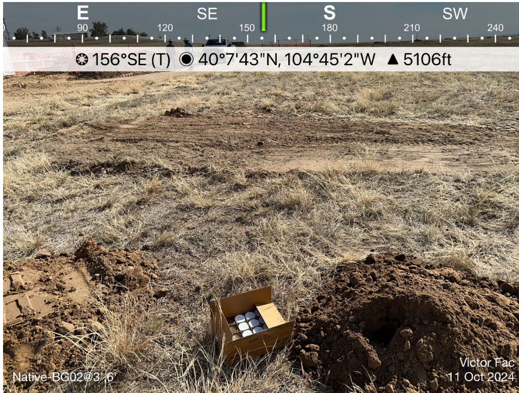
Native Background Sample Location 02