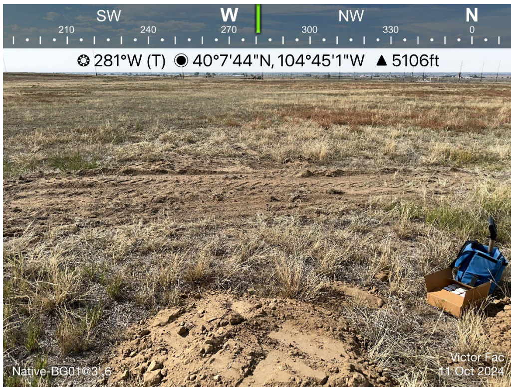
Native Background Sample Location 01