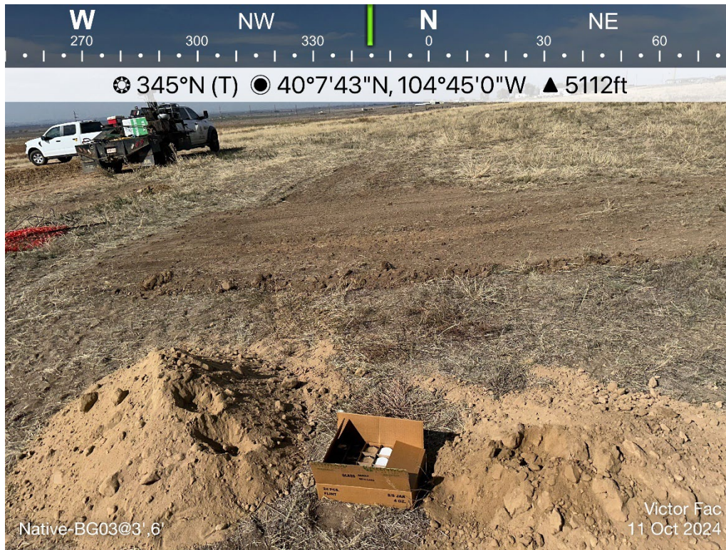
Native Background Sample Location 03