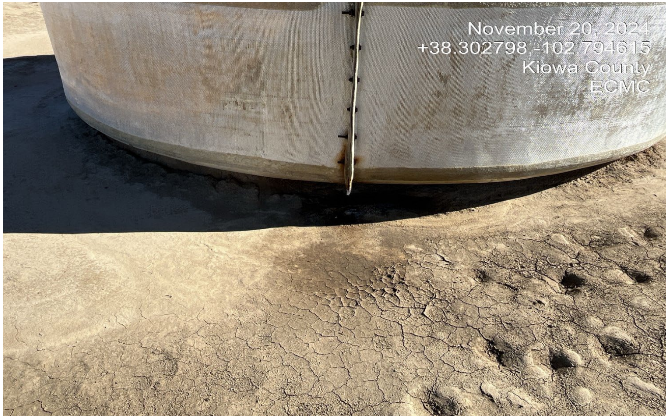
Photo 3. There is a slight leak at the tank seam.