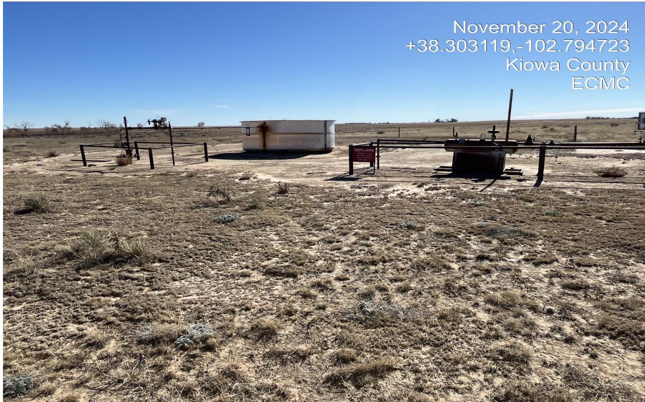
Photo 2. Facing southeast toward the wellsite.