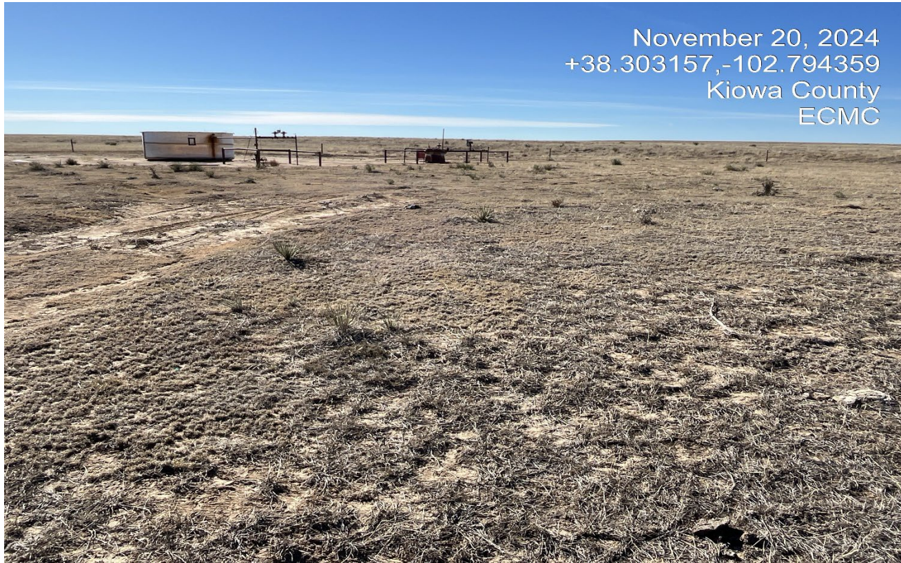
Photo 1. Facing southwest toward the location which is stabilized with perennial native vegetation.