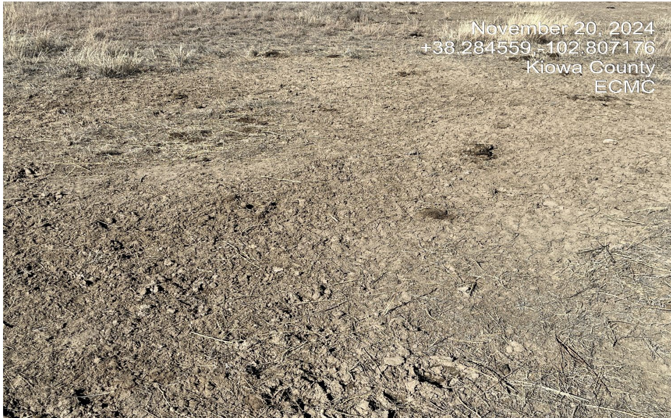
Photo 4. View of ground cover shows bare soil in areas of the location.