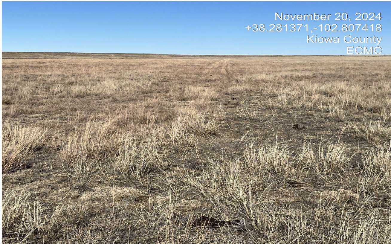
Photo 1. Facing north toward the former access road which has established perennial vegetation.