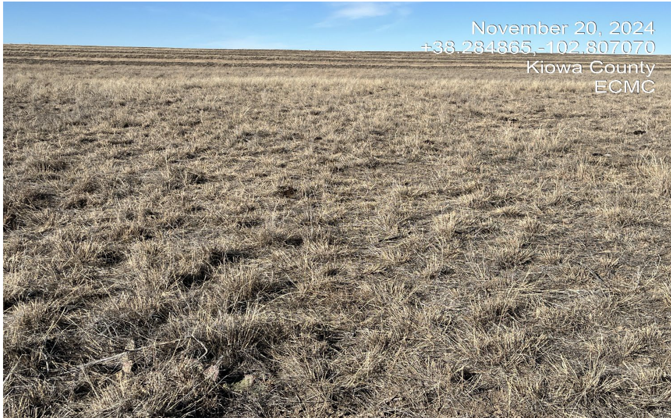
Photo 5. Facing northwest toward the surrounding reference area.