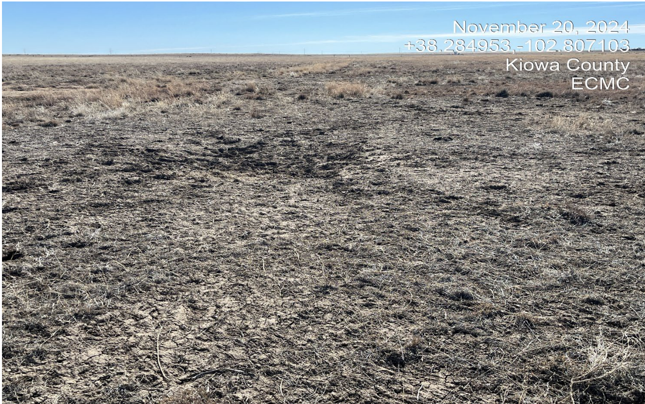
Photo 3. North side of the location facing south. There are areas of the location that have not established perennial vegetation.