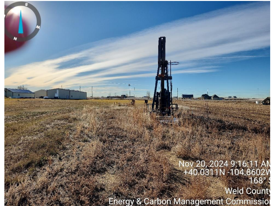
Photo 2 well head and equipment