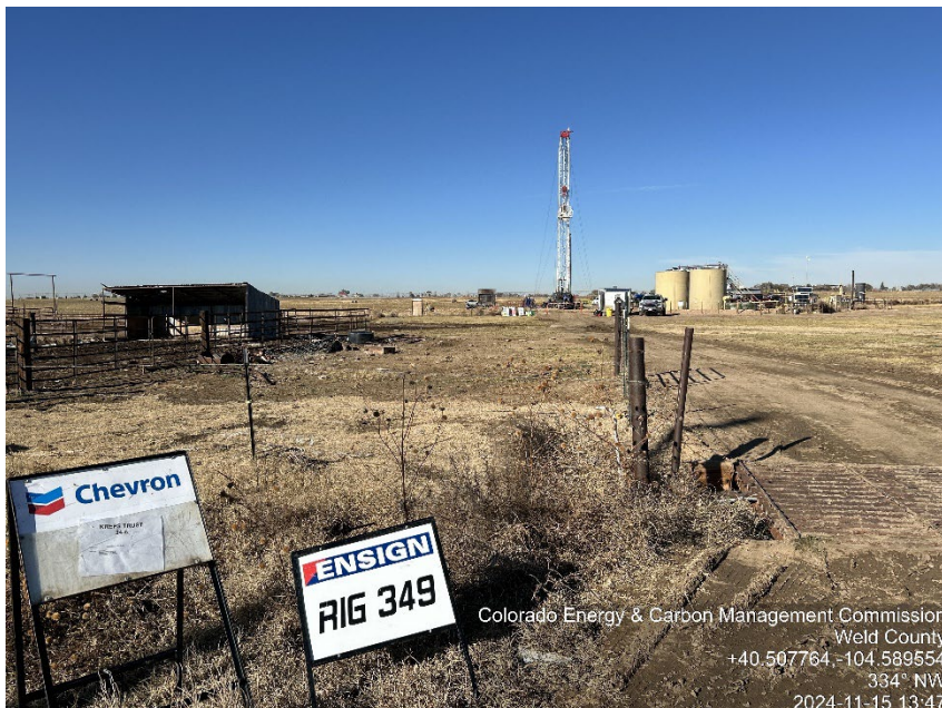
Photo #3 Kreps Trust 34-6 Wellsite Plugged & Abandoned | PA Plugging Ops; Cementing: cmt-surf Wellsite entrance prior photo