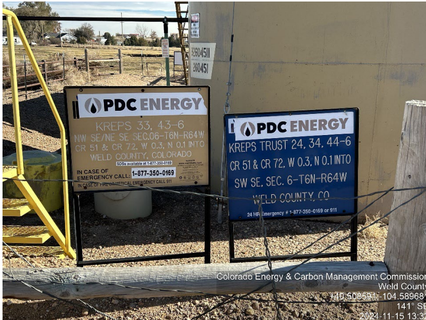
Photo #5 Kreps Trust 34-6 Battery site Plugged & Abandoned | PA Plugging Ops; Cementing: cmt-surf Battery sign prior photo