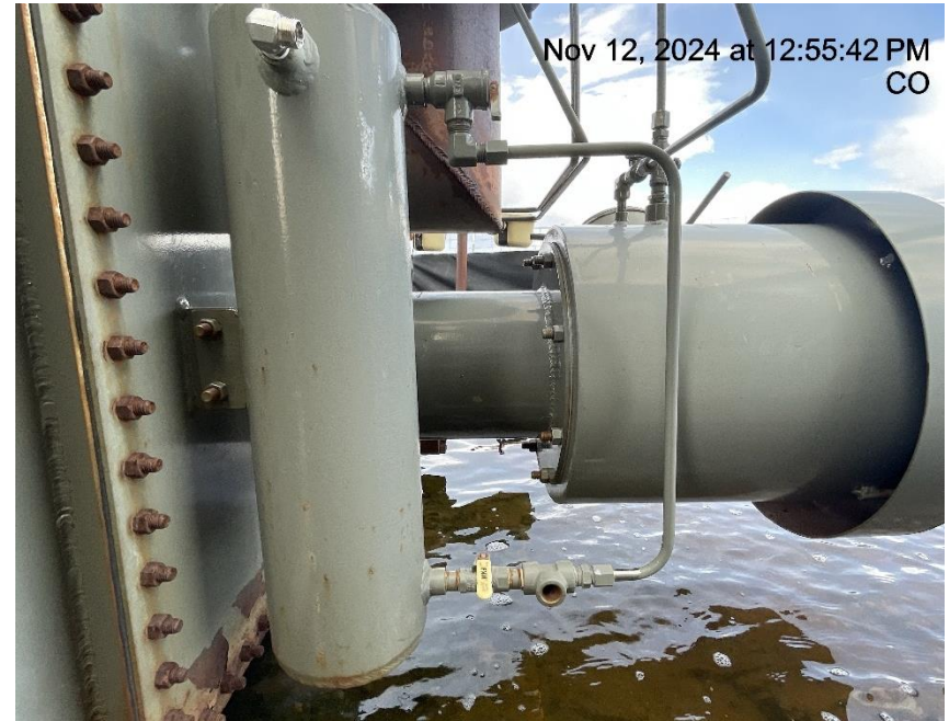
Photo # 9908 PRV vent line does not comply with CECMC pressure safety device rules