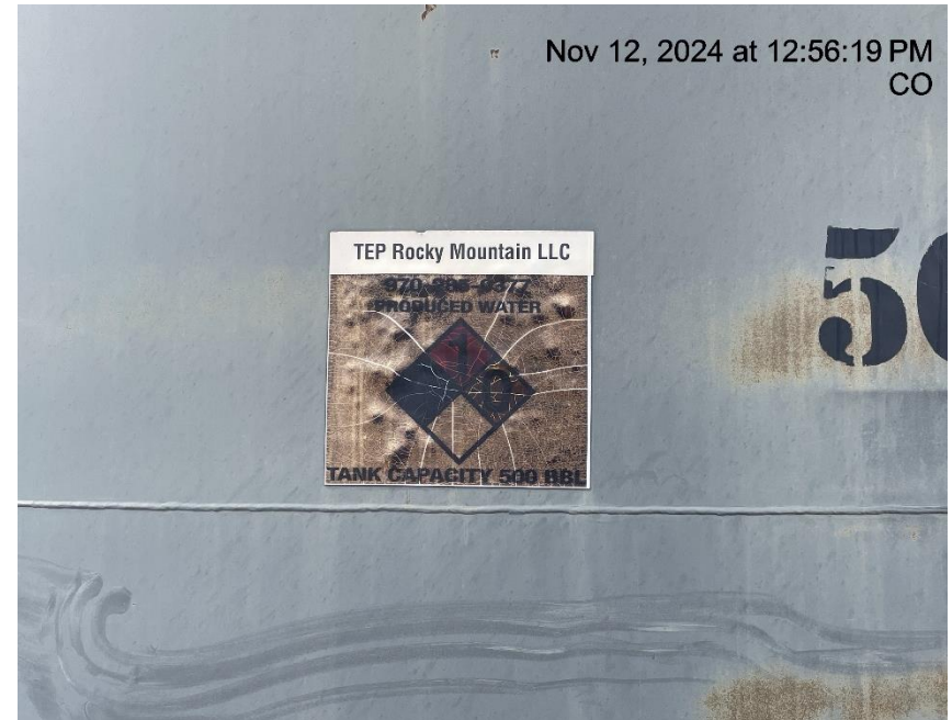
Photo # 9906 Tank label weathered & some required information is starting to become illegible