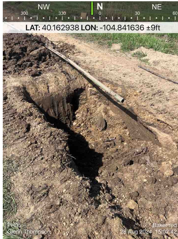
Pothole Screening Location 05