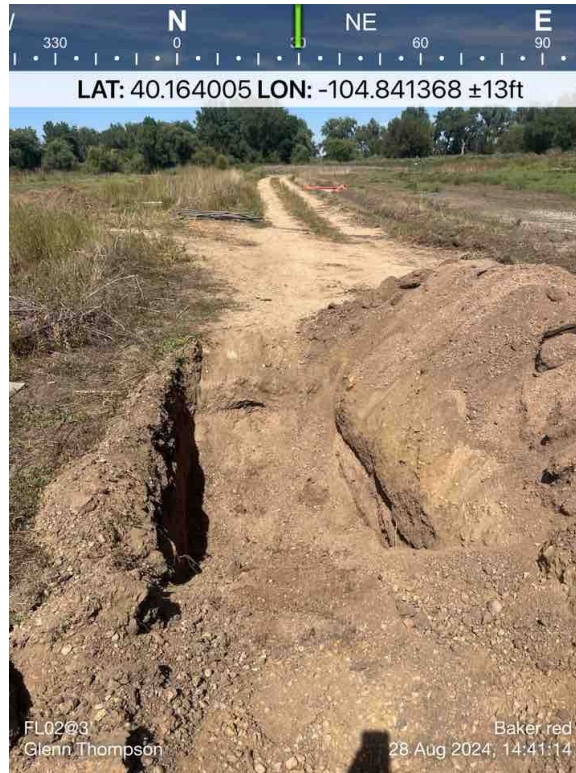
Flowline Sample Location 02