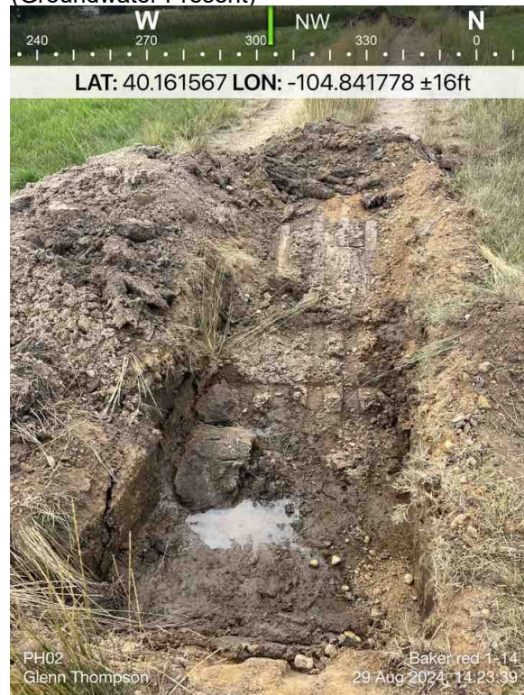
Pothole Screening Location 02 (Groundwater Present)