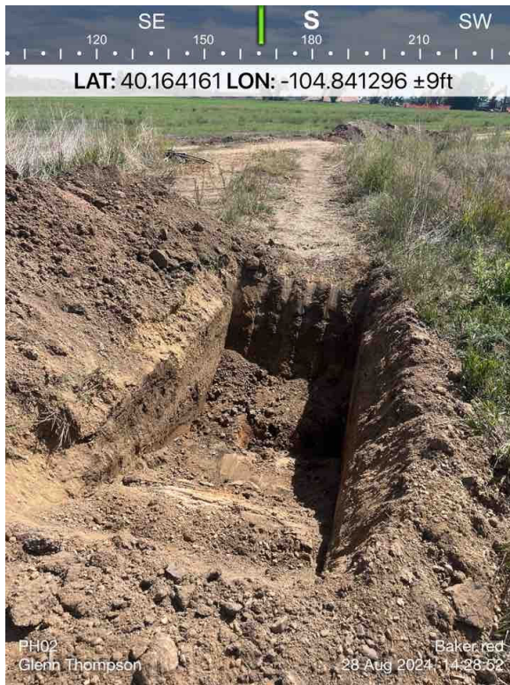
Pothole Screening Location 02