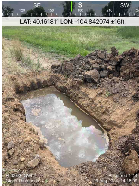
Flowline Sample Location 02 & Groundwater Sample Location 02 (Groundwater Present)