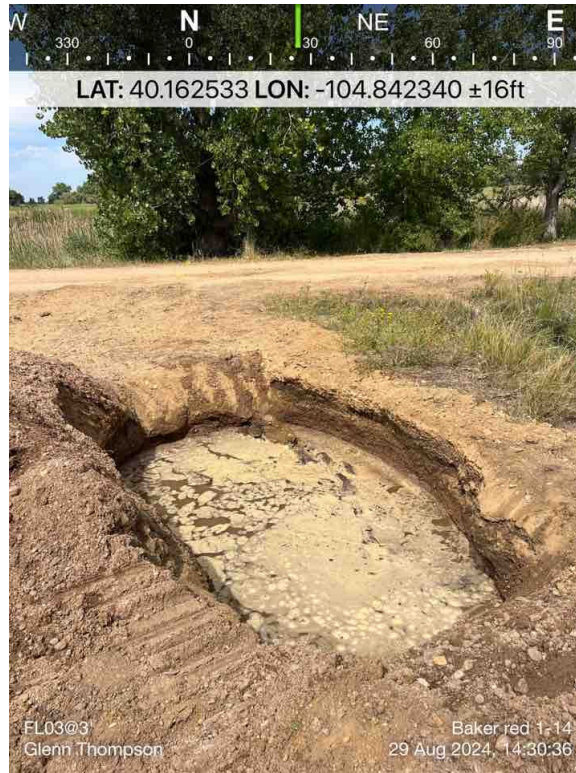
Flowline Sample Location 03 (Groundwater Present)