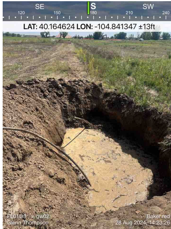
Flowline Sample Location 01 & Groundwater Sample Location 02 (Groundwater Present)