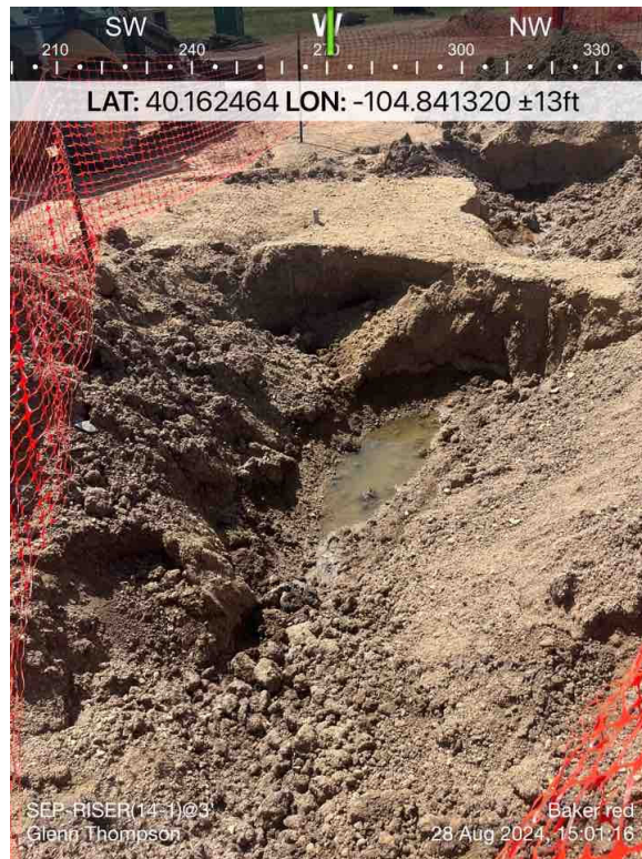
Separator Riser Sample Location (Groundwater Present)