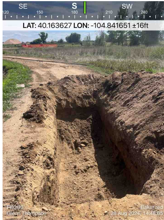
Flowline Sample Location 03