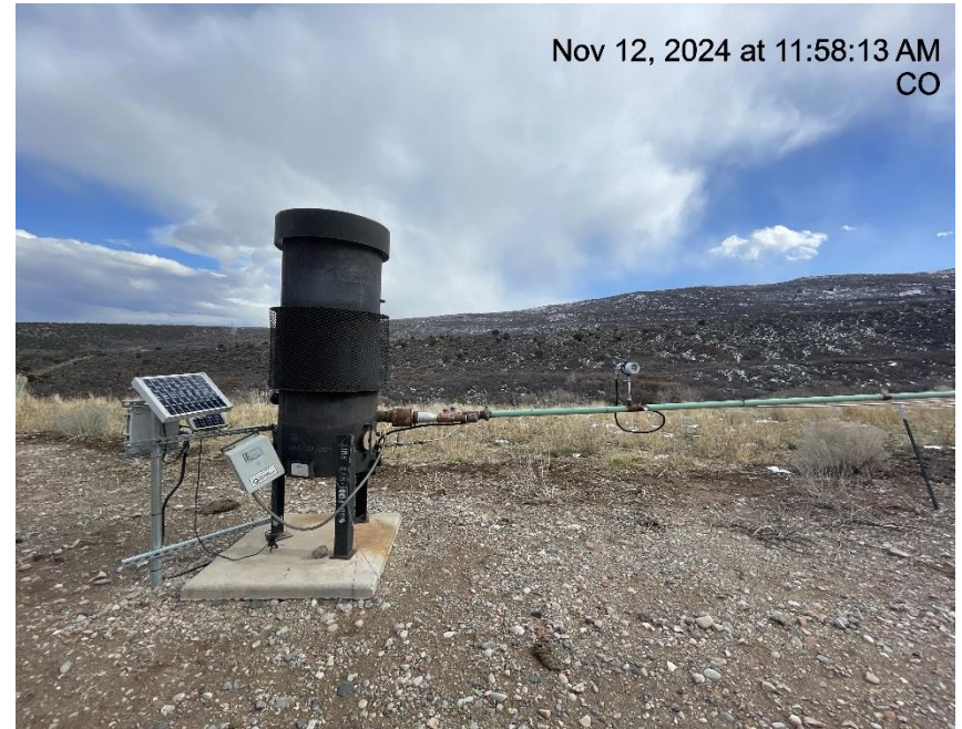
Photo # 9814 ECD does not appear to be listed on FORM 2A or FORM 4/not in compliance with CECMC rules