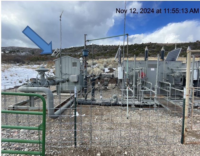
Photo # 9809 Summit Midstream meter house is not listed in operators FORM 2A/not in compliance with CECMC rules