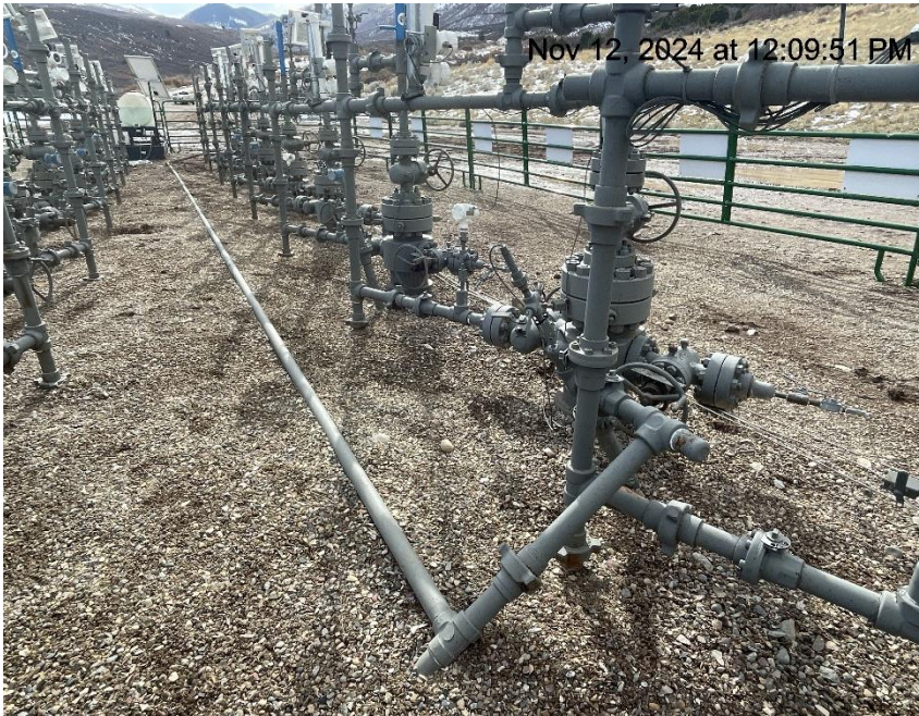
Photo # 9811 YOUNBERG SR 411-12 bradenhead line tied into separator (valves shut at time of inspection)