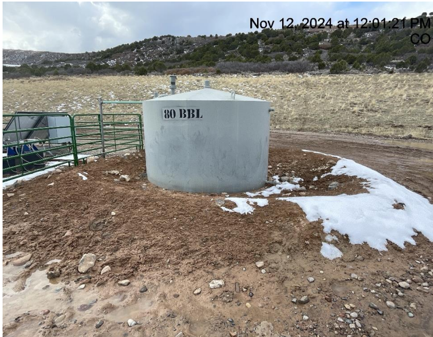
Photo # 9807 Secondary containment does not comply with CECMC secondary containment rules. (Additionally 80 bbl tank does not appear to be in operators Form 2A or any Form 4 Sundry as required by CECMC rules)