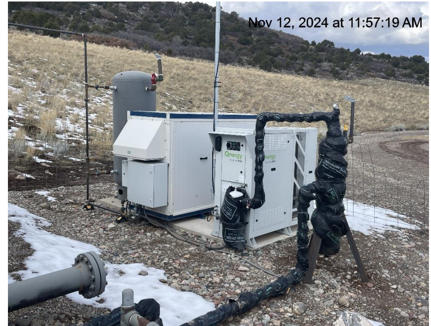
Photo # 9810 Qnergy natural gas generator & air compressor not listed in operators FORM 2A or a FORM 4 SUNDRY/not in compliance with CECMC rules