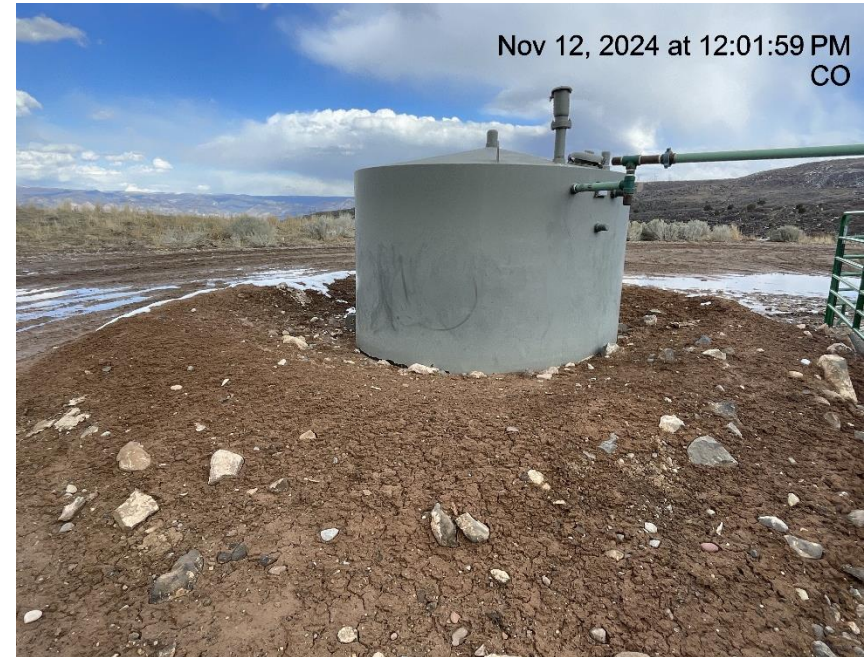
Photo # 9808 Secondary containment does not comply with CECMC secondary containment rules. (Additionally 80 bbl tank does not appear to be in operators Form 2A or any Form 4 Sundry as required by CECMC rules)

Photo # 9807 Secondary containment does not comply with CECMC secondary containment rules. (Additionally 80 bbl tank does not appear to be in operators Form 2A or any Form 4 Sundry as required by CECMC rules)