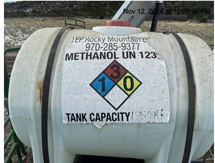
Photo # 9806 Chemical tank label damaged & some info is starting to become illegible (additionally chemical tanks on location do not appear to be listed on operators FORM 2A or FORM 4/not in compliance with CECMC rules)