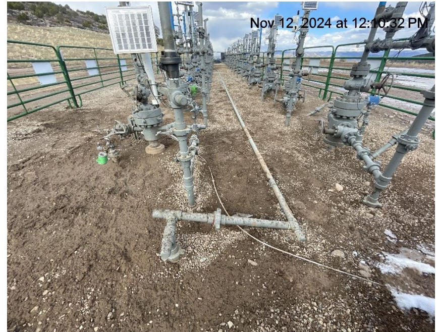
Photo # 9812 YOUNBERG SR 411-12 bradenhead line tied into separator (valves shut at time of inspection)