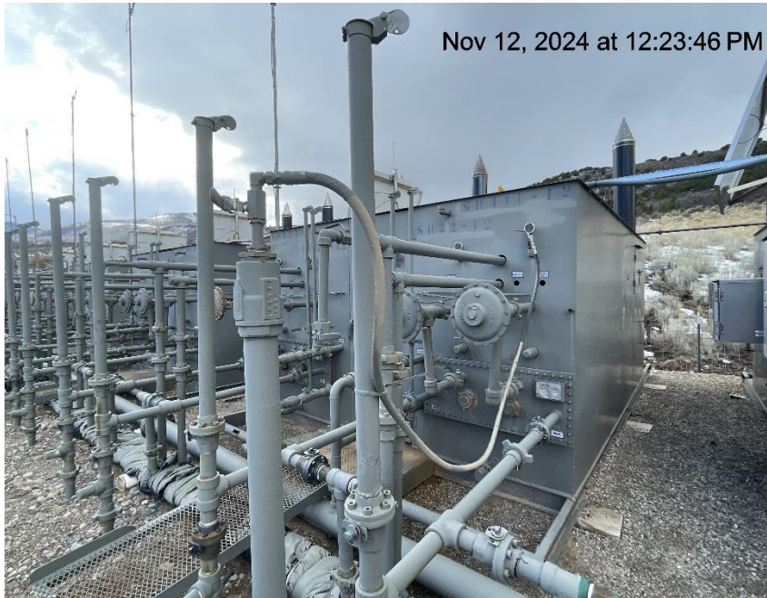
Photo # 9813 YOUNBERG SR 411-12 bradenhead line tied into separator (valves shut at time of inspection)