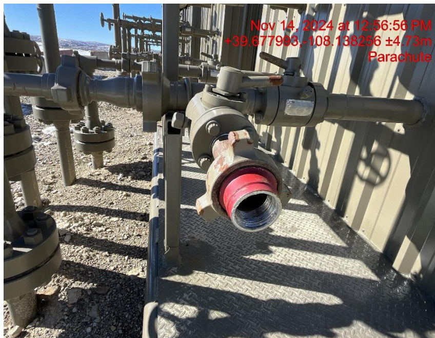
Photo # 9079 Open ended piping/wildlife hazard/ available for entry by wildlife