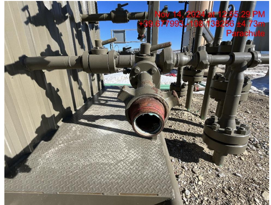
Photo # 9077 Open ended piping/wildlife hazard/ available for entry by wildlife