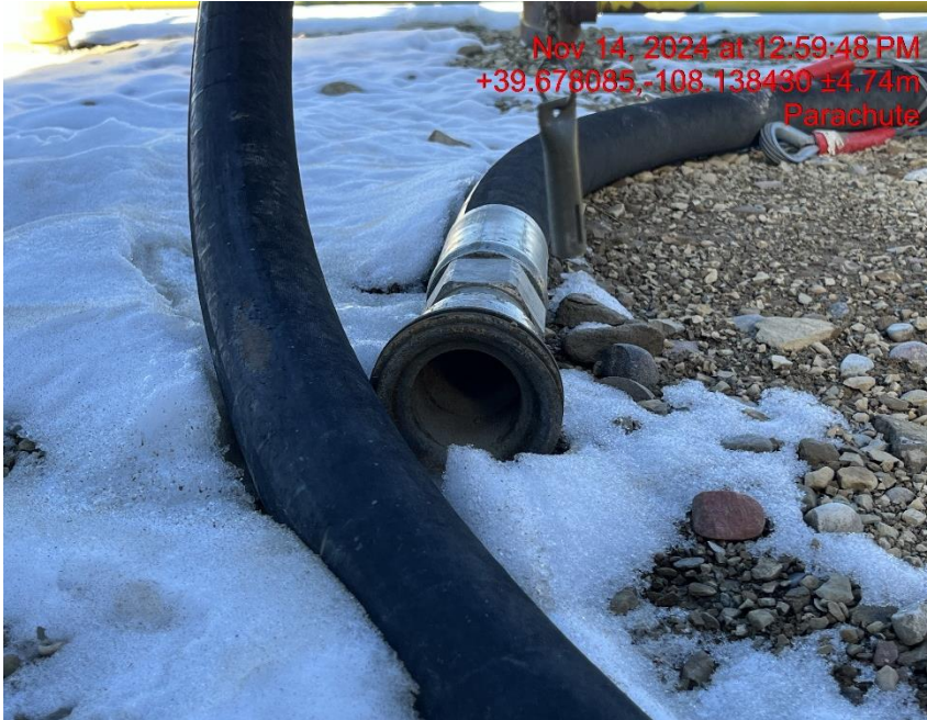
Photo # 9084 Open ended piping/wildlife hazard/ available for entry by wildlife