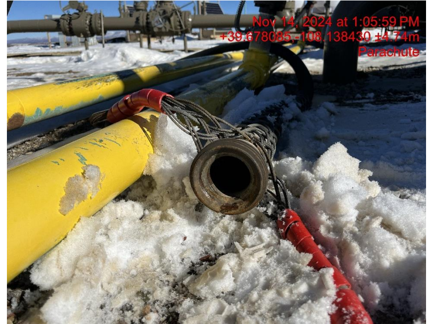
Photo # 9090 Open ended piping/wildlife hazard/ available for entry by wildlife