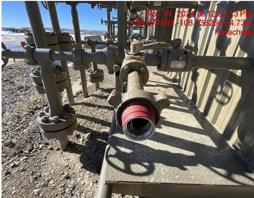
Photo # 9076 Open ended piping/wildlife hazard/ available for entry by wildlife