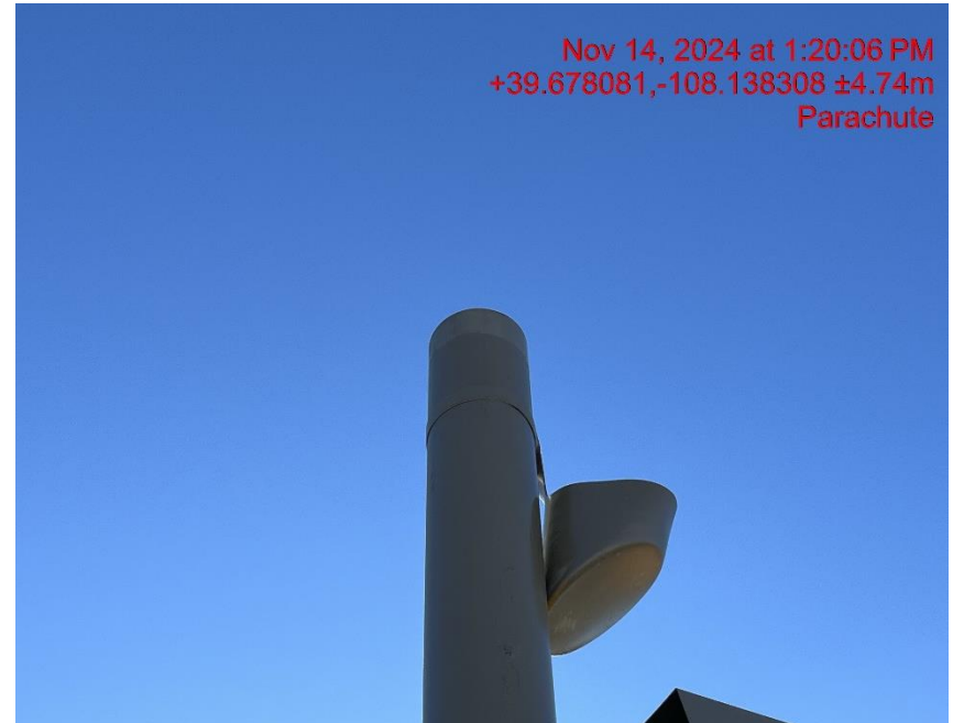
Photo # 9107 PRV vent line does not comply with CECMC pressure safety device rules