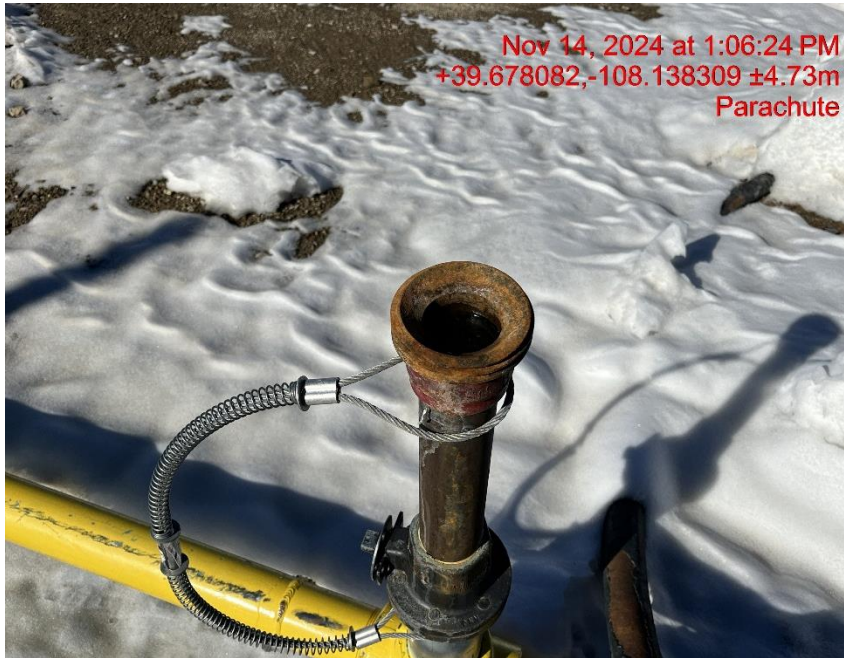
Photo # 9091 Open ended piping/wildlife hazard/ available for entry by wildlife