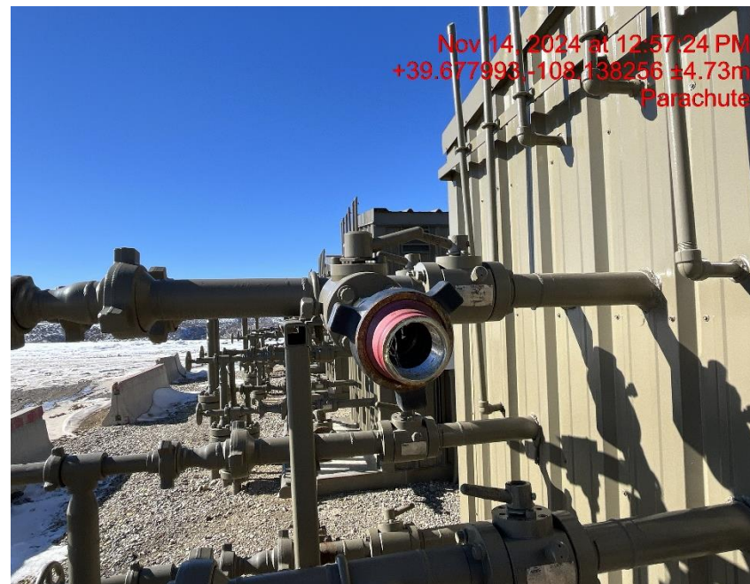
Photo # 9080 Open ended piping/wildlife hazard/ available for entry by wildlife