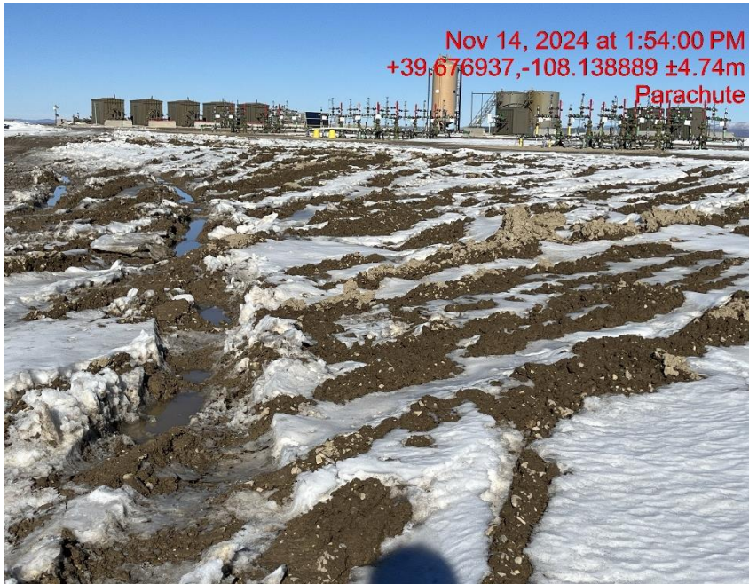
Photo # 9150 Lack of stabilization/compaction on location/insufficient BMP's