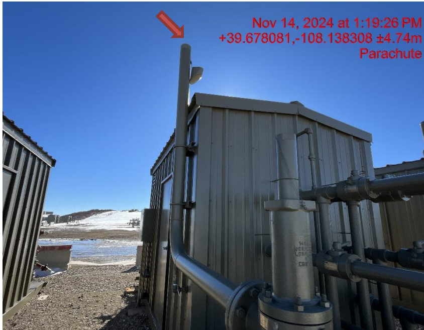
Photo # 9105 PRV vent line does not comply with CECMC pressure safety device rules