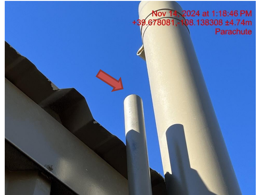
Photo # 9104 PRV vent line does not comply with CECMC pressure safety device rules