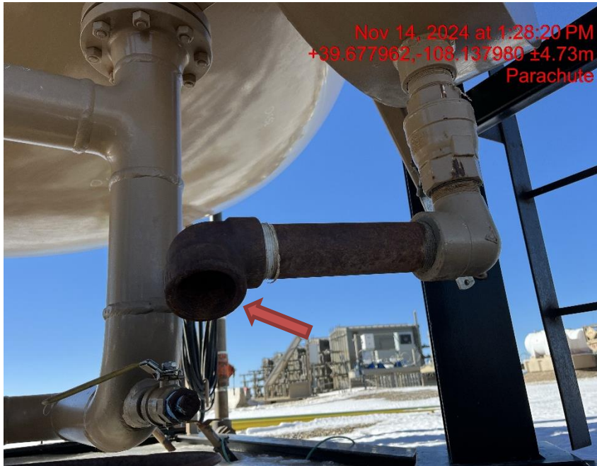
Photo # 9119 Open ended piping/wildlife hazard/ available for entry by wildlife