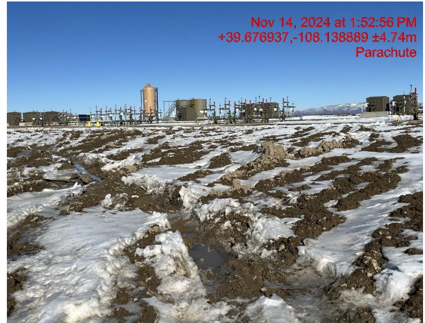
Photo # 9148 Lack of stabilization/compaction on location/insufficient BMP's