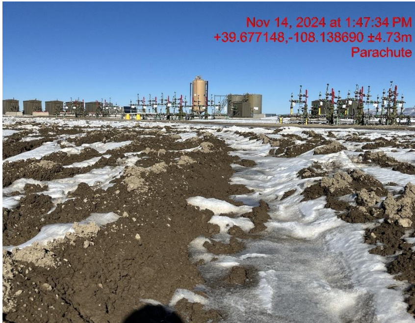
Photo # 9141 Lack of stabilization/compaction on location/insufficient BMP's