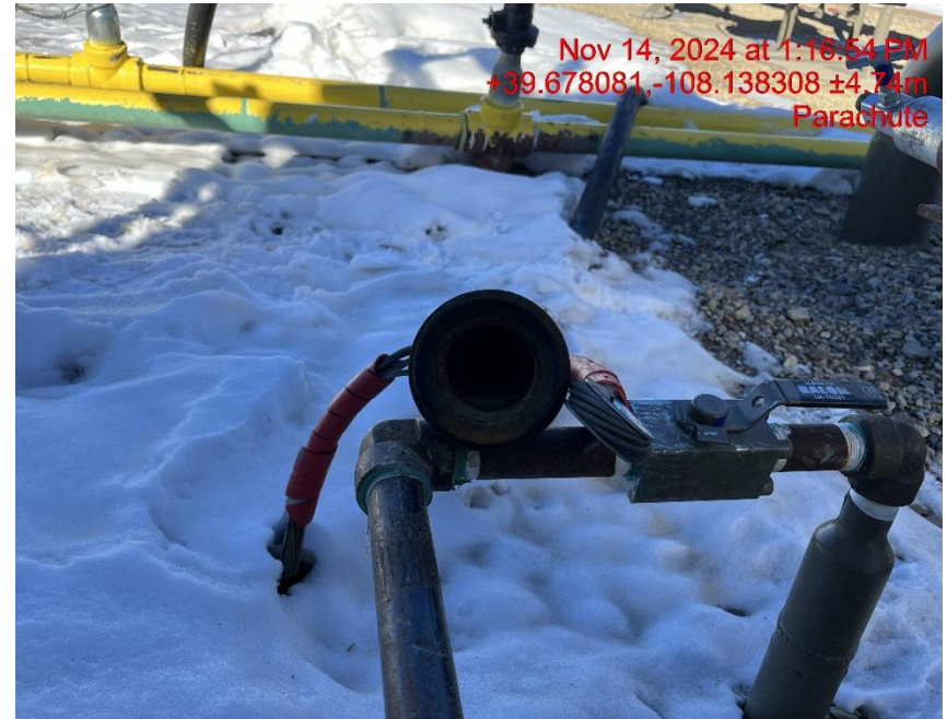
Photo # 9100 Open ended piping/wildlife hazard/ available for entry by wildlife