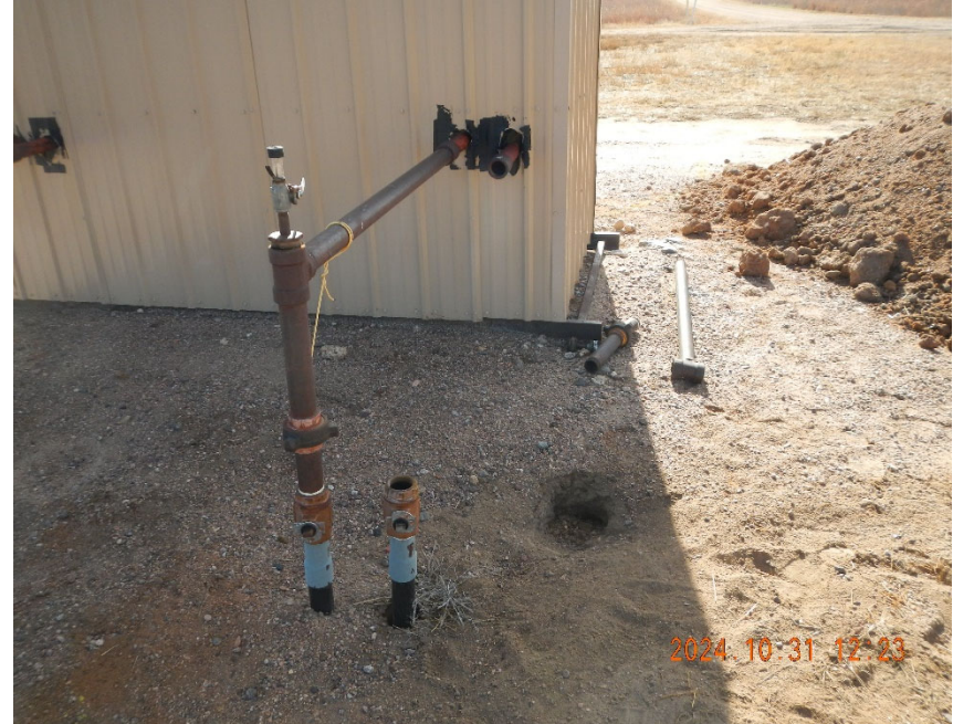
6. View of disconnected flowline from well to metering location/