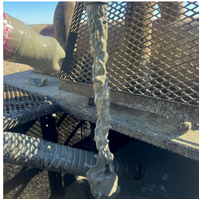
4. Cement circulated to surface.