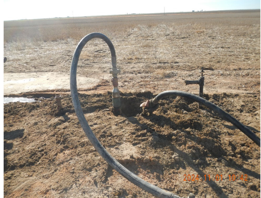
2. Lines rigged into wellhead for cement work.