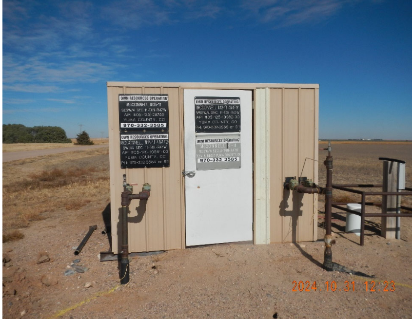
5. Share remote meter shed.