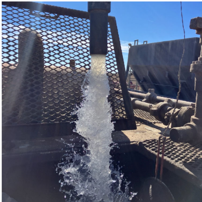
3. Circulation to surface.