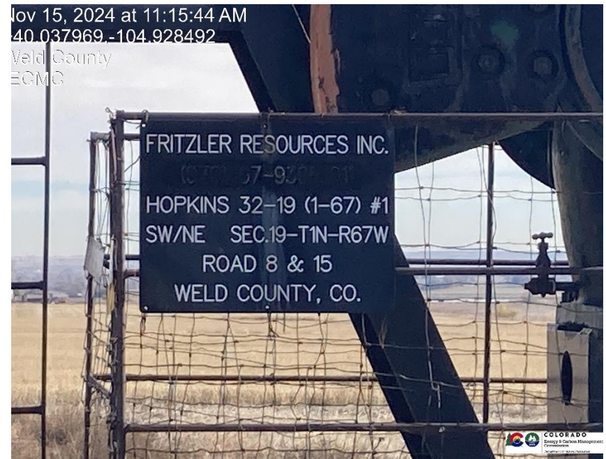
Pic 2 Wellhead sign

Nov 15, 2024 at 11:15:44 AM 40.037969,-104.928492 Weld County ECMC