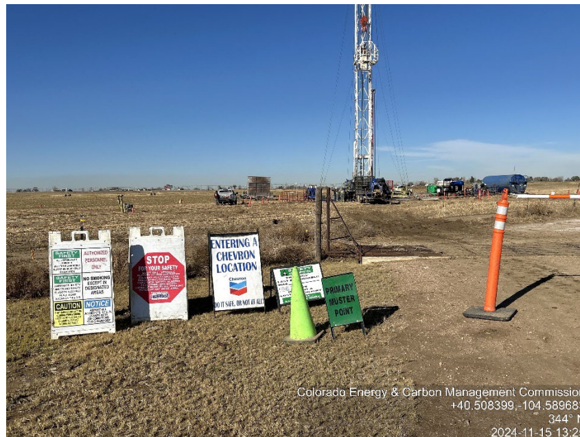
Photo #2 Kreps Trust 34-6 Wellsite Workover | WK Plugging Ops: Kill well, flare gas Site safety signage