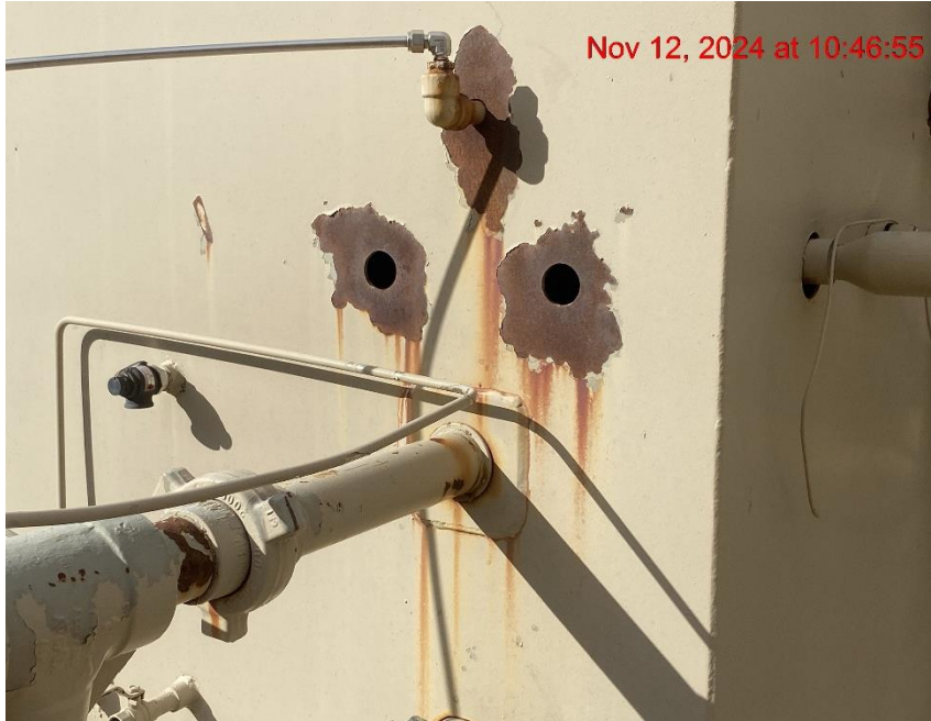
Wildlife Entry Hazard – Photo #04842