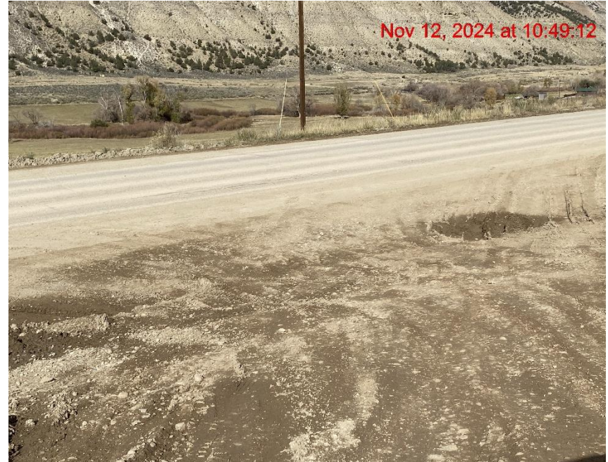
Insufficient Tracking BMPs – Photo #04845