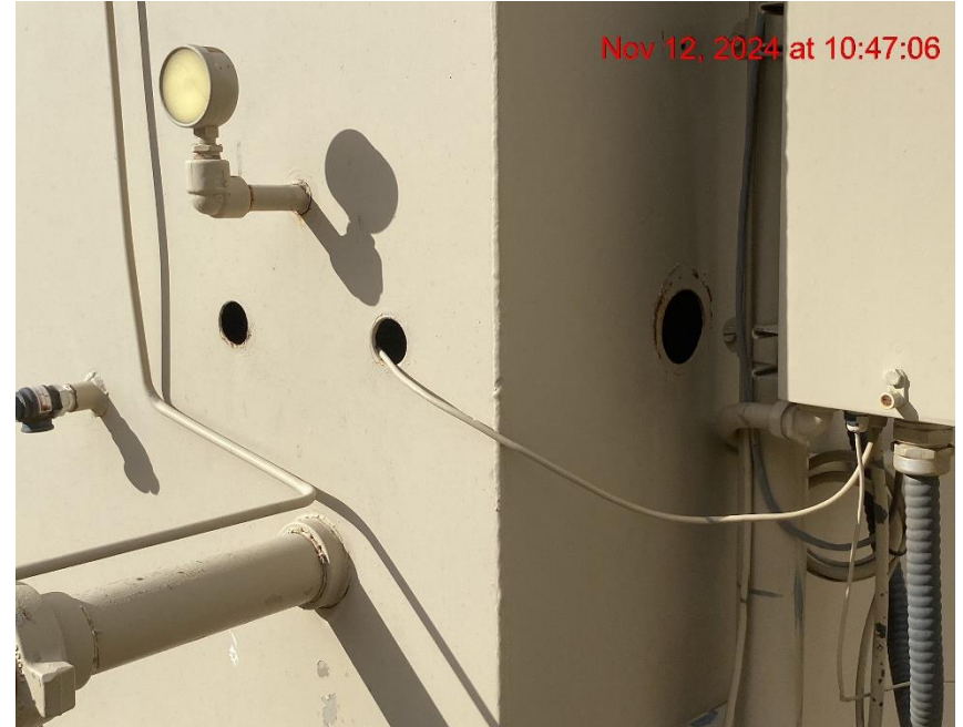
Wildlife Entry Hazard – Photo #04843