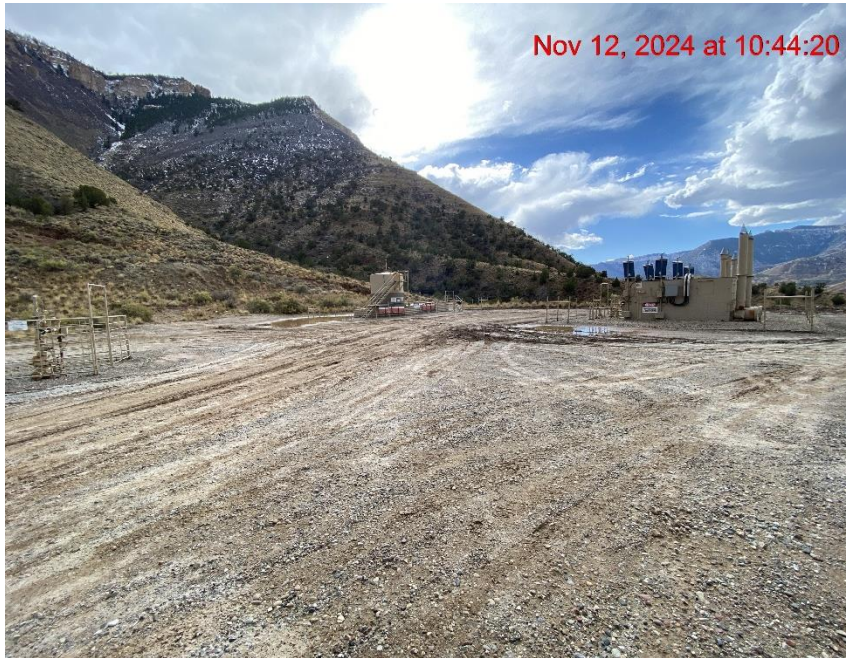
Location Entrance – Photo #04834