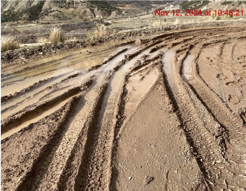
Lack of Stabilization – Photo #04838