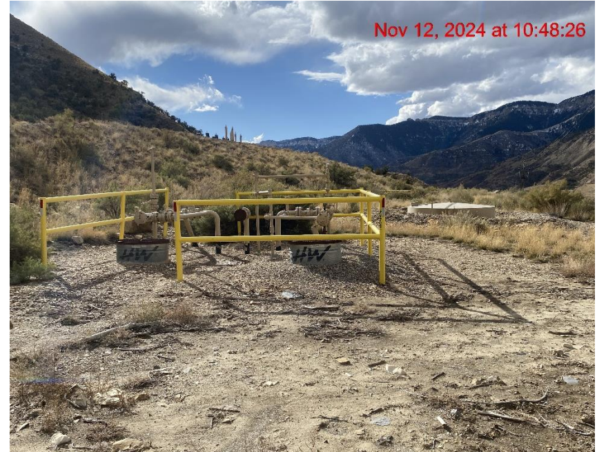
Location – Photo #04844