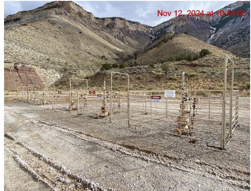
Location – Photo #04835