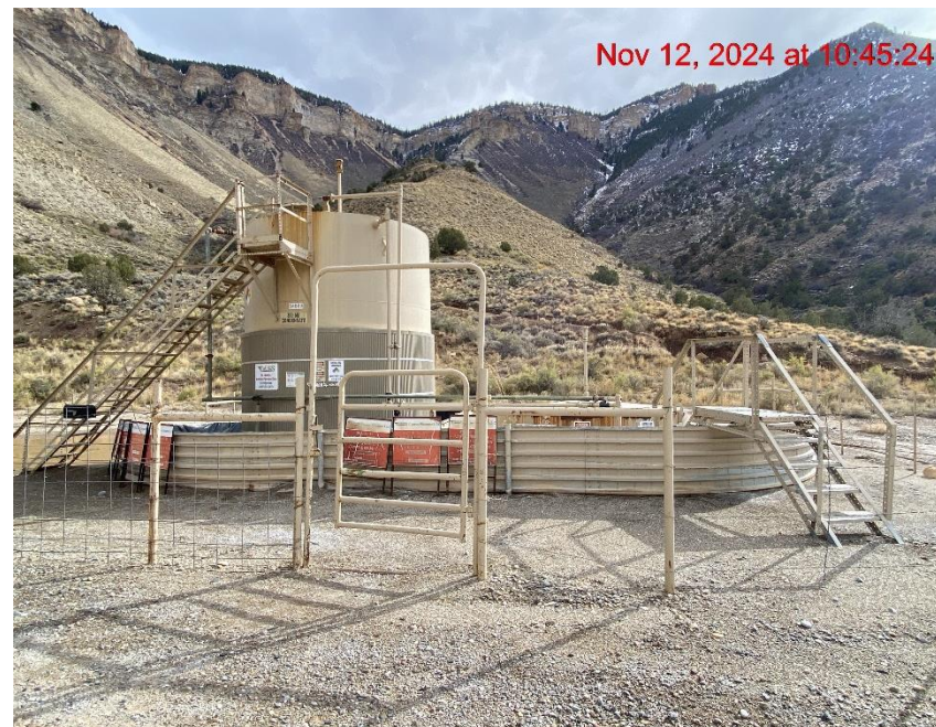
Location – Photo #04837