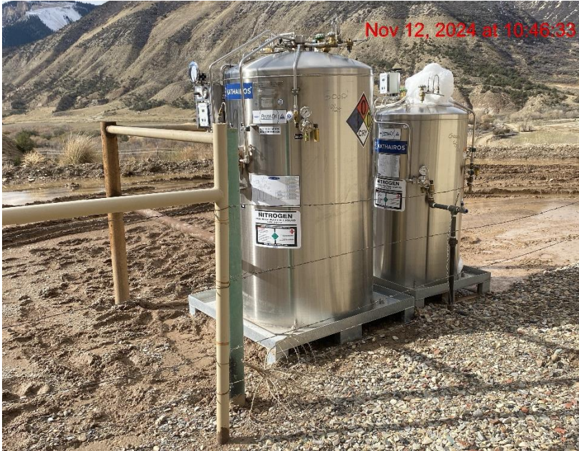
Location – Photo #04839