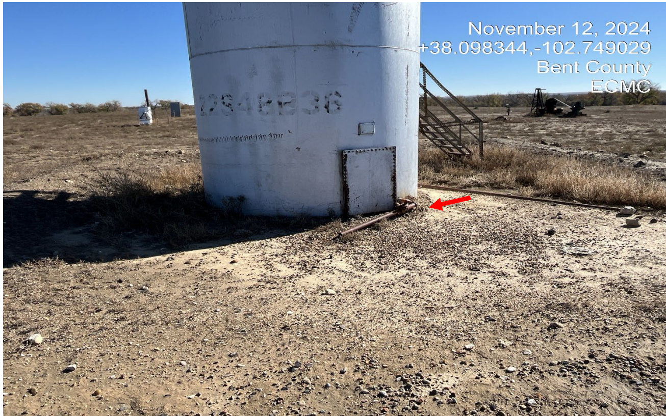
Photo 5. There was an oil leak by the outlet. There is still stained soils that need to be cleaned up.