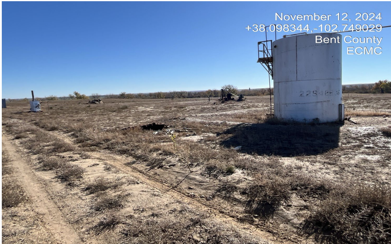
Photo 4. Facing southeast toward the wellsite and tank battery. There is a dead cow carcass laying next to the tank!