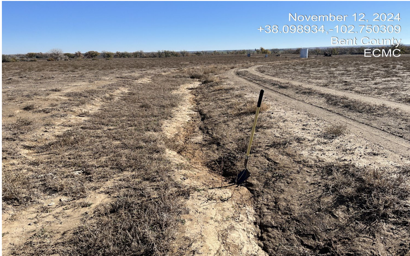
Photo 2. Facing southeast along the access road. There is erosion along the road that must be repaired and stabilized.