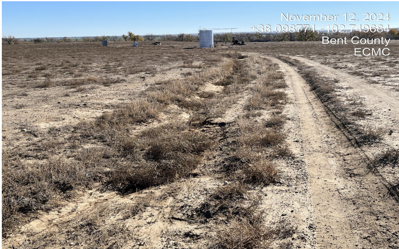
Photo 3. Facing southeast along the access road. There is erosion along the road that must be repaired and stabilized.