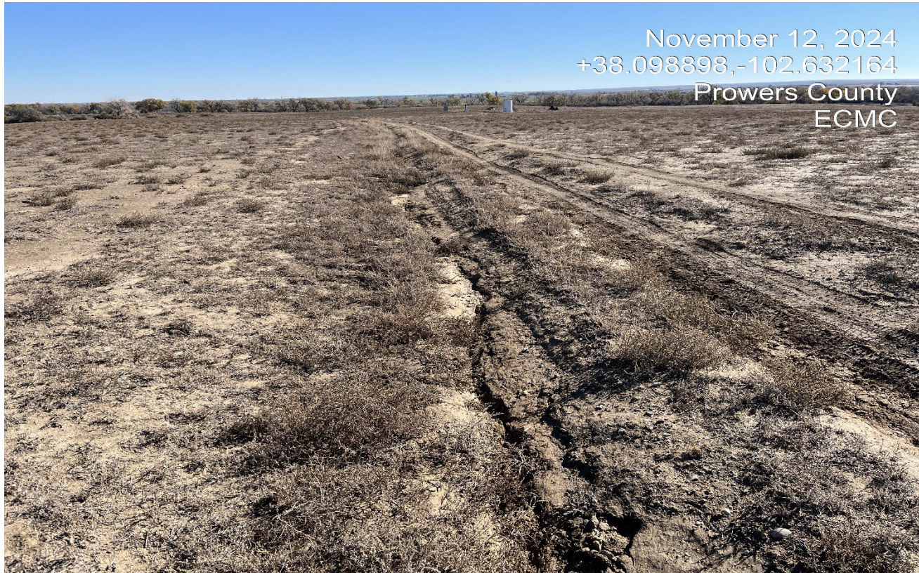
Photo 1. Facing southeast along the access road. There is erosion along the road that must be repaired and stabilized.