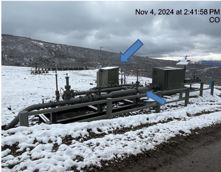
Photo # 8997 Pig station not listed is operators FORM 2A & Buy Back Meter listed in FORM 2A as Temporary Equipment/ operator is not in compliance with CECMC rules