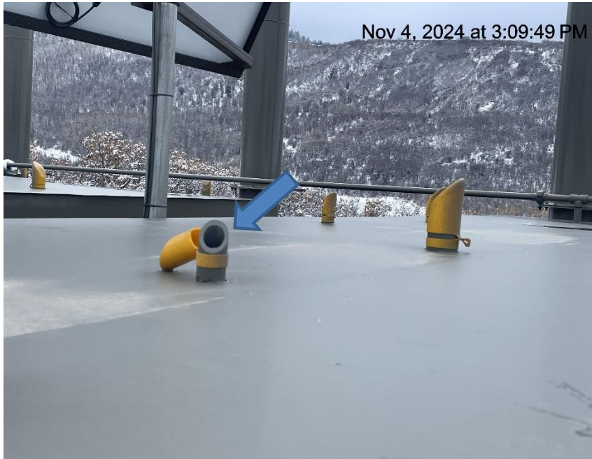
Photo # 8989 Rupture disc vent line does not comply with CECMC pressure safety device rules