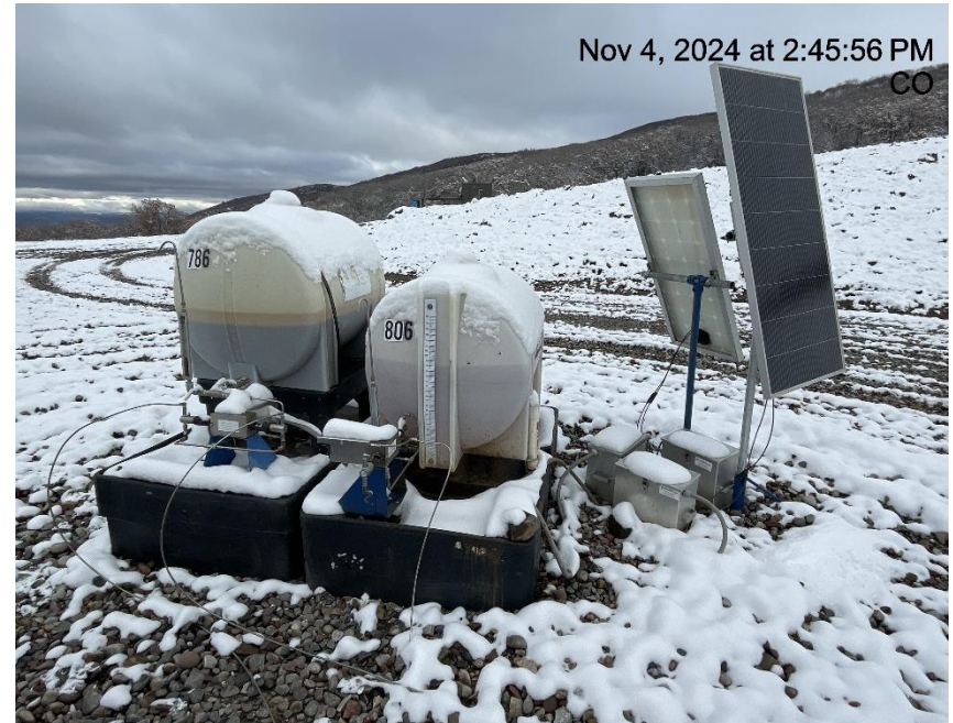
Photo # 8998 Two Chemical tanks not listed in FORM 2A/not in compliance with CECMC rules