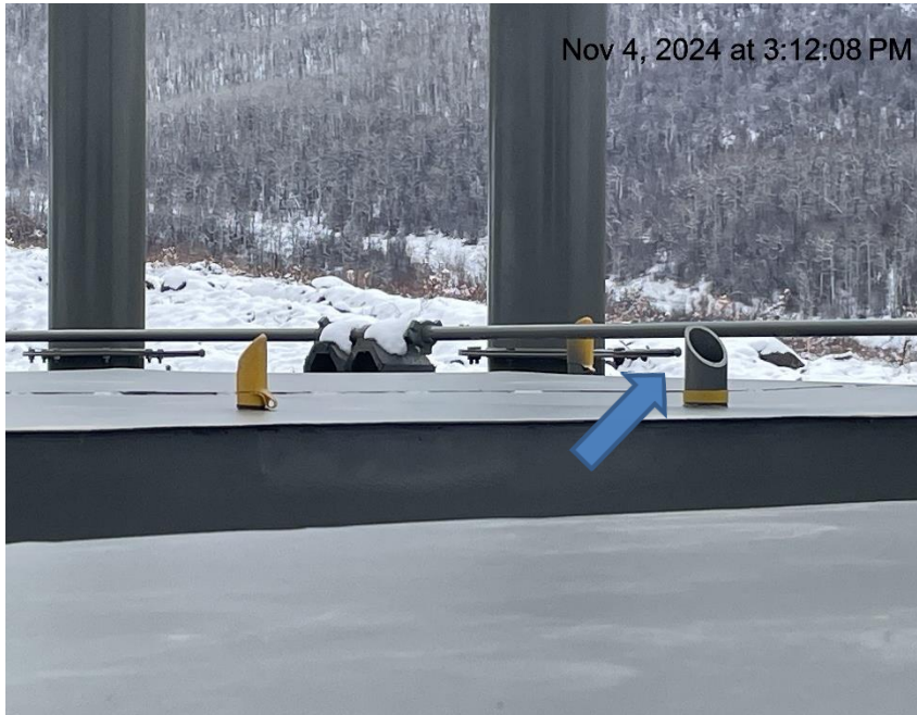
Photo # 8991 PRV vent line does not comply with CECMC pressure safety device rules