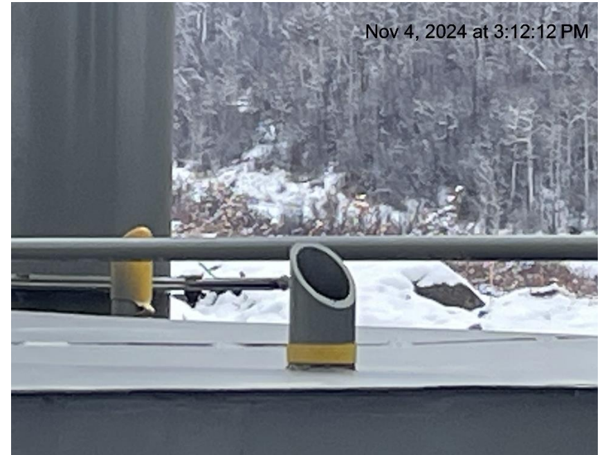
Photo # 8992 PRV vent line does not comply with CECMC pressure safety device rules