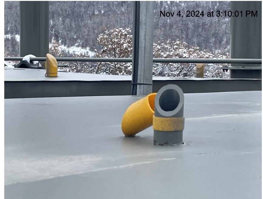
Photo # 8990 Rupture disc vent line does not comply with CECMC pressure safety device rules