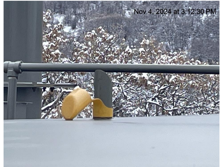
Photo # 8994 Rupture disc vent line does not comply with CECMC pressure safety device rules