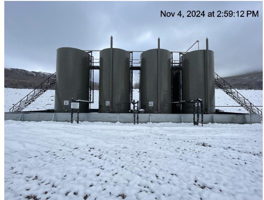
Photo # 8996 Tank battery contains seven 500 bbl tanks FORM 2A submitted by operator only lists 6 tanks/operator is not in compliance with CECMC rules