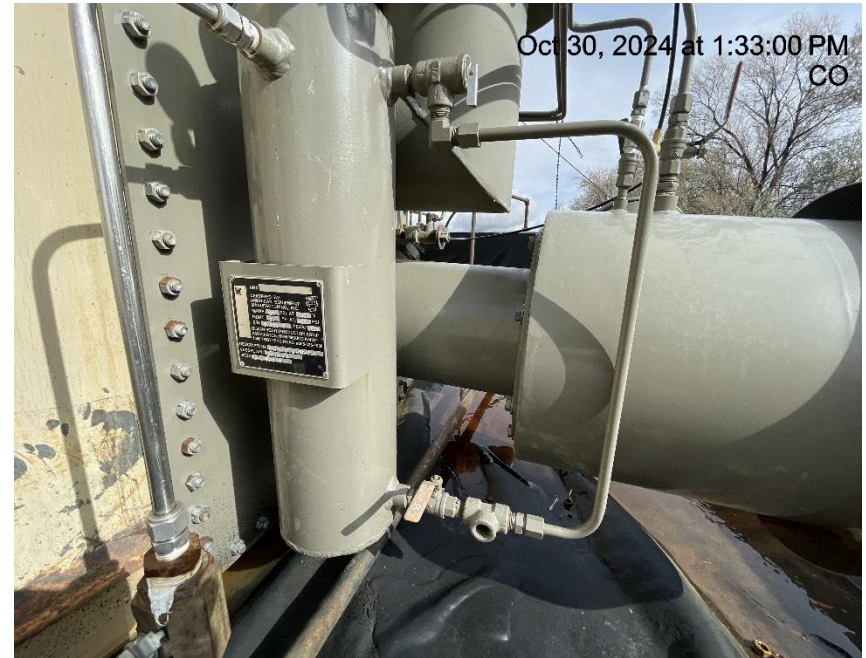
Photo # 8513 PRV vent line does not comply with CECMC pressure safety device rules