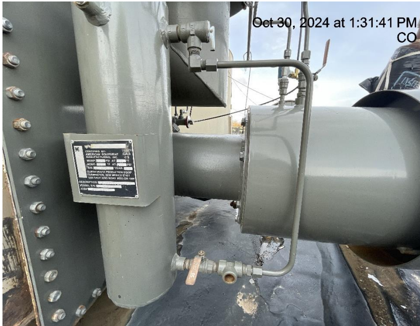
Photo # 8512 PRV vent line does not comply with CECMC pressure safety device rules