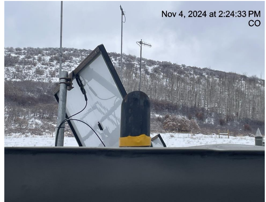
Photo # 8907 PRV vent line does not comply with CECMC pressure safety device rules