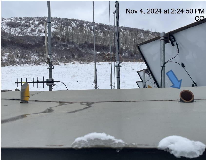
Photo # 8908 PRV vent line does not comply with CECMC pressure safety device rules