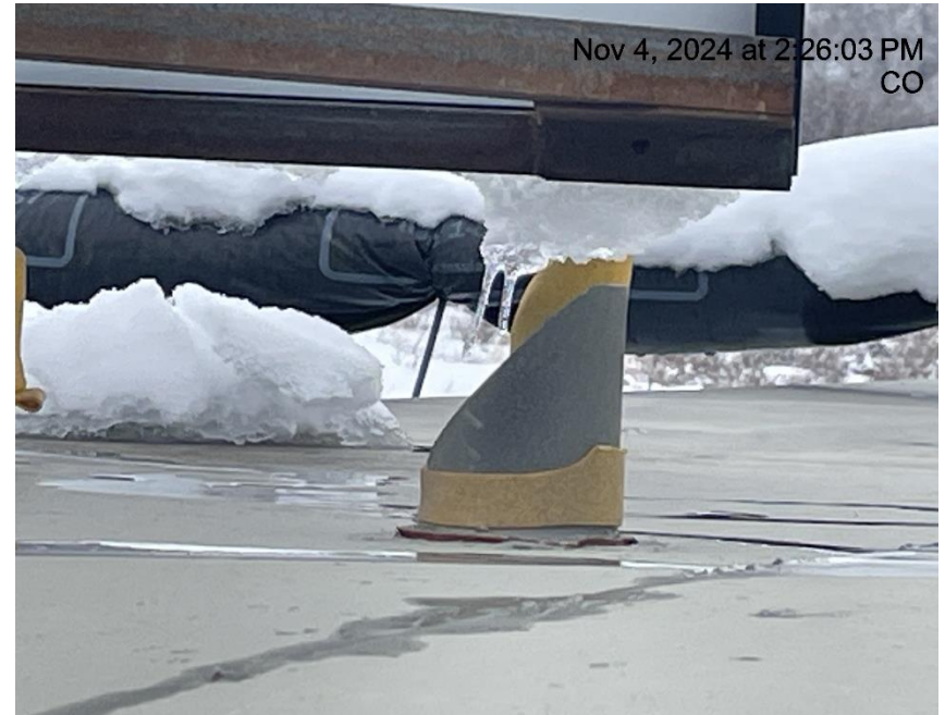
Photo # 8911 PRV vent line does not comply with CECMC pressure safety device rules