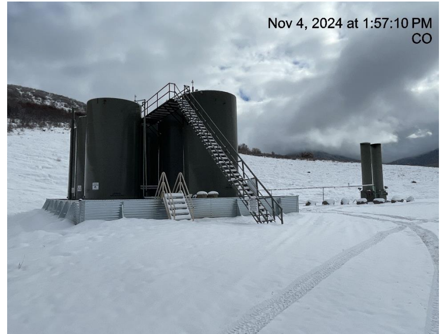
Photo # 8915 Total of seven 500 bbl tanks in battery on location – FORM 2A submitted by operator only lists 6 tanks/operator is out of compliance