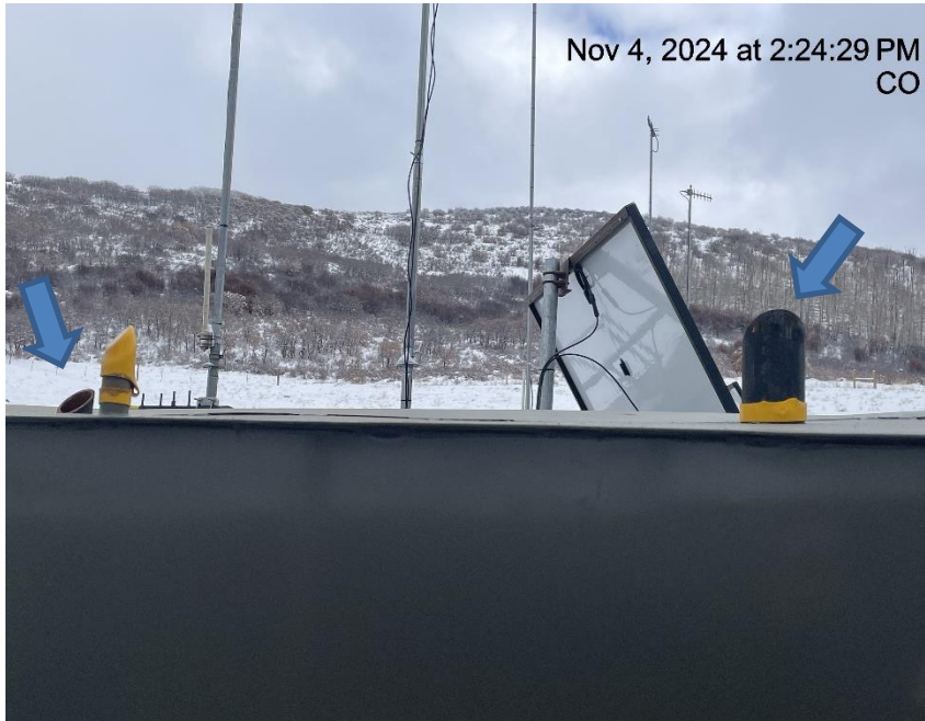
Photo # 8906 PRV vent lines do not comply with CECMC pressure safety device rules