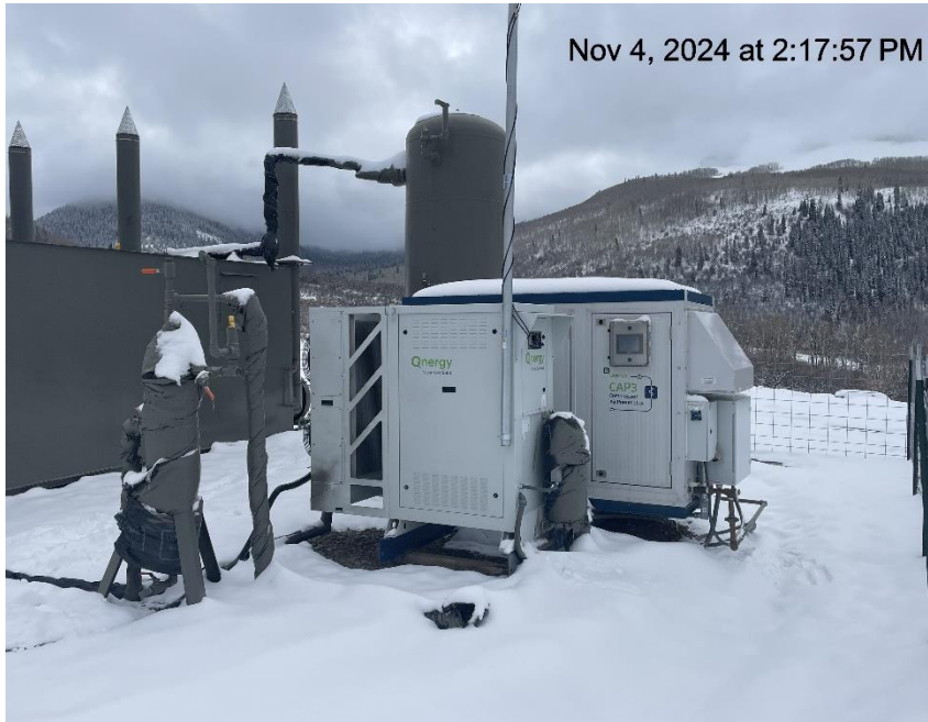
Photo # 8914 Natural gas generator & air compressor not listed in operators FORM 2A or in any FORM 4 SUNDRY /operator is not in compliance with CECMC rules