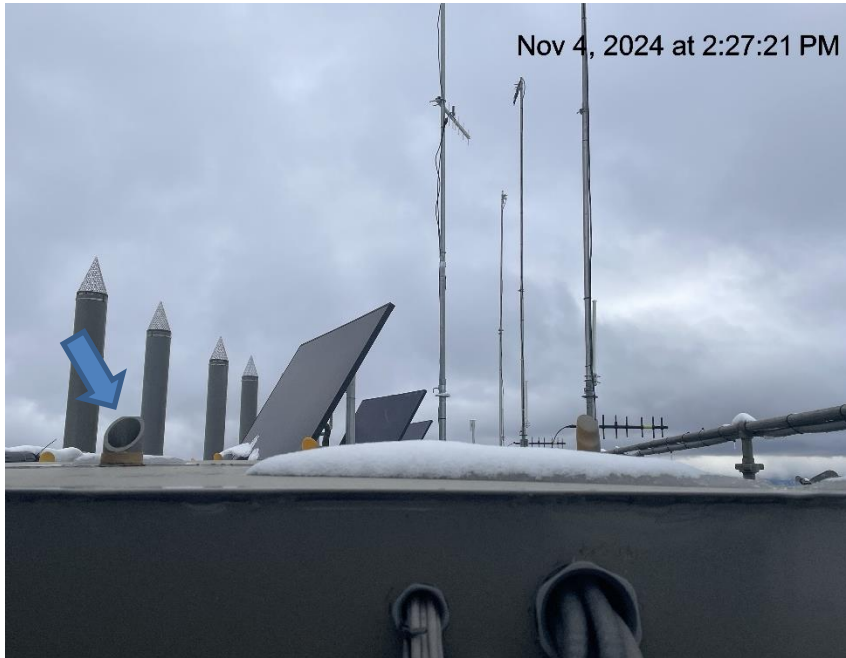
Photo # 8912 PRV vent line does not comply with CECMC pressure safety device rules