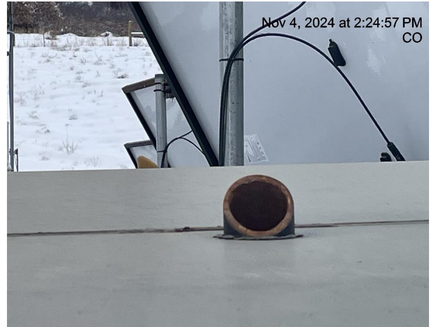
Photo # 8909 PRV vent line does not comply with CECMC pressure safety device rules