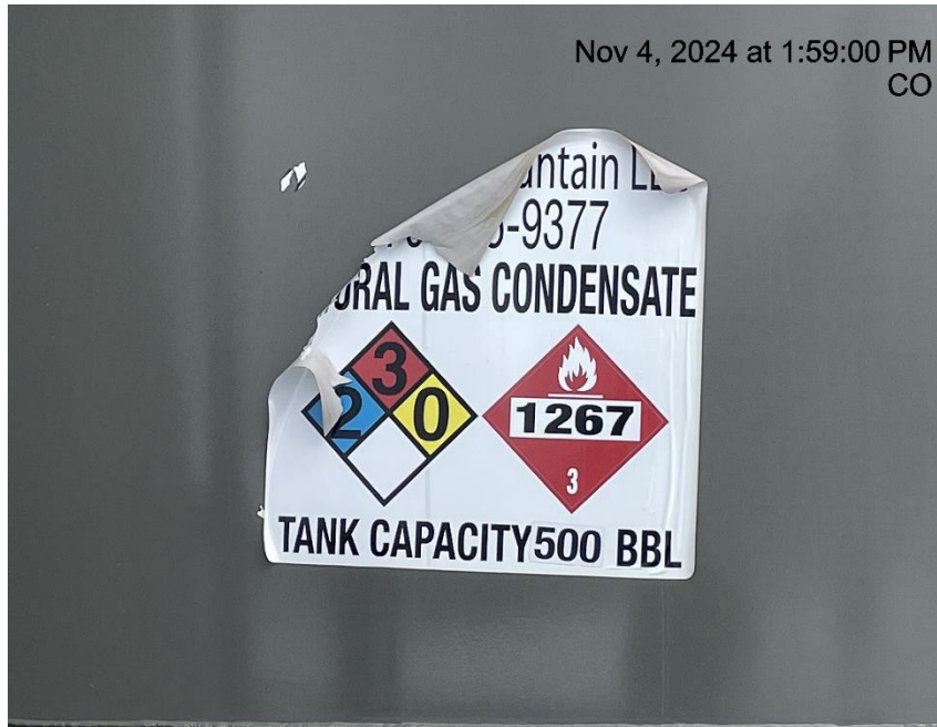
Photo # 8902 Tank label damaged & peeling/some required info is illegible