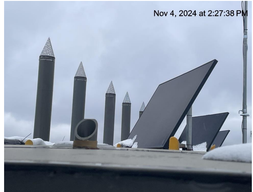
Photo # 8913 PRV vent line does not comply with CECMC pressure safety device rules