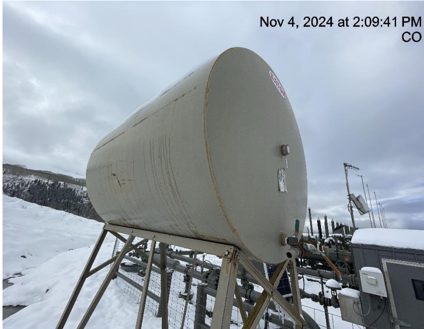
Photo # 8900 Methanol tank missing some required info /does not comply with CECMC labeling rules