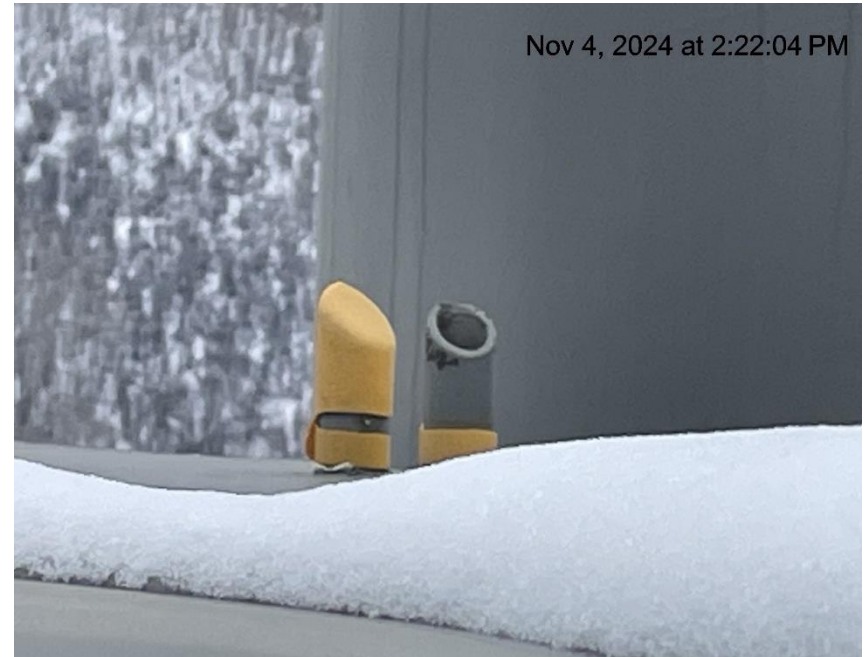
Photo # 8905 Rupture disc vent line does not comply with CECMC pressure safety device rules