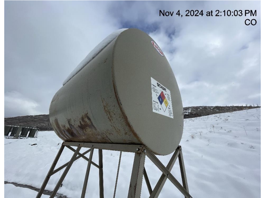
Photo # 8901 Methanol tank missing some required info /does not comply with CECMC labeling rules