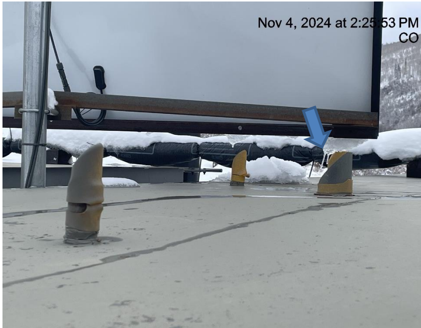
Photo # 8910 PRV vent line does not comply with CECMC pressure safety device rules