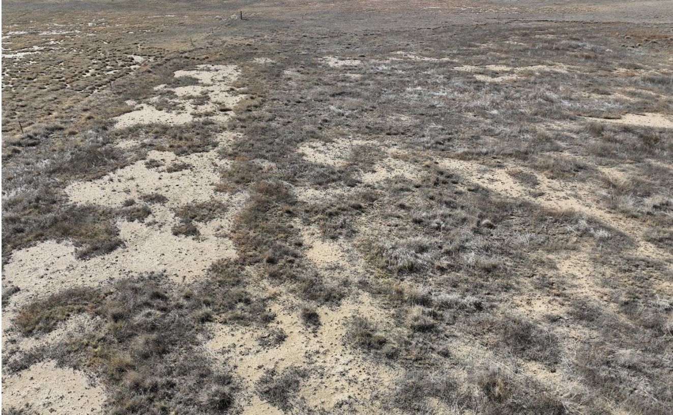
Photo 3. Drone aerial photo facing west down toward the location. There are areas bare of vegetation that need to be reseeded.