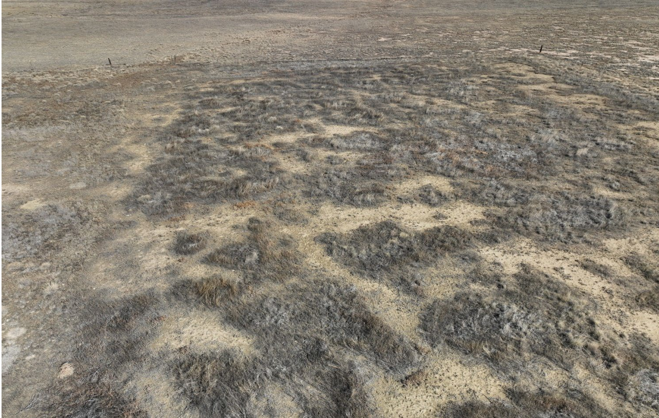
Photo 2. Drone aerial photo facing east down toward the location. There are areas bare of vegetation and undesirable weeds. Perennial vegetation has not sufficiently established.