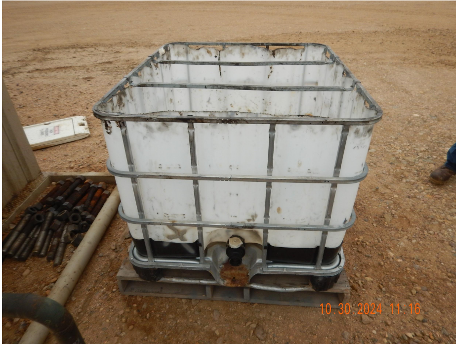
Photo 16. Photo taken near the wellhead. Photo illustrates a containment device without wildlife protection BMPs.