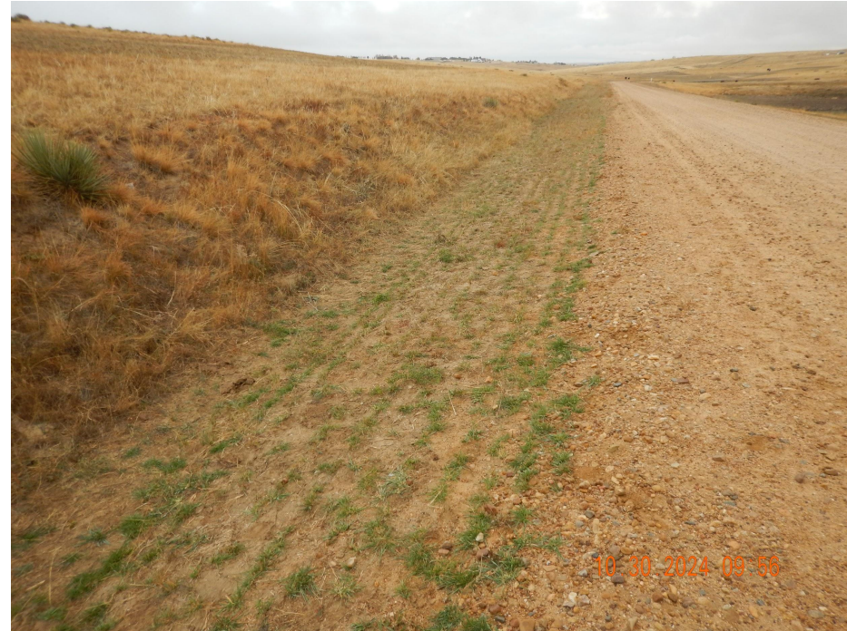
Photo 2. Photo taken from a portion of the southern access road, facing North. See comments under Photo 1.