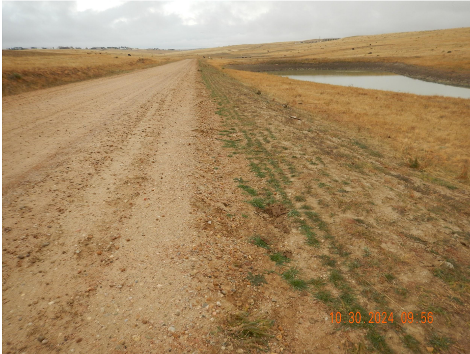
Photo 1. Photo taken from a portion of the southern access road, facing North. Photo illustrates topsoil stockpiled along the access road, which has been seeded and in-process of establishing.