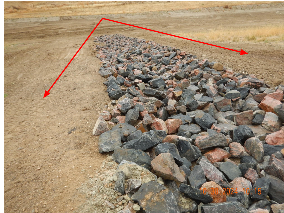
Photo 4. Photo taken from the western location, facing West. Photo illustrates the Operator has performed repairs but it was not evident whether or not repairs were performed per good engineering practices (i.e., not sure if geotextile was installed below the rock).

Also, Operator shall stabilize areas on other side of the rock.