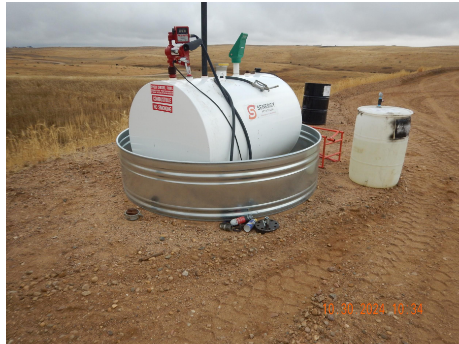
Photo 6. Photo taken from the southwestern location, facing Southwest. Photo illustrates chemical and refueling storage that appears to be within 500 feet of an OHWM of an intermittent stream and wetland. Also, drums are outside of secondary containment. Refer to Photo 24.