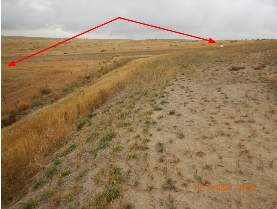
Photo 13. Photo taken from the southeastern screening berm, facing South. Photo illustrates trash blowing off location.