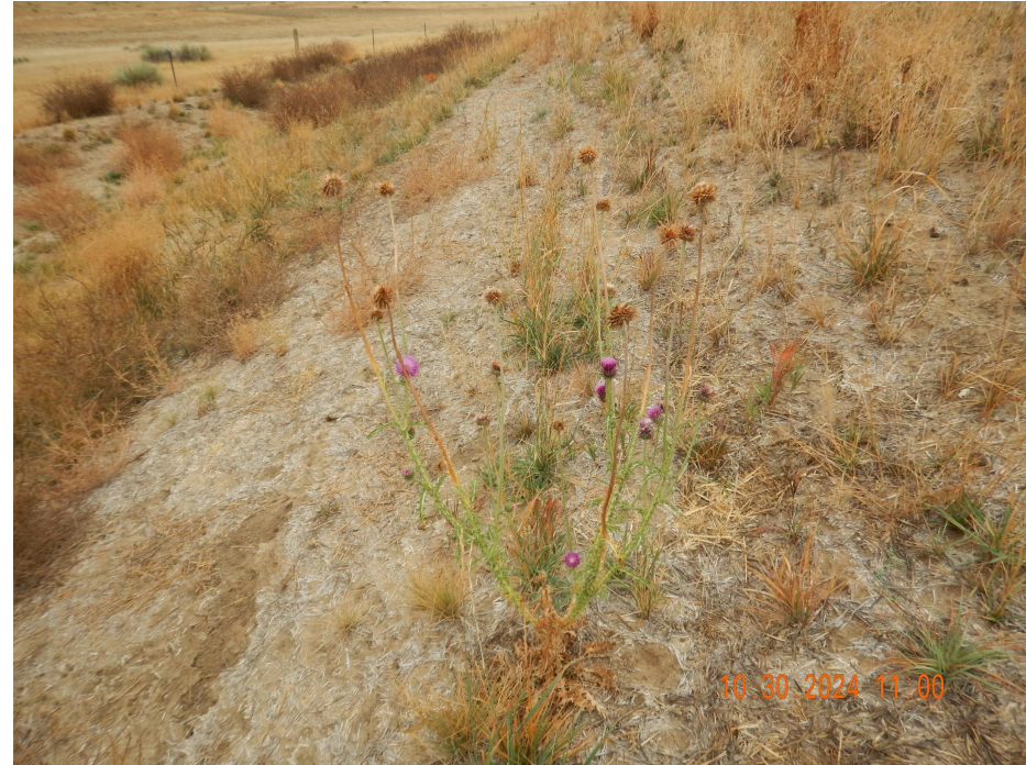
Photo 14. Photo taken from the eastern screening berm. Photo illustrates a List B Colorado Noxious Weed, Musk thistle. Note- only a few musk thistles were observed.