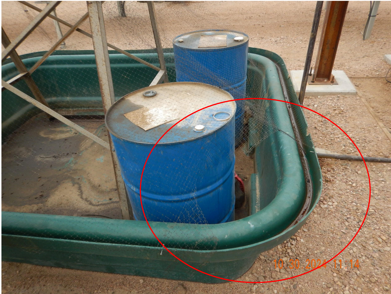
Photo 15. Photo taken from the working pad surface by the facilities. Photo illustrates wildlife netting in disrepair.