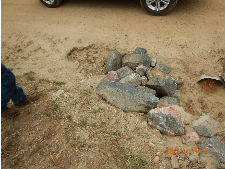
Photo 18. Photo taken along a portion of the access road. Photo illustrates the inlet of the culvert needs maintenance and additional erosion is occurring beyond in the inlet riprap.