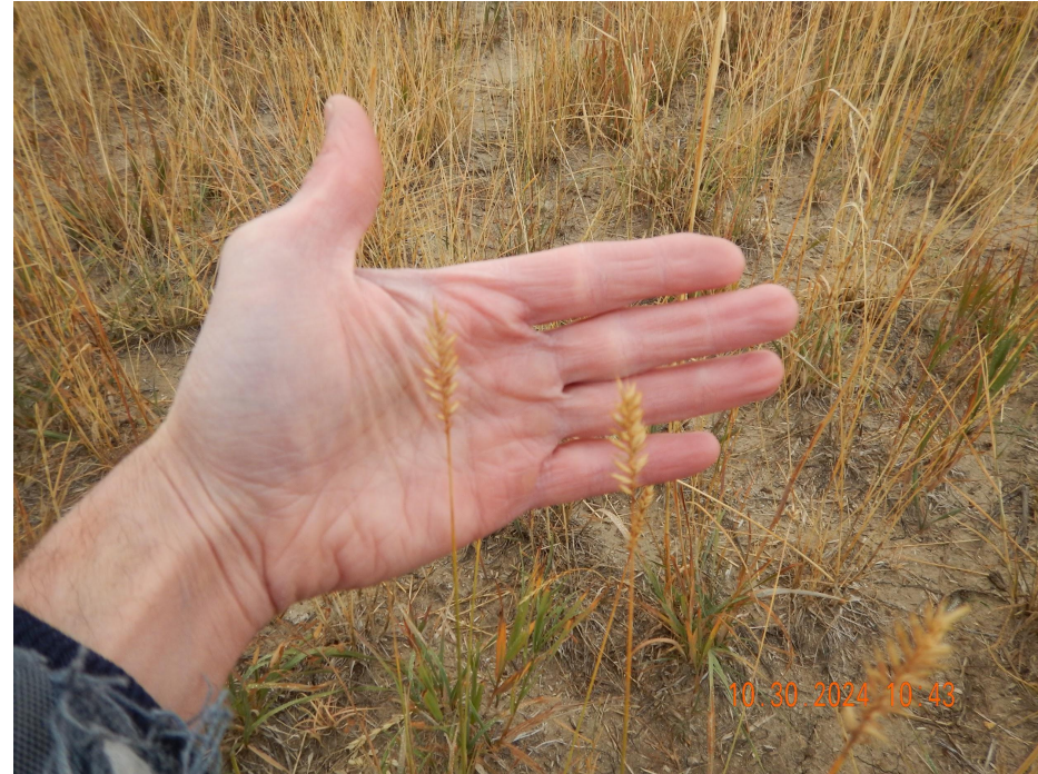
Photo 10. Photo taken from the southern screening berm. Photo illustrates an introduced grass species- Crested wheatgrass, that was not included in any proposed seed mix.