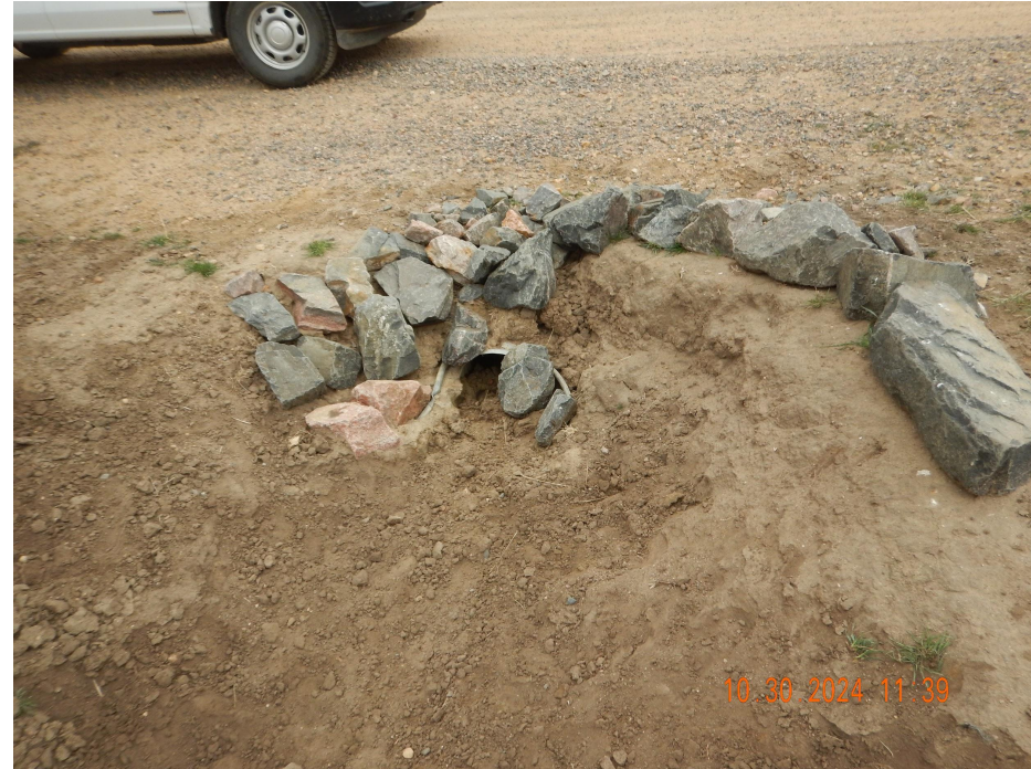
Photo 19. Photo taken at the outlet of the culvert previously shown. Photo illustrates the culvert needs maintenance and there is no stabilized outlet for the culvert.