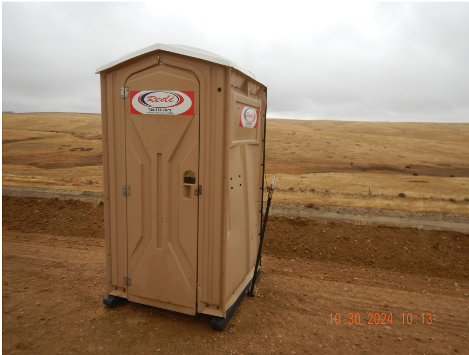
Photo 3. Photo taken from western pad, facing West. Photo illustrates the port-o-let is secured. Operator should consider relocating this to be outside of the 500 feet OHWM of any river, perennial or intermittent stream, lake, pond, or wetland.