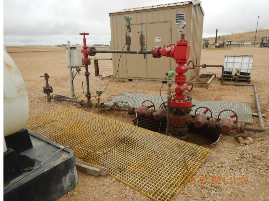
Photo 17. Photo taken at the wellhead. Photo illustrates the cellar is not secured to prevent accidental access by people, livestock, or wildlife when active work on that conductor is not occurring, and the wellhead lacks signage.