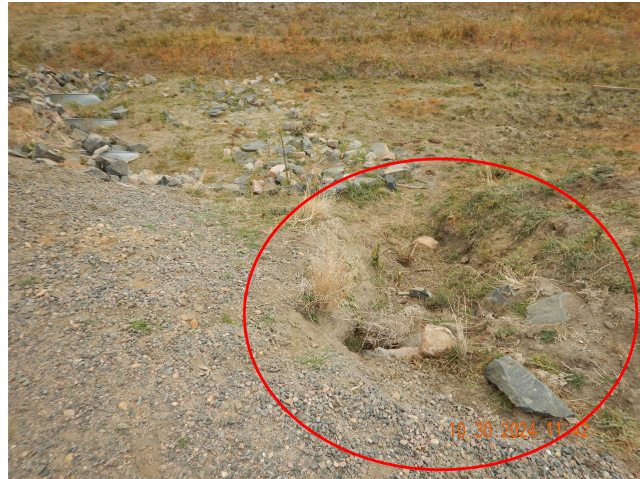
Photo 21. Photo taken along a portion of the access road and the southern intersection of the intermittent stream. Photo illustrates gully erosion adjacent to the crossing.