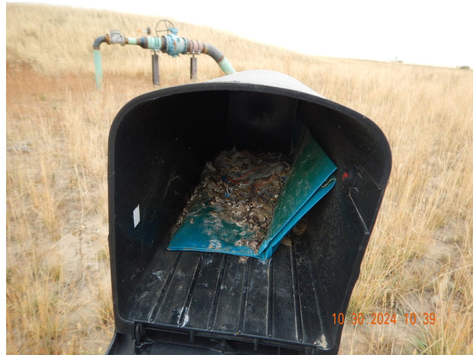
Photo 8. Photo illustrates the mailbox on location per Rule 406.c. Operator may want to clean out box and ensure it is securely closed.