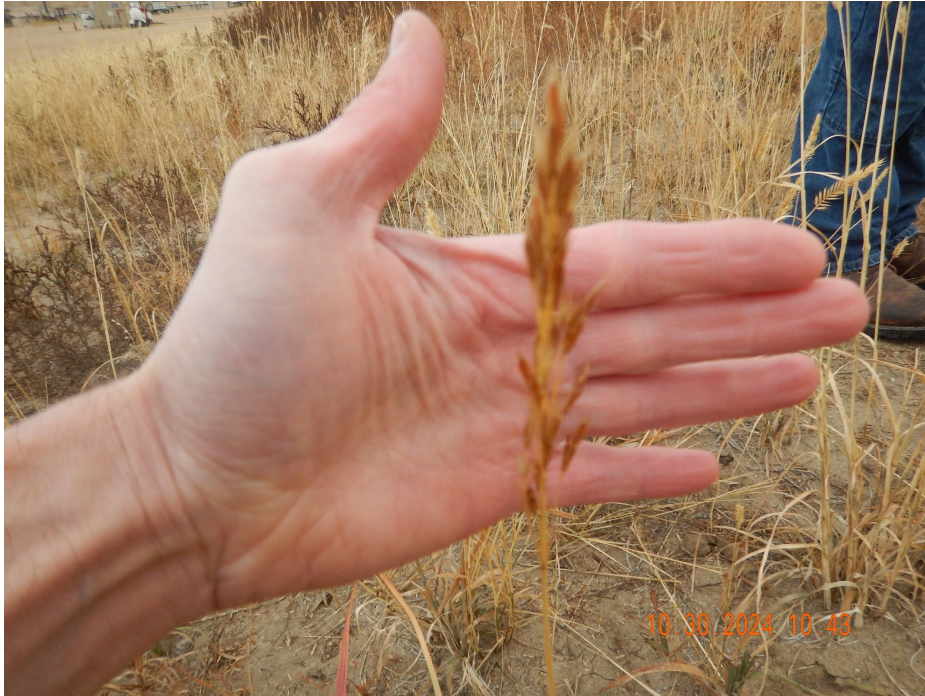
Photo 11. Photo taken from the southern screening berm. Photo illustrates an introduced grass species- Smooth brome, that was not included in any proposed seed mix.