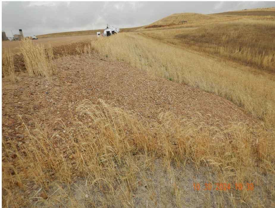
Photo 5. Photo taken from southwestern pad, facing East. Photo illustrates road base that appears to have washed off pad. Operator shall recover road base and reseed fill slope.