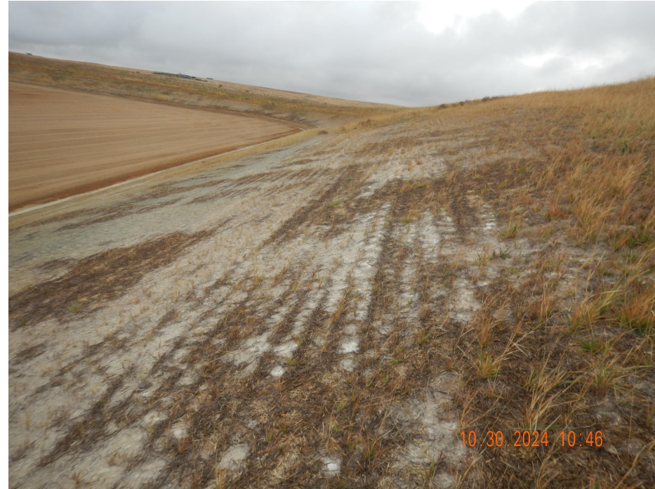
Photo 12. Photo taken from a portion of the southeastern cut slope. Photo illustrates the lack of establishment of perennial vegetation.