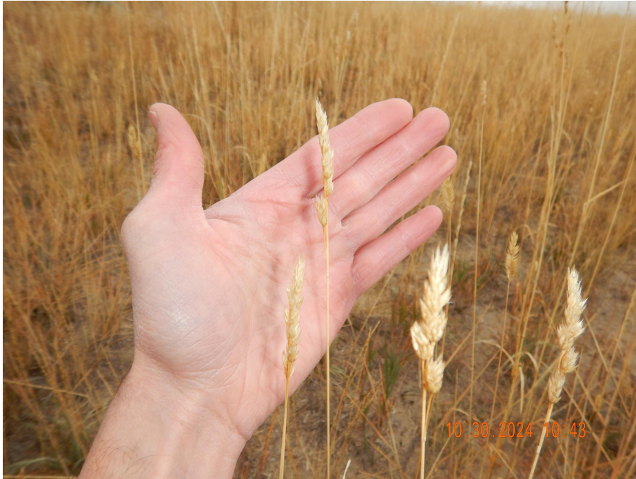
Photo 9. Photo taken from the southern screening berm. Photo illustrates an introduced grass species- Orchard grass, that was not included in any proposed seed mix.