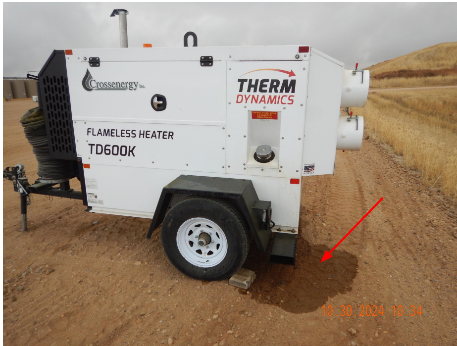
Photo 7. Photo taken from southwestern pad, facing East. Photo illustrates equipment is leaking fluid or fluid being spilled during operations.