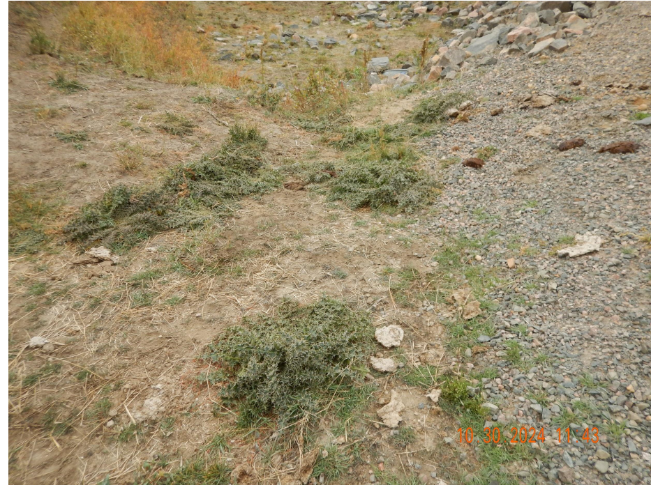
Photo 23. Photo taken along a portion of the access road and the southern intersection of the intermittent stream. Photo illustrates List B Colorado Noxious Weeds, Musk thistle.