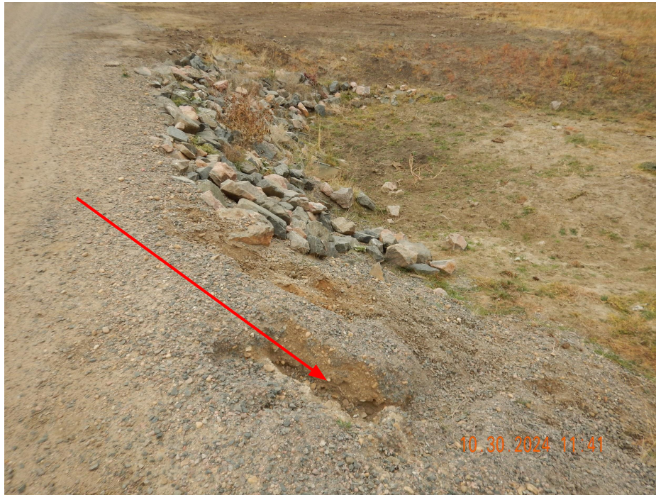
Photo 20. Photo taken along a portion of the access road and the northern intersection of the intermittent stream. Photo illustrates rill erosion adjacent to the crossing.