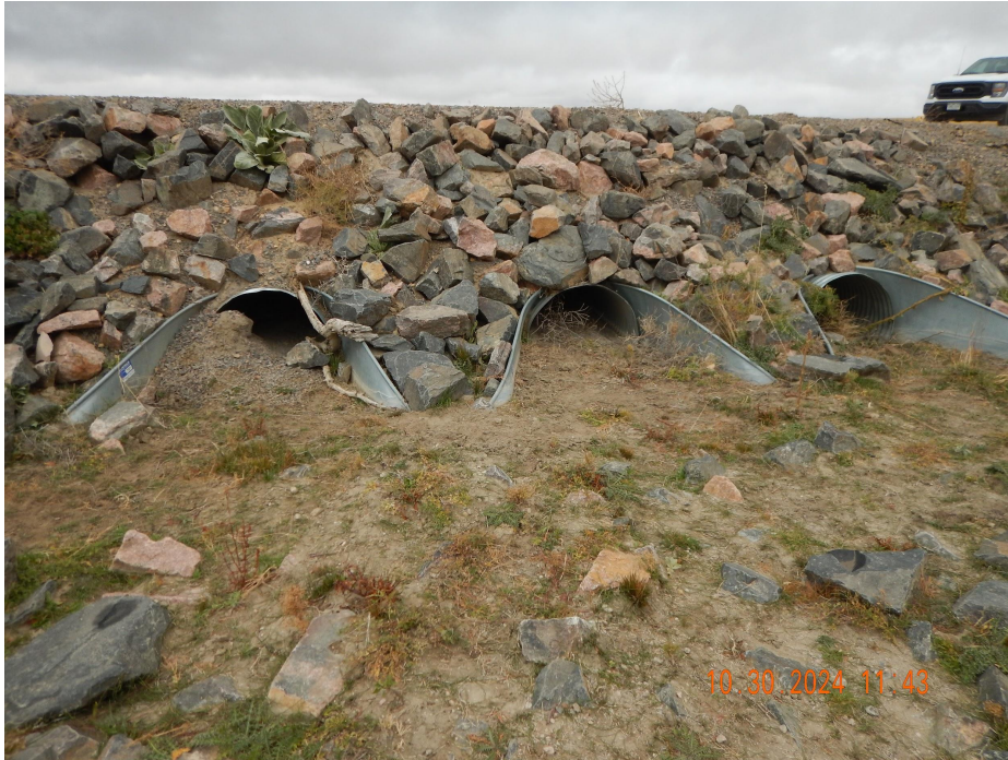
Photo 22. Photo taken along a portion of the access road and the southern intersection of the intermittent stream. Photo illustrates culverts are in need of maintenance.