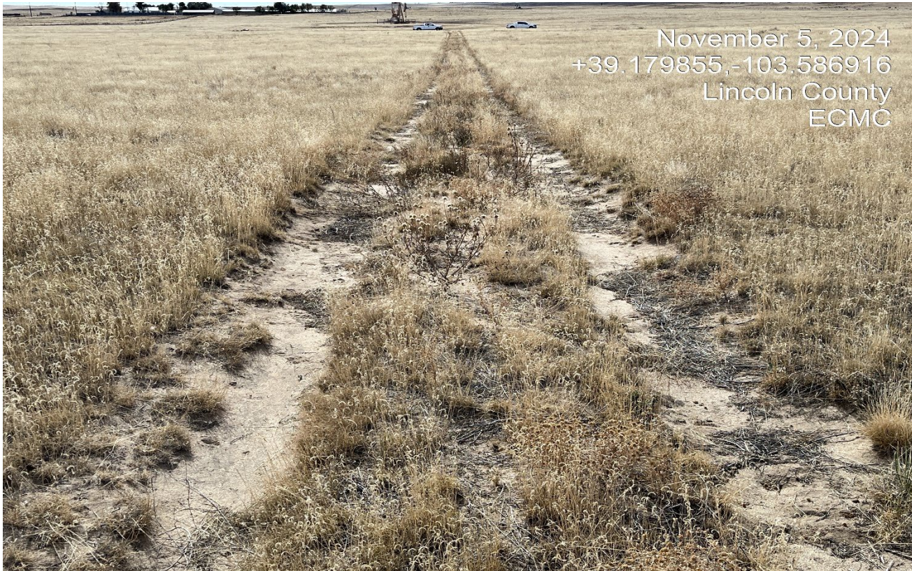
Photo 3. Facing south along the access road. There are areas along the road that have not established perennial vegetation and these areas appear to be compacted.