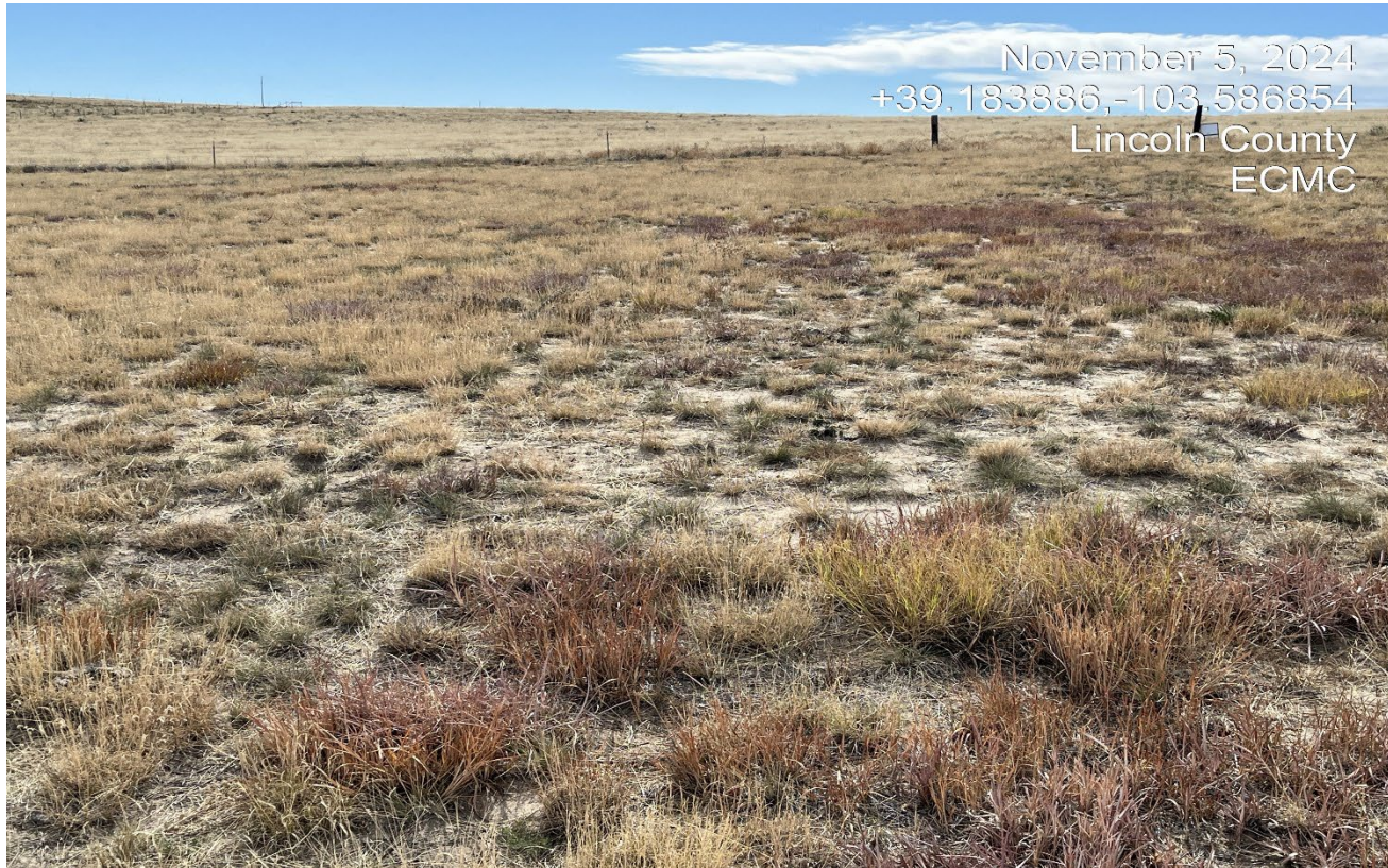
Photo 9. Facing south at the center of the location. Perennial vegetation is established throughout the location.