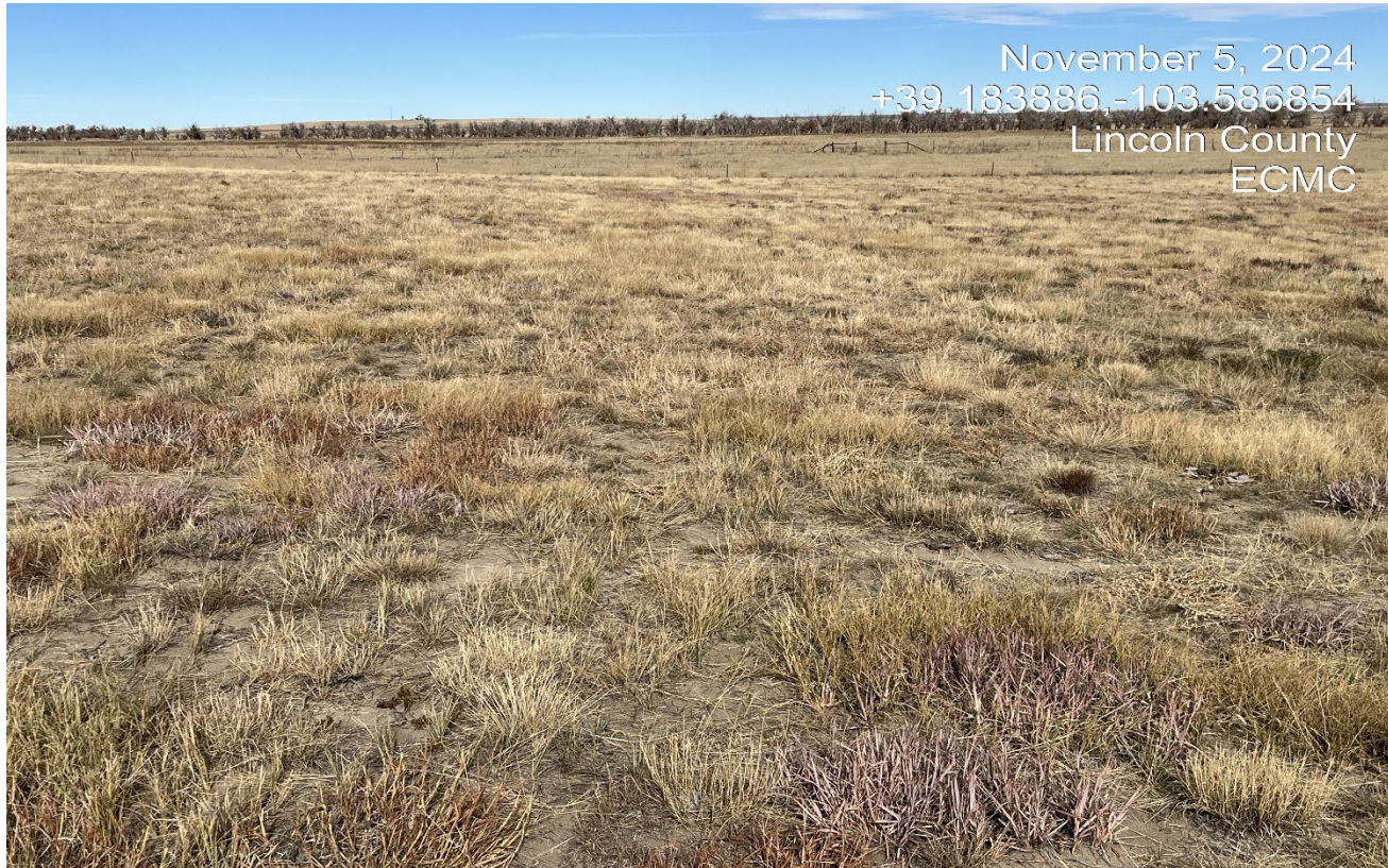
Photo 7. Facing north at the center of the location. Perennial vegetation is established throughout the location.