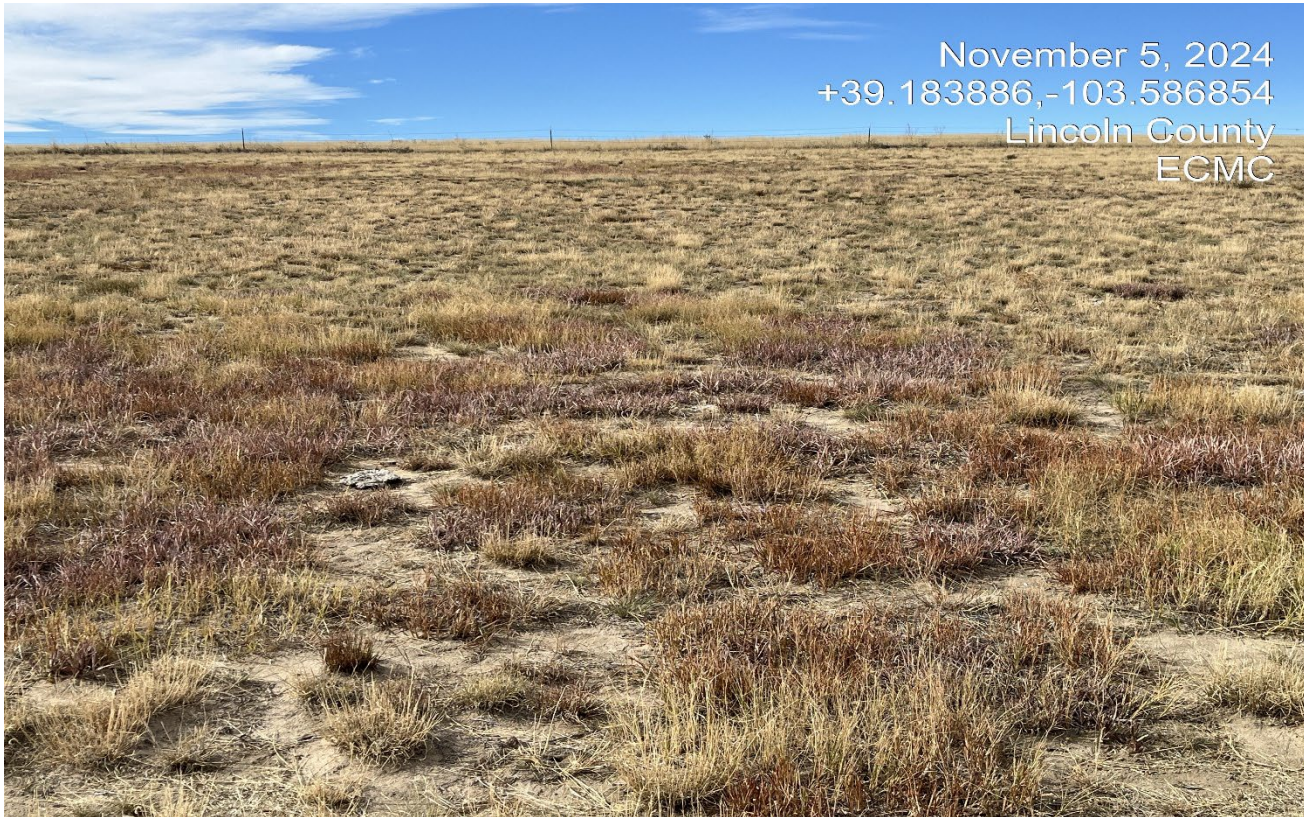
Photo 8. Facing east at the center of the location. Perennial vegetation is established throughout the location.