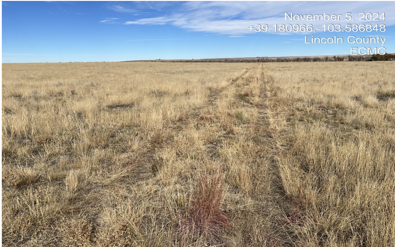
Photo 4. Facing north further along the former access road. The perennial vegetation has re-established along most of the former road.