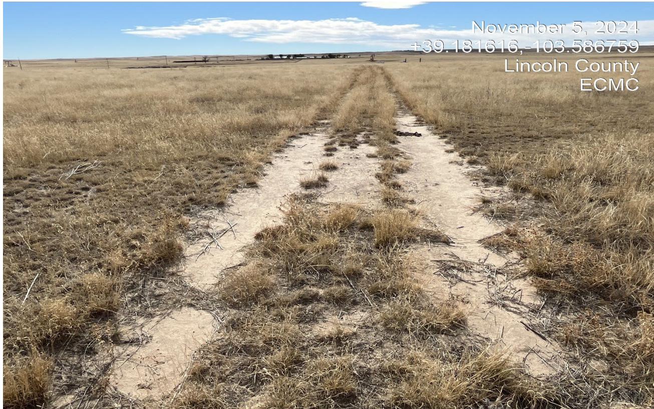
Photo 5. Facing south along the access road. There are areas along the road that have not established perennial vegetation and these areas appear to be compacted.