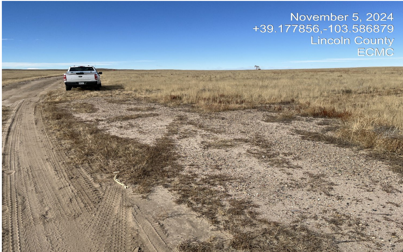
Photo 2. The area at the beginning of the road is not reclaimed and perennial vegetation has not established.