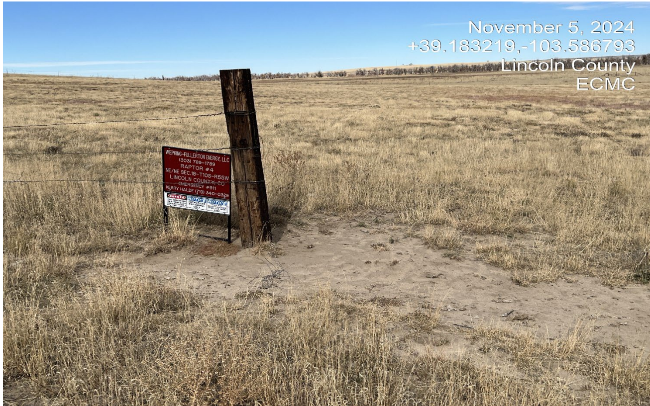
Photo 6. Facing north toward the location. The fence remains around the location and will need to be removed prior to final inspection.