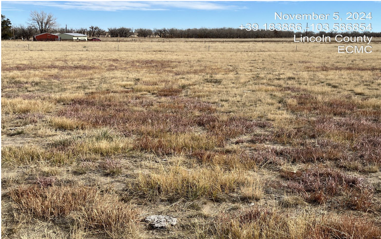
Photo 10. Facing east at the center of the location. Perennial vegetation is established throughout the location.