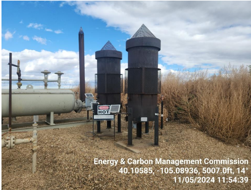
Photo 7 ECDs.