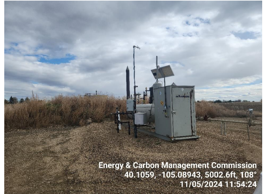
Photo 6 Horizontal Heated Separator.