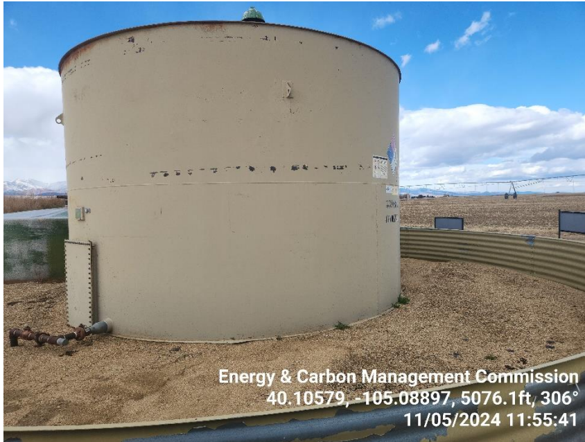
Photo 5 Tank battery.