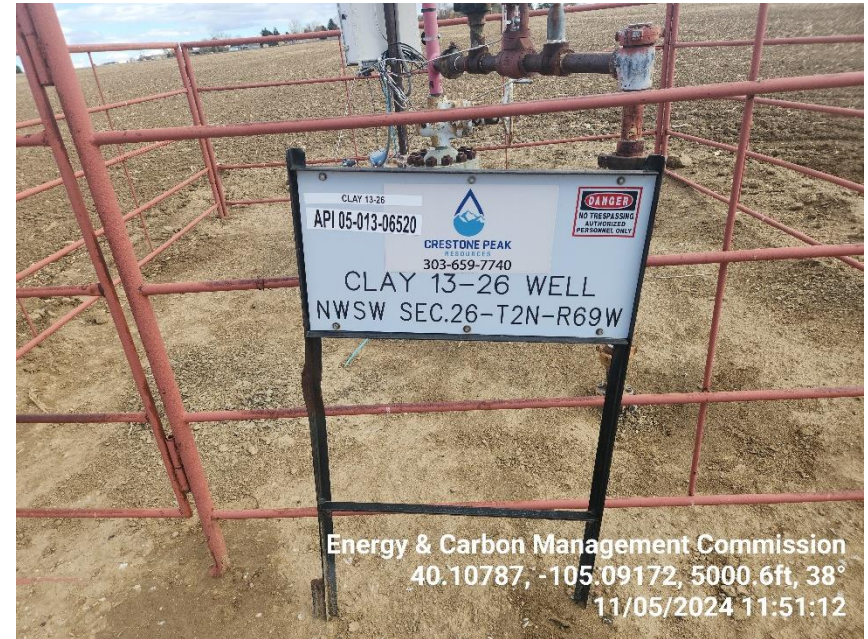
Photo 2 Wellhead sign.