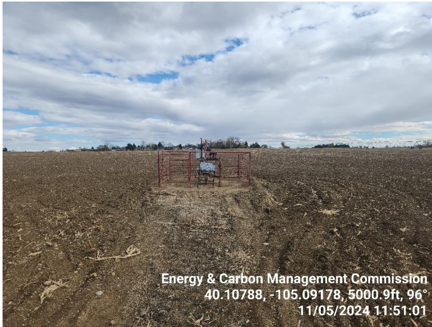
Photo 1 Wellsite.