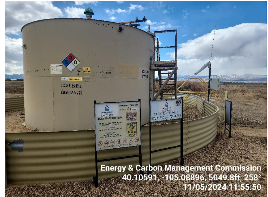
Energy & Carbon Management Commission 40.10591, -105.08896, 5049.8ft, 258° 11/05/2024 11:55:50