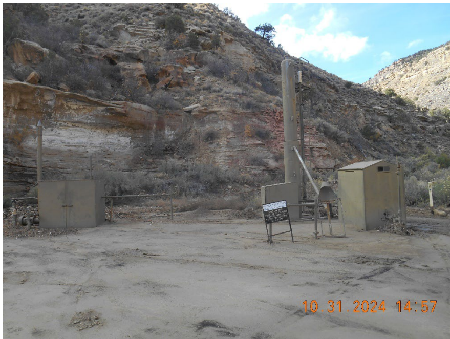
Separator, Dehydrator and Meter housing

Inspection Date: 10/31/2024 Inspection Doc#: 693807898