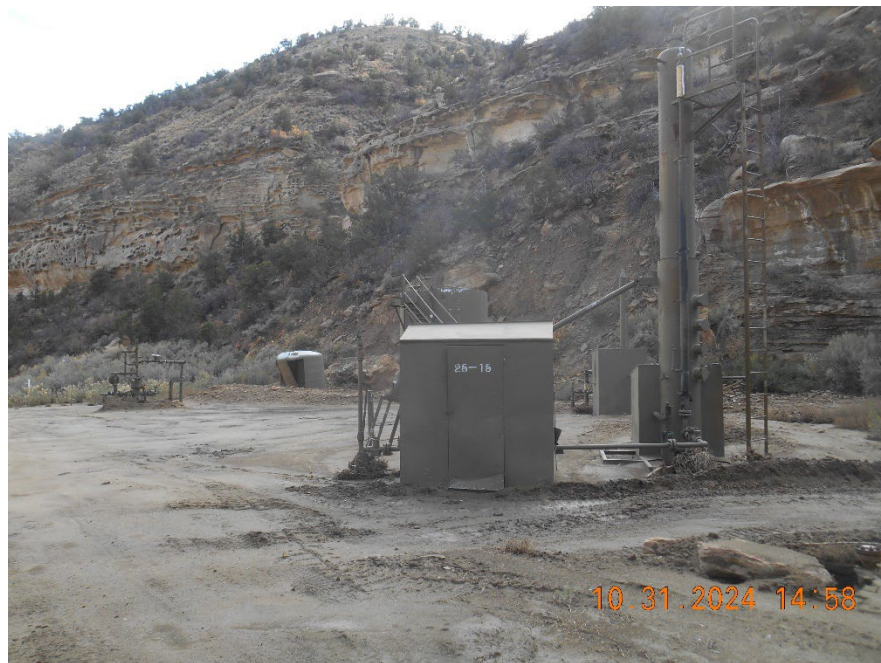
Location overview looking S

Inspection Date: 10/31/2024 Inspection Doc#: 693807898