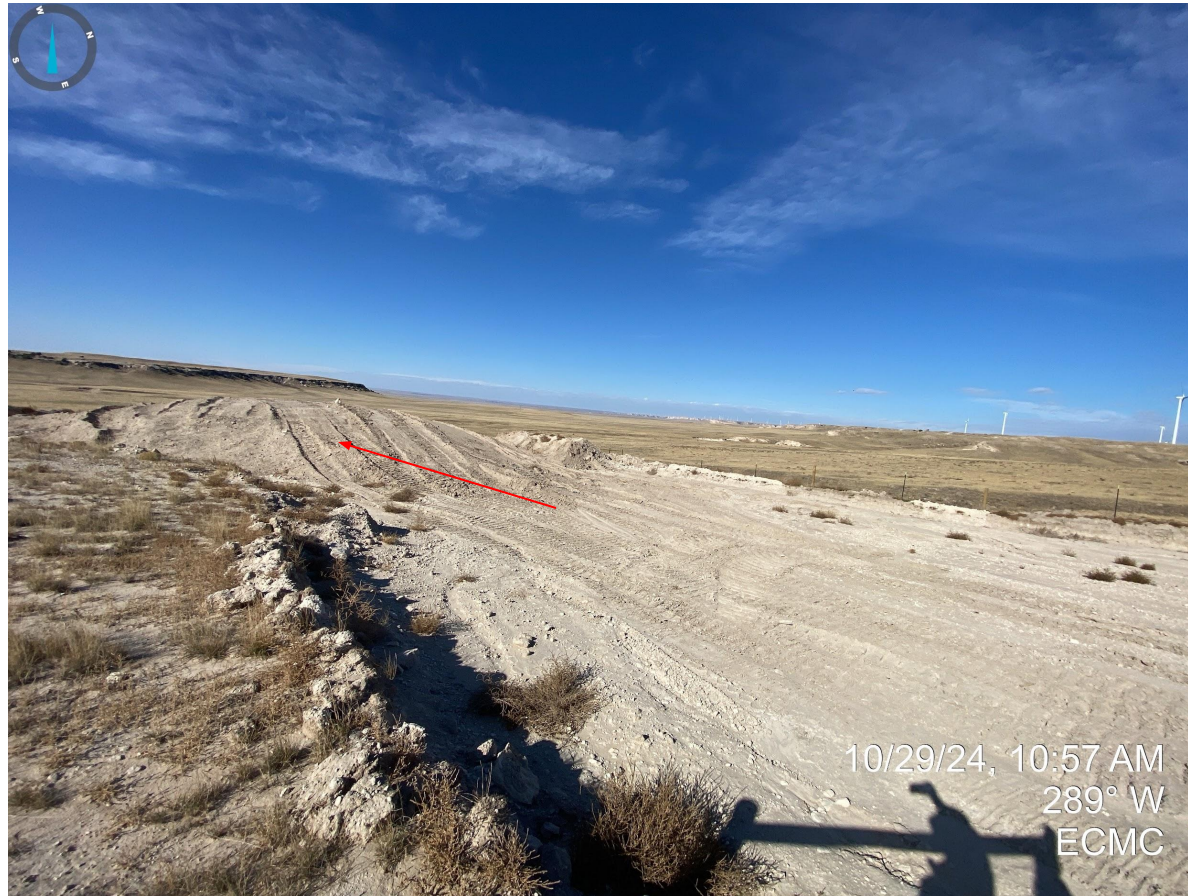
Photo 17. Stockpiled material from the salt kill excavation appear to have been compacted and equipment tracked to stabilize the soils.