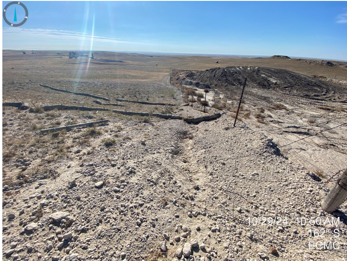
Photo 12. Stormwater control measures east of pit remain inadequate; additional maintenance and/or implementation of more robust stormwater control measures/BMPs required.