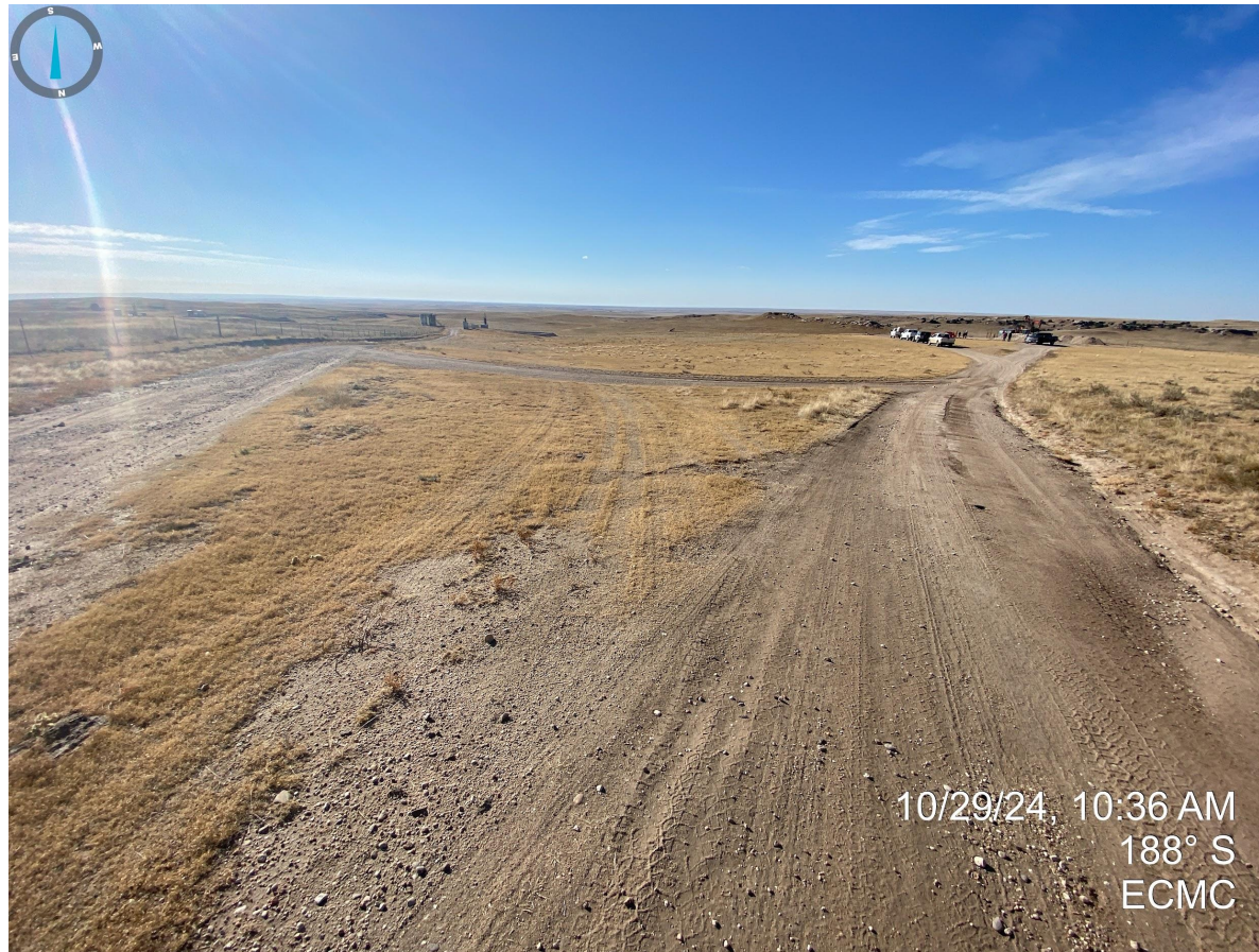
Photo 1. Taken near the Y intersection of the access road. Vehicle traffic observed outside of the established access roads. Additional reclamation activities may be required if the disturbed area fails to meet Rule 1003 standards.