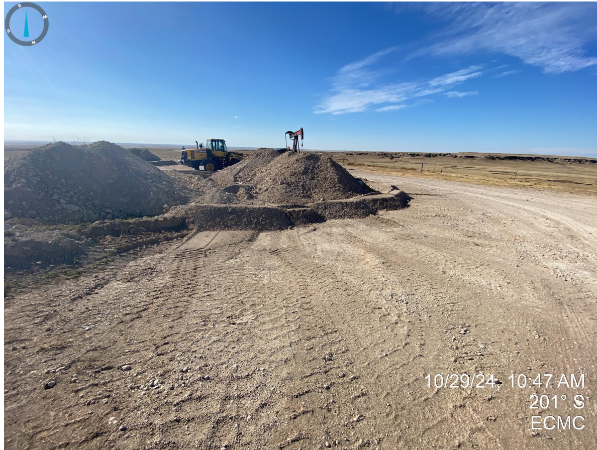
Photo 10. Continued from Photo 9. Stockpiled materials located near the wellhead appear to have perimeter stormwater controls and adequate signage.