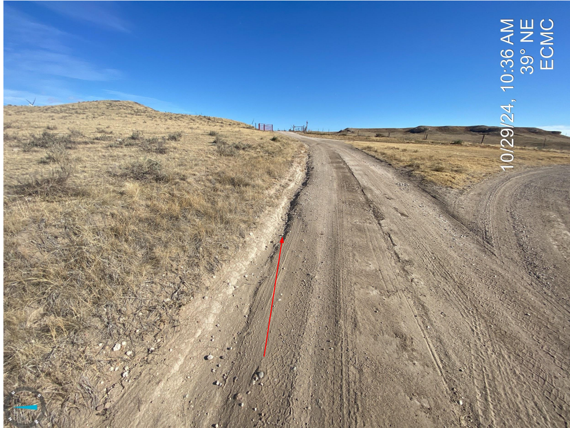
Photo 3. Continued from Photo 2; erosion degradation observed along the access road.

Inspection Photos Location Name: Propst #2 Location ID: 312292