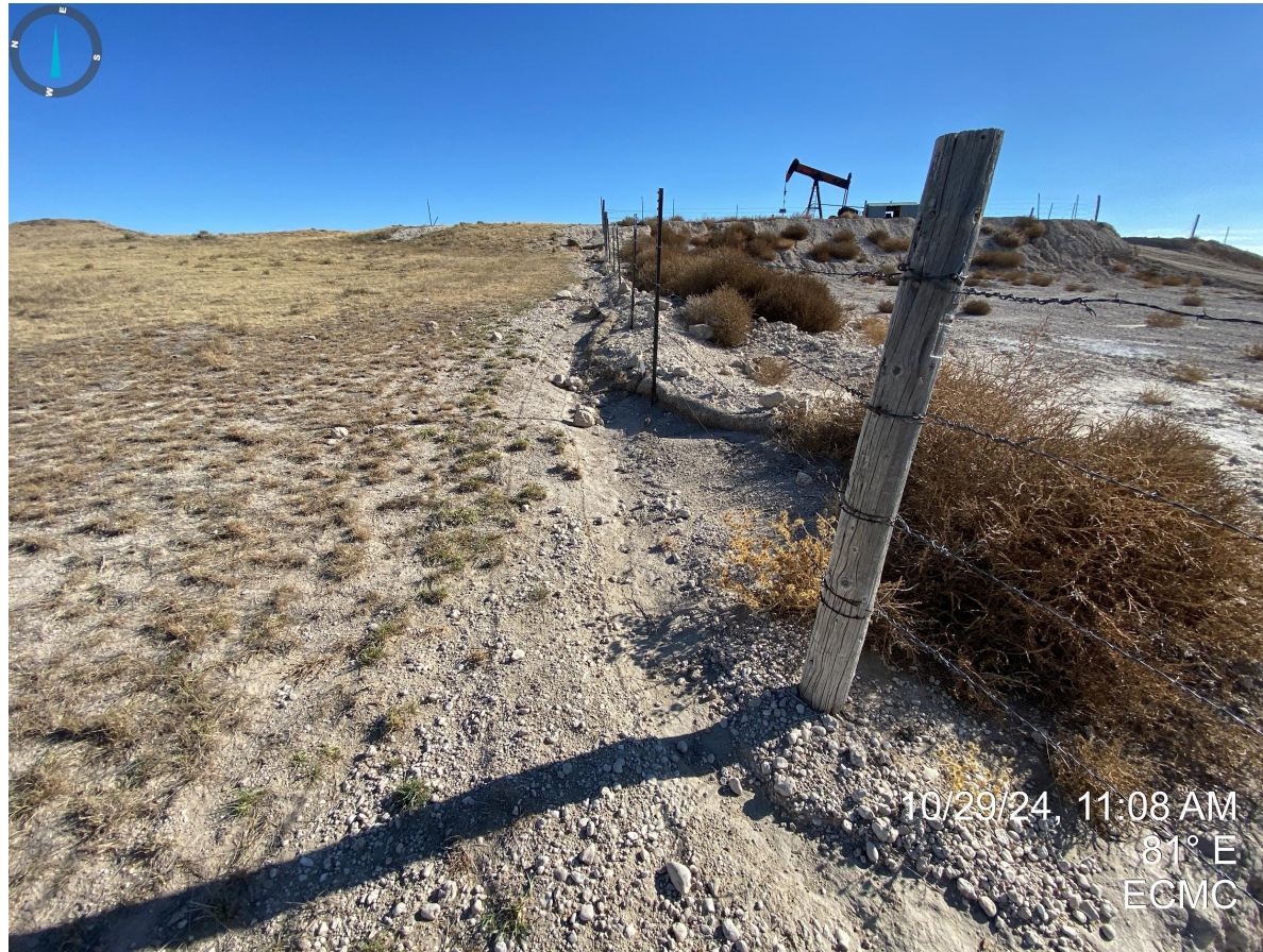
Photo 22. Erosion degradation north of pit remain evident; additional maintenance and/or implementation of more robust stormwater control measures/BMPs required. Undesirable vegetation (russian thistle) also pictured.