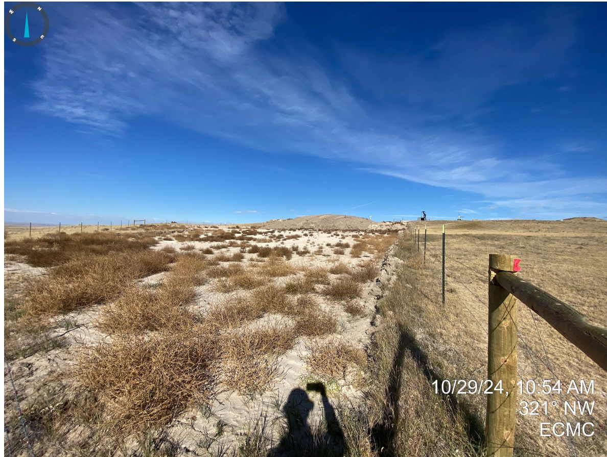
Photo 16. Undesirable vegetation observed throughout the salt kill excavation.