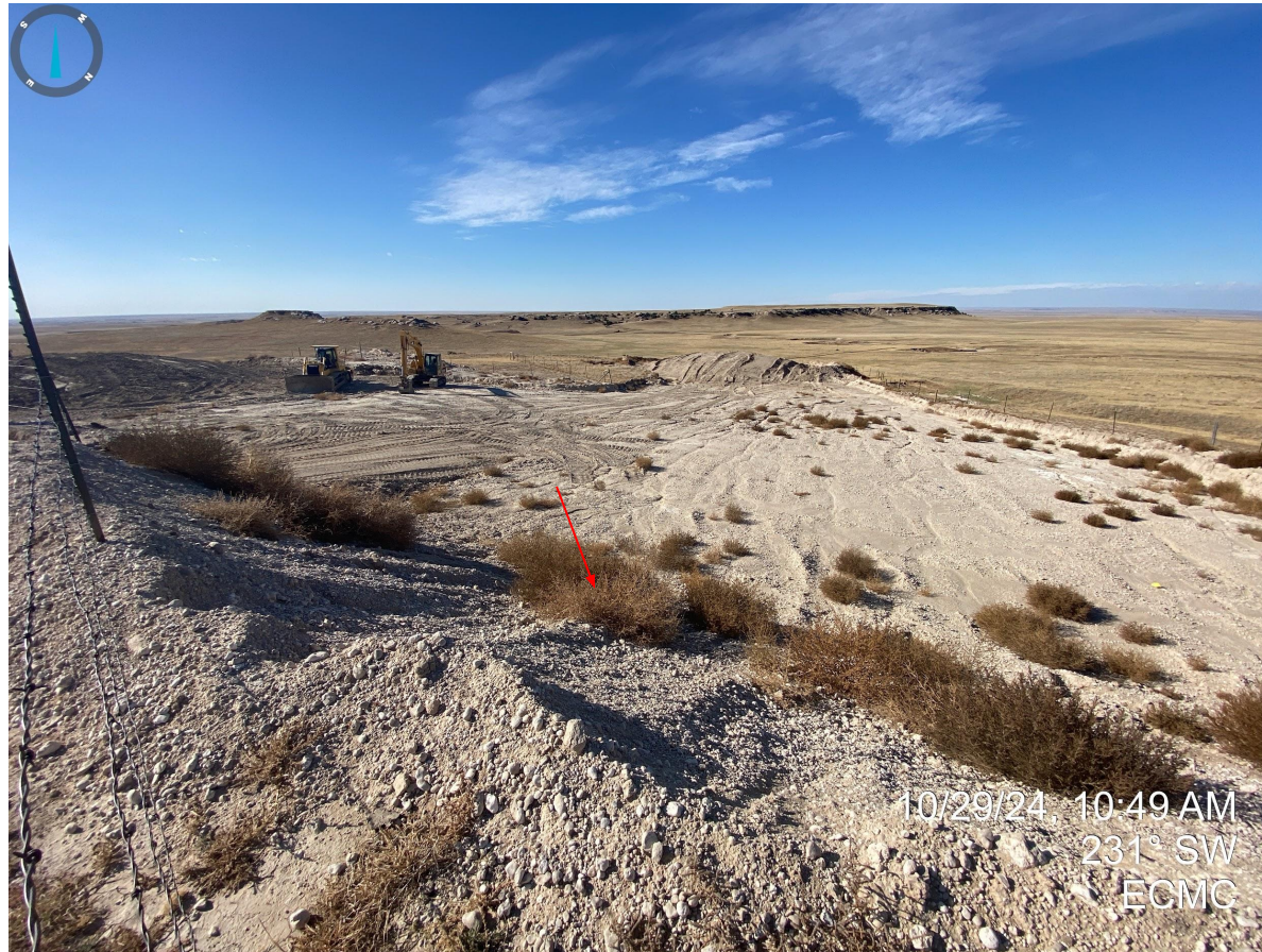
Photo 11. Evidence of undesirable vegetation (russian thistle) observed within the former pit/excavation.