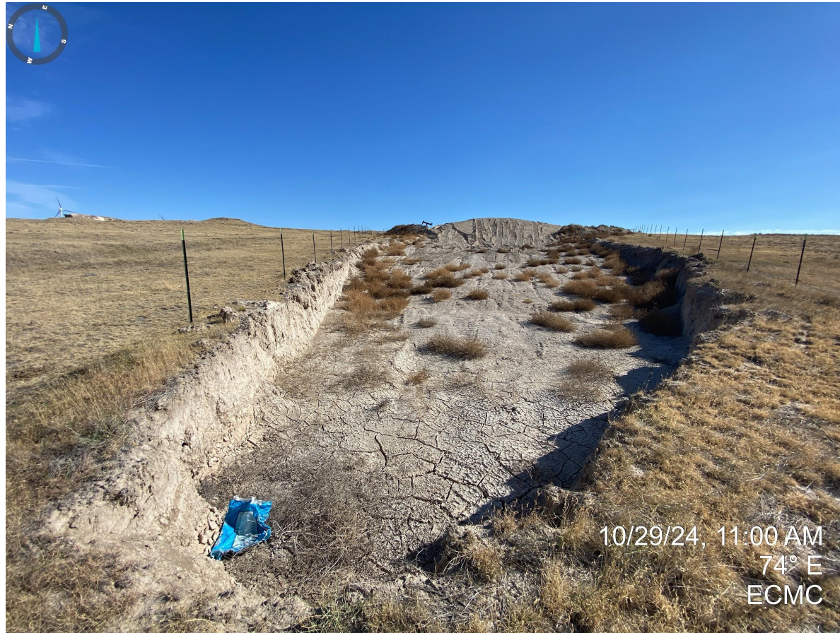
Photo 18. Undesirable vegetation and trash/debris observed within the western salt kill excavation.