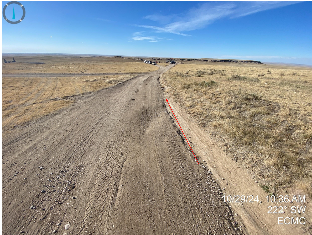
Photo 2. Erosion degradation observed along the access road.