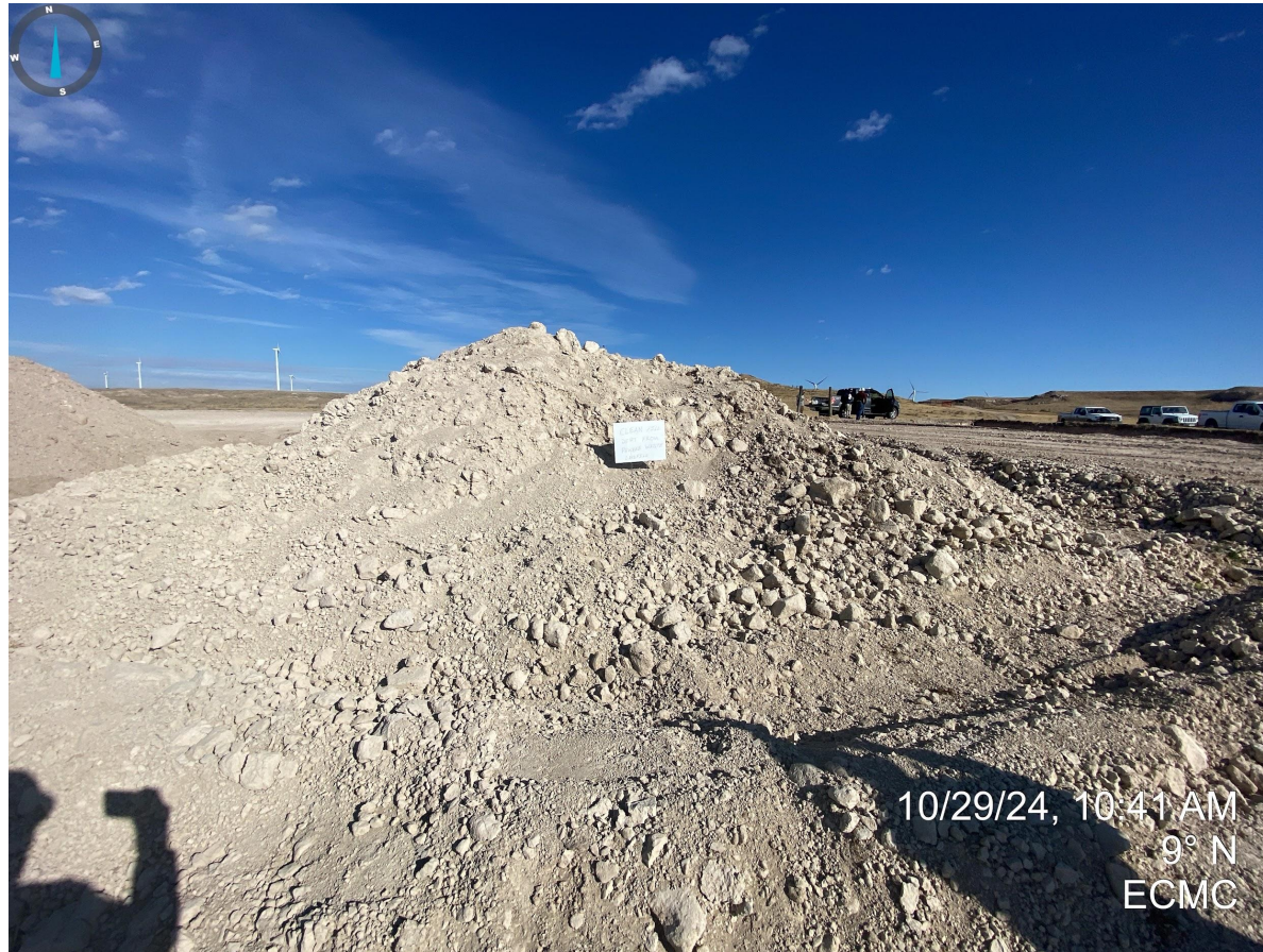
Photo 8. Stockpiled materials located near the wellhead appear to have perimeter stormwater controls and adequate signage.