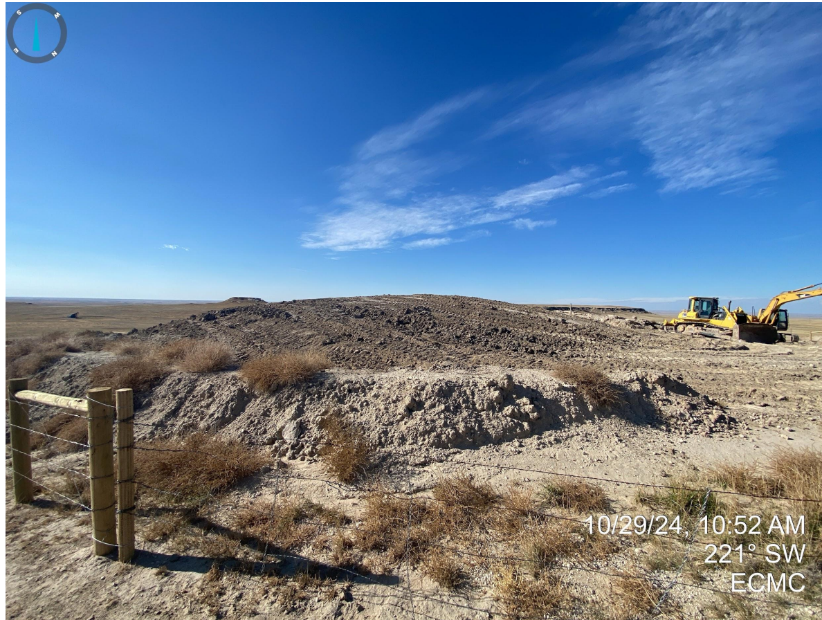
Photo 15. Stockpiled material from the salt kill excavation appear to have been compacted and equipment tracked to stabilize the soils.