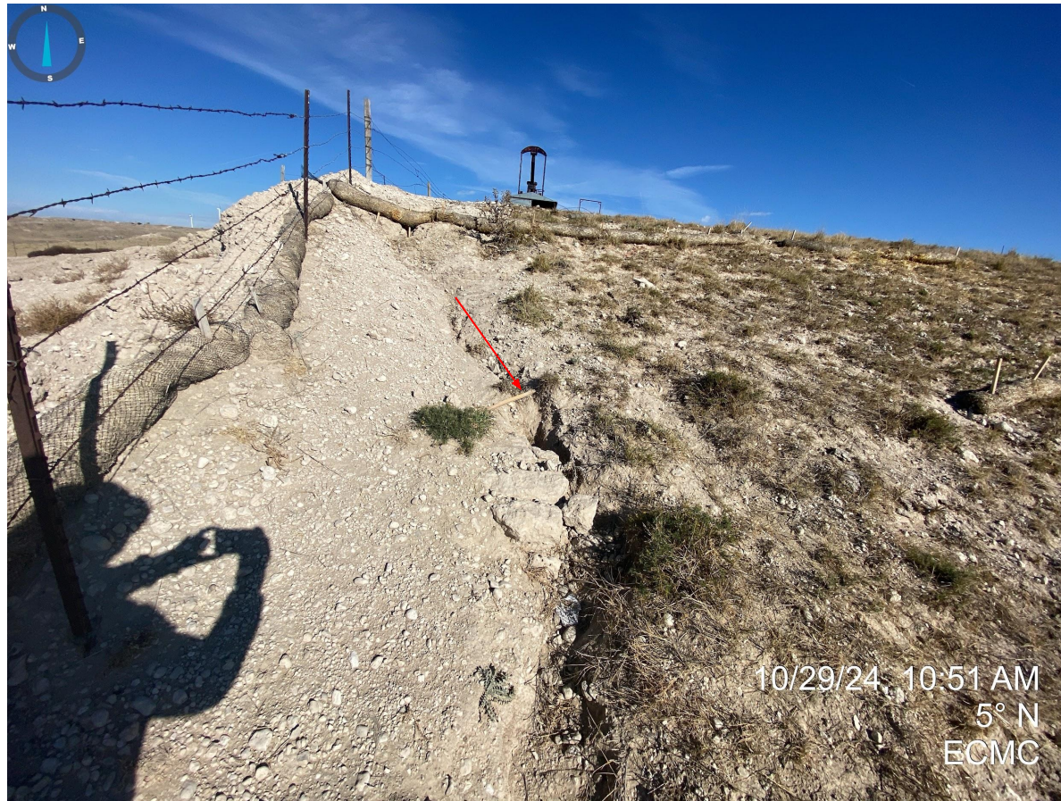
Photo 14. Erosion degradation east of pit remain evident; additional maintenance and/or implementation of more robust stormwater control measures/BMPs required.