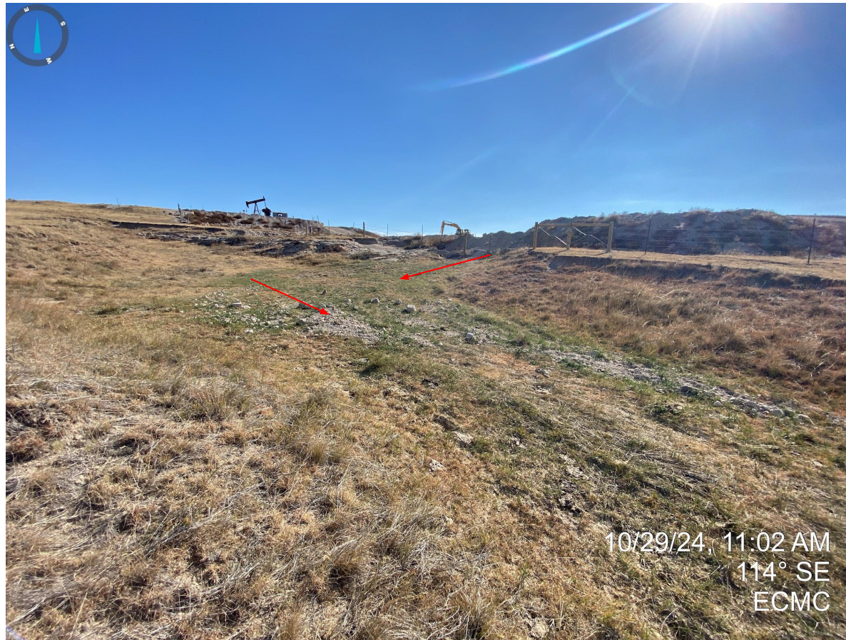
Photo 21. Continued from Photo 19, facing southeast. Evidence of off-location sediment transport observed.