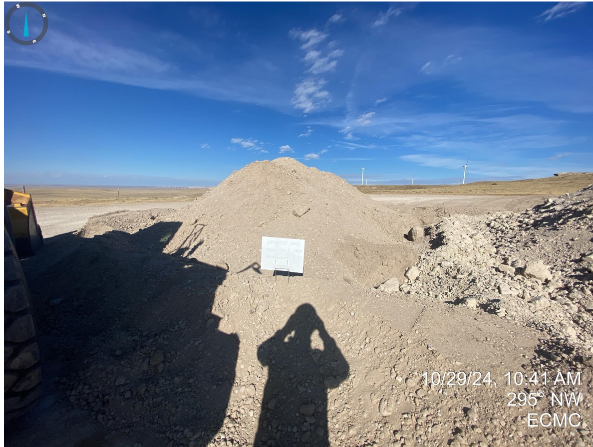
Photo 9. Stockpiled materials located near the wellhead appear to have perimeter stormwater controls and adequate signage.