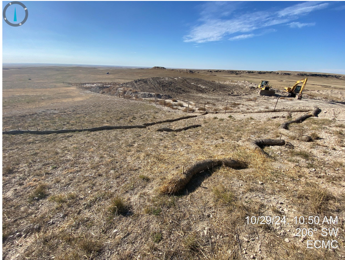
Photo 13. Stormwater control measures east of pit remain inadequate; additional maintenance and/or implementation of more robust stormwater control measures/BMPs required. Straw wattles do not appear to be installed properly and are damaged.