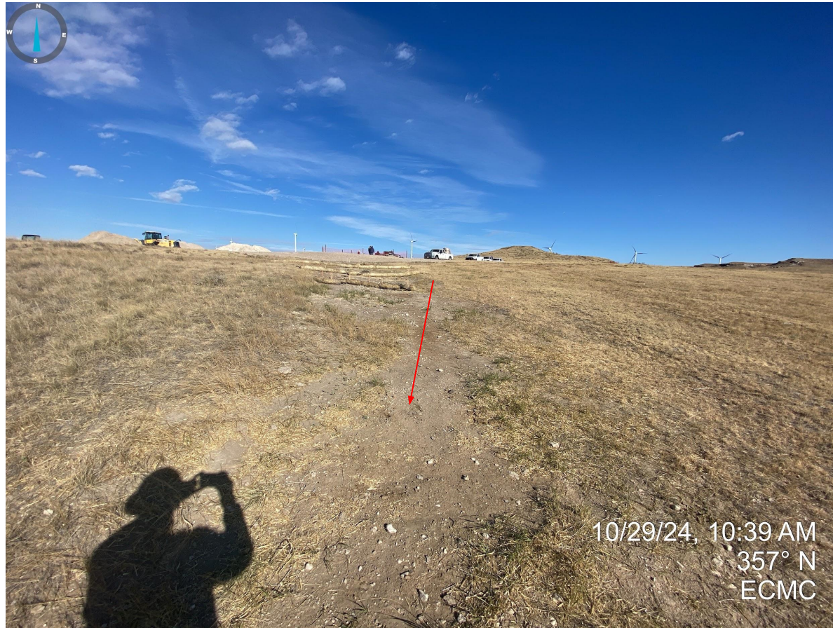
Photo 6. Continued from Photos 4 & 5. Erosion degradation evident from lack of proper stormwater control measures.