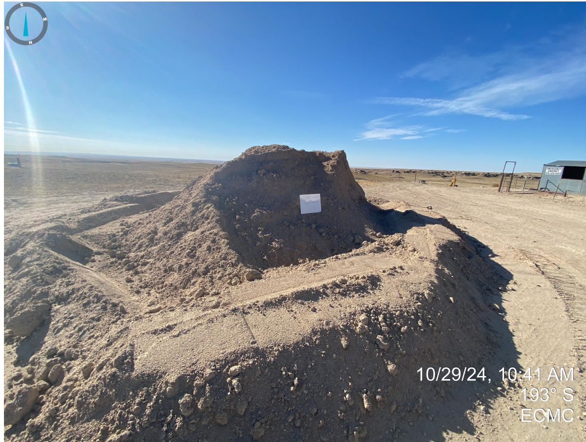
Photo 7. Stockpiled materials located near the wellhead appear to have perimeter stormwater controls and adequate signage.