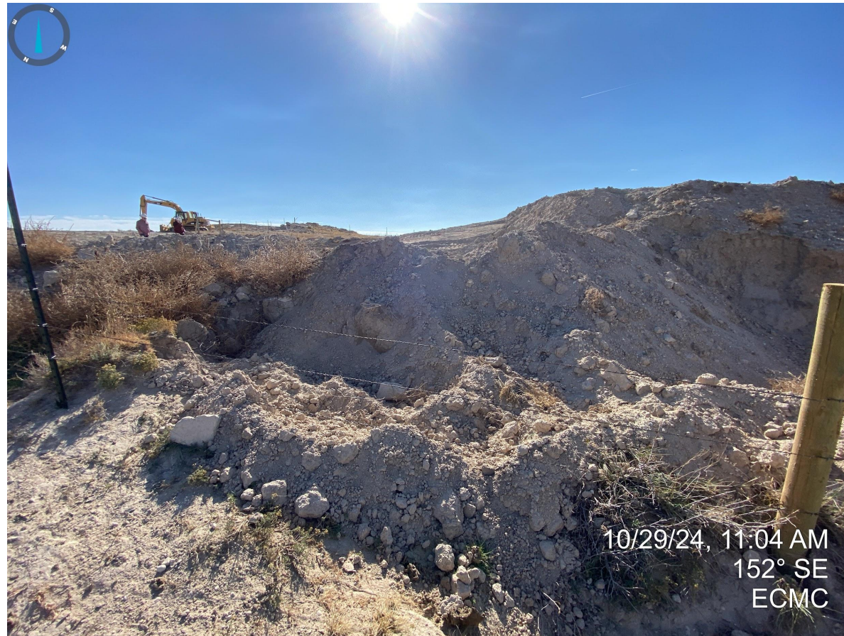
Photo 19. Northwest corner of the excavated pit; photo illustrates unstabilized soils. It appears that stormwater may have breached the berm and discharged stormwater, rock/sediment/debris and E&P waste into the adjacent drainage (see proceeding photos).