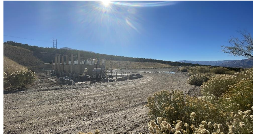
North East corner of location.