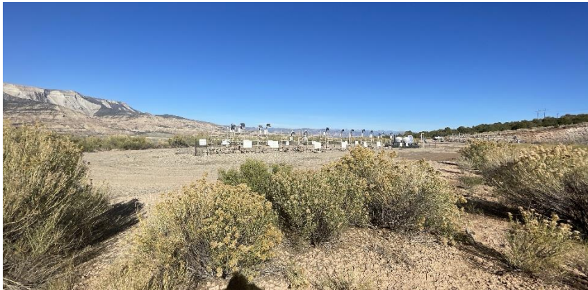
South West corner of location.