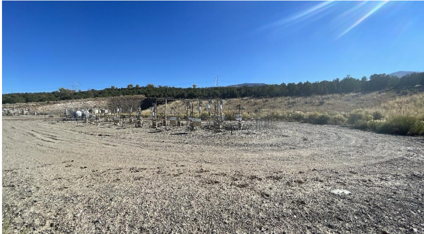
North West corner of location.