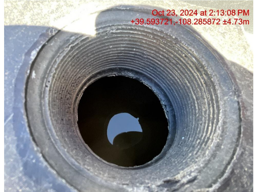
Photo # 7841 Failure to maintain multiple chemical BMP's/chemical tank containments full of fluid/BMP's insufficient to contain possible spill