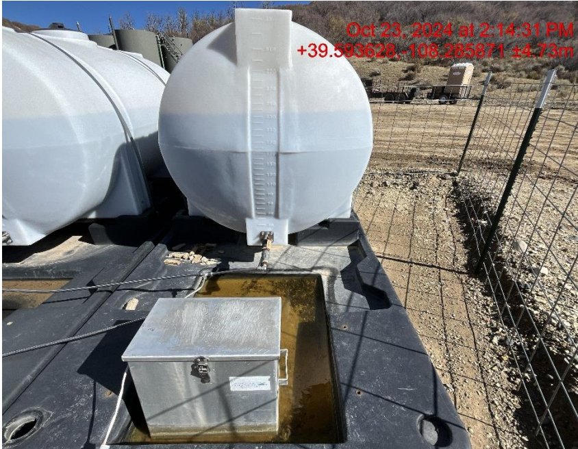
Photo # 7844 Failure to maintain multiple chemical BMP's/chemical tank containments full of fluid/BMP's insufficient to contain possible spill