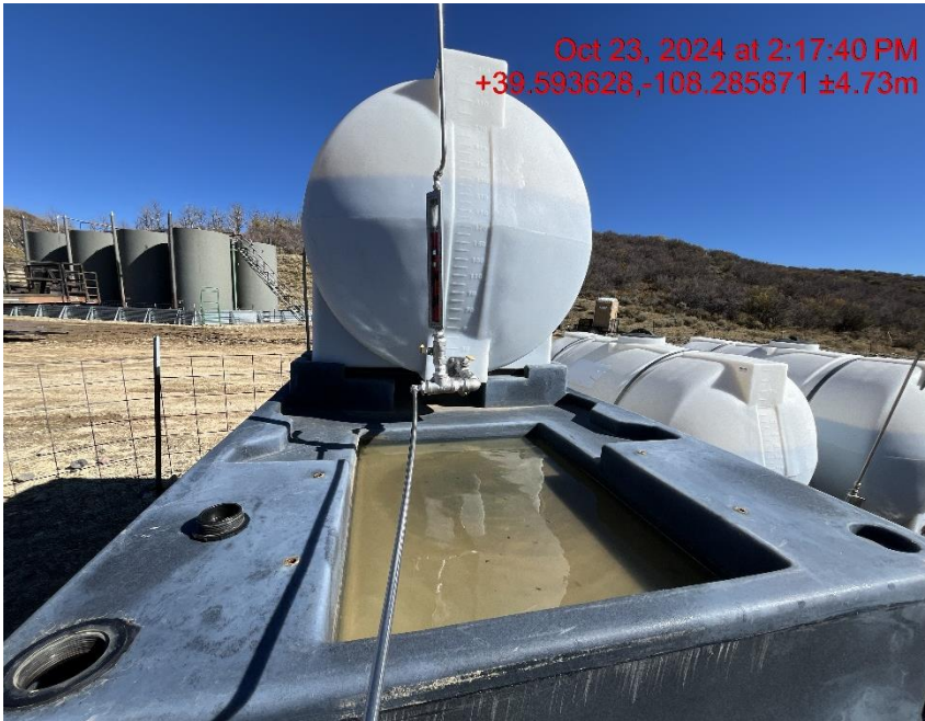
Photo # 7849 Failure to maintain multiple chemical BMP's/chemical tank containments full of fluid/BMP's insufficient to contain possible spill