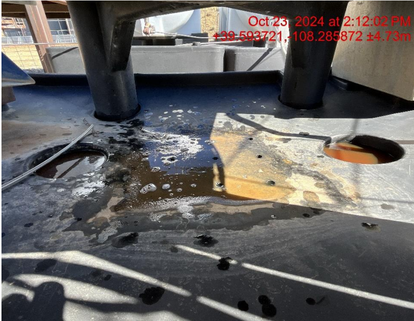
Photo # 7840 Failure to maintain multiple chemical BMP's/chemical tank containments full of fluid/BMP's insufficient to contain possible spill