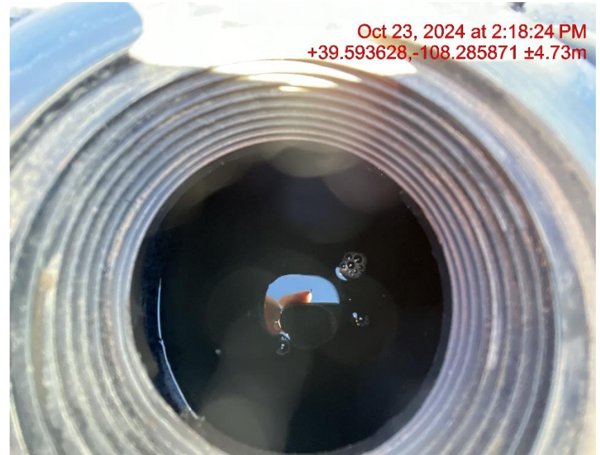
Photo # 7852 Failure to maintain multiple chemical BMP's/chemical tank containments full of fluid/BMP's insufficient to contain possible spill