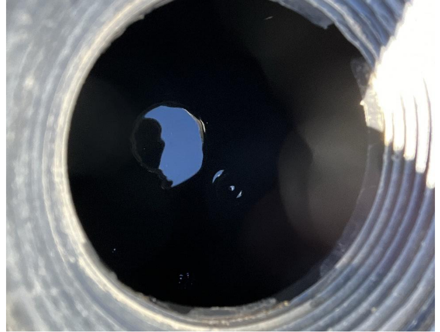
Photo # 7847 Failure to maintain multiple chemical BMP's/chemical tank containments full of fluid/BMP's insufficient to contain possible spill