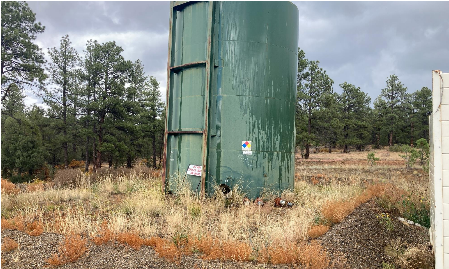
PHOTO 4: PRODUCED WATER TANK BATTERY/ WEEDS INSIDE AND ON TANK BATTERY BERMS. REMOVE WEEDS INSIDE AND ON BERMS PER RULE 606.