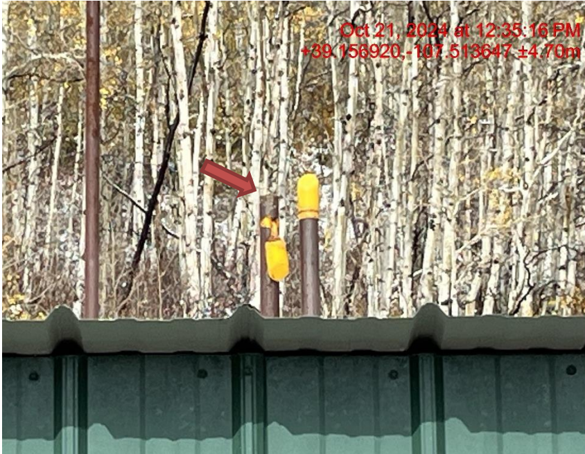
Photo # 7662 PRV vent line does not comply with CECMC pressure safety device rules