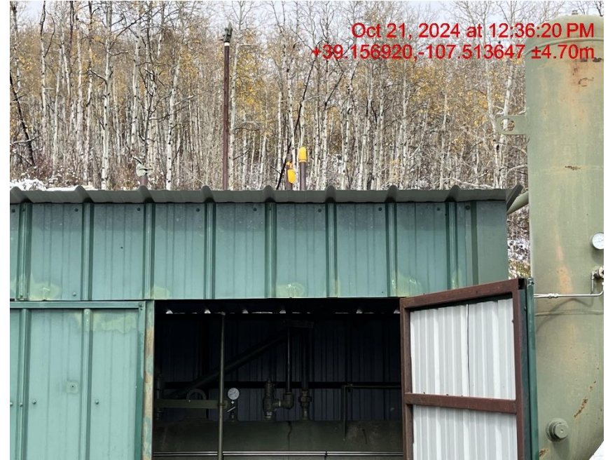
Photo # 7664 PRV vent line does not comply with CECMC pressure safety device rules