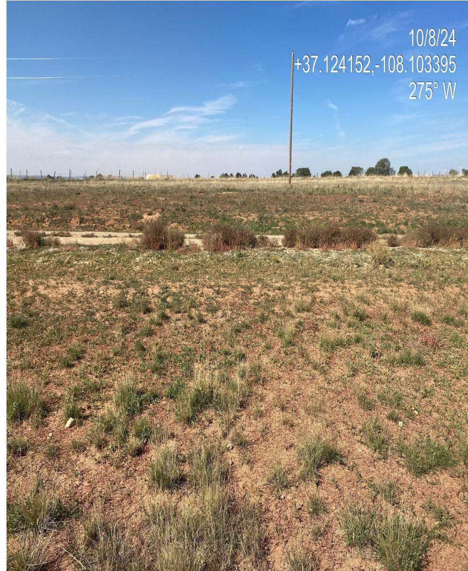
Photo 3. Cardinal photos taken from the center of the disturbance, left photo facing south, right photo facing west. Note: Reclaimed area vegetation appears consistent with adjacent reference area (see photo 4).