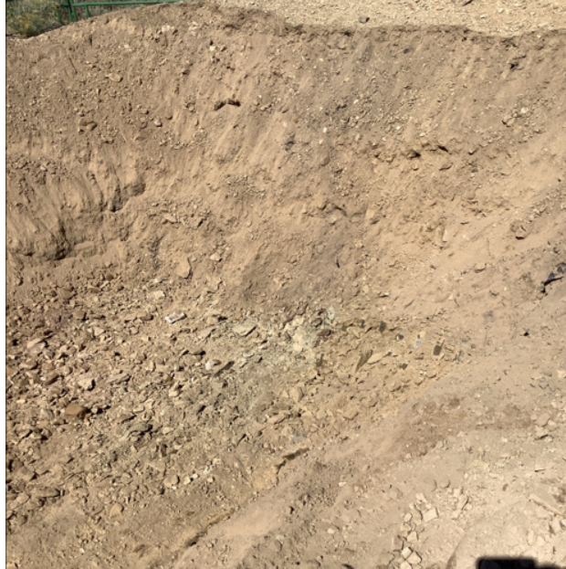
Exhibit 2: 20240918-A36 1100-(PIT-NW)@10