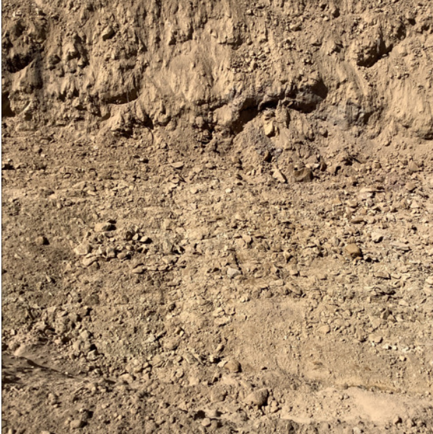
Exhibit 1: 20240918-A36 1100-(PIT-BASE)@10