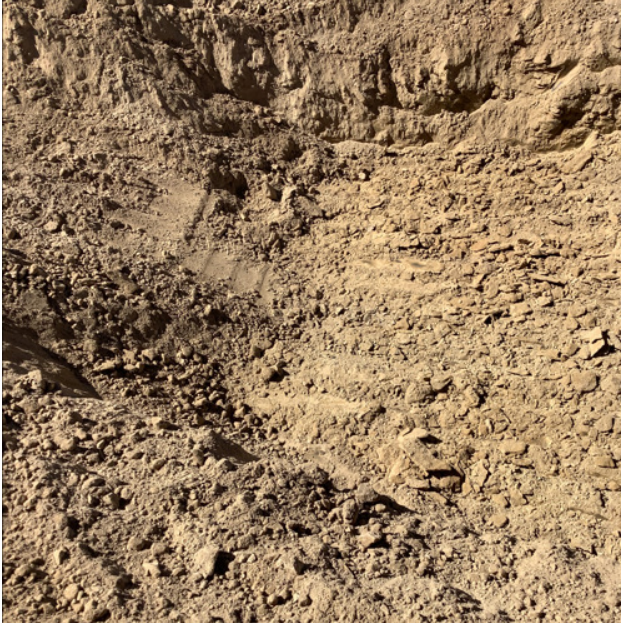
Exhibit 4: 20240918-A36 1100-(PIT-SW)@10