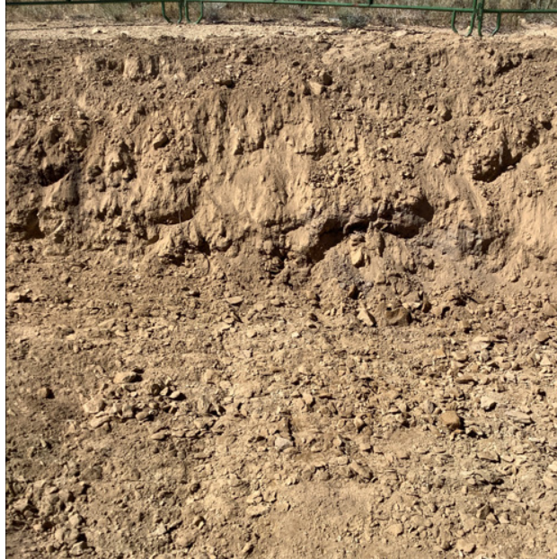
Exhibit 5: 20240918-A36 1100-(PIT-WW)@10