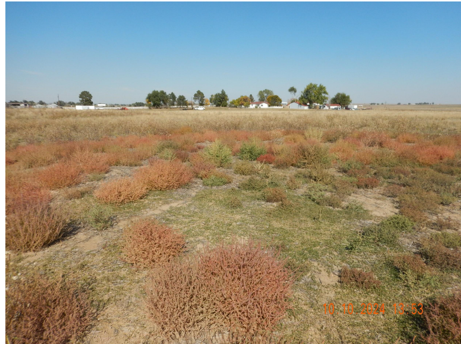
Photo 6. Photo taken from the well location, facing North. See comments under Photo 5.