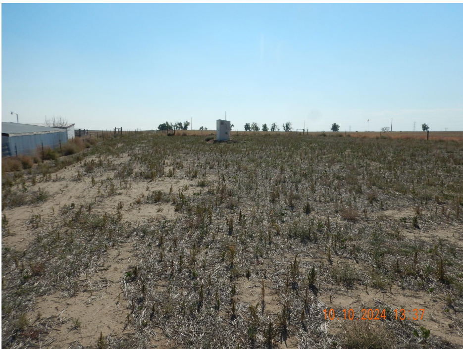
Photo 1. Photo taken from the entrance of the off-location tank battery, facing South. Photo illustrates final reclamation activities have been performed; however, a midstream meter house remains.