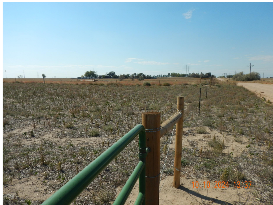
Photo 2. Photo taken from the entrance of the off-location tank battery, facing West. See comments under Photo 1.