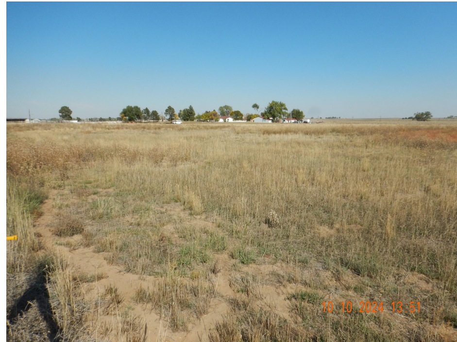
Photo 8. Reference photo taken west of the well location, facing North.