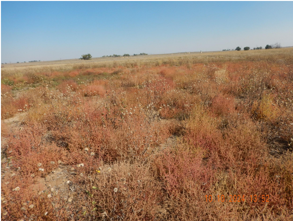
Photo 5. Photo taken from the well location, facing East. Photo illustrates the well location is predominately weedy, annual vegetation.