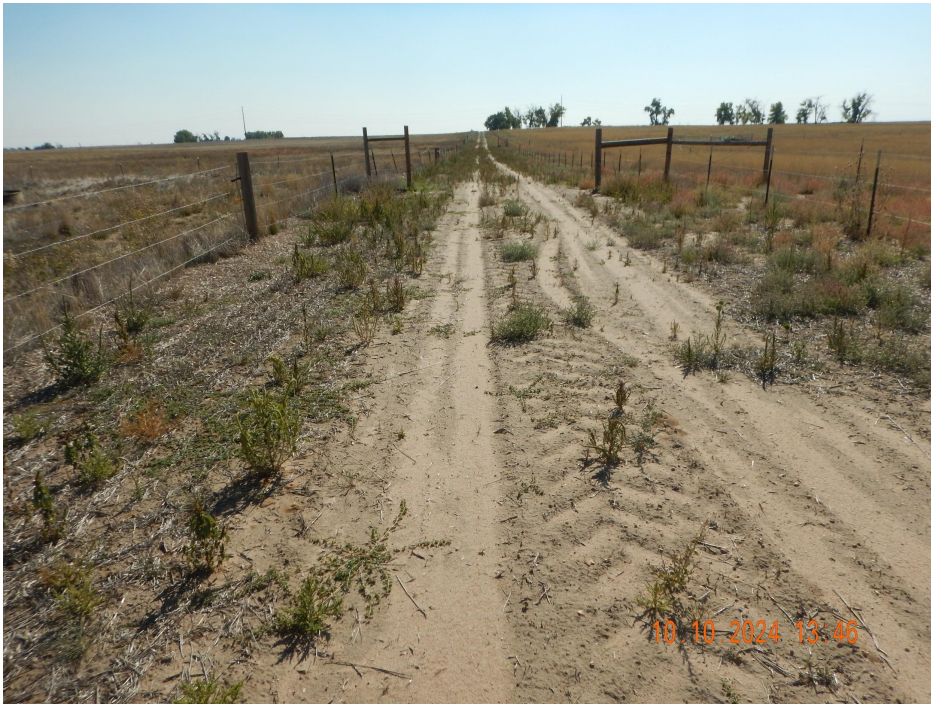
Photo 3. Photo taken along a portion of the access road, facing South. Photo illustrates much of the access road within the tire track portions did not have any germination or straw mulch.