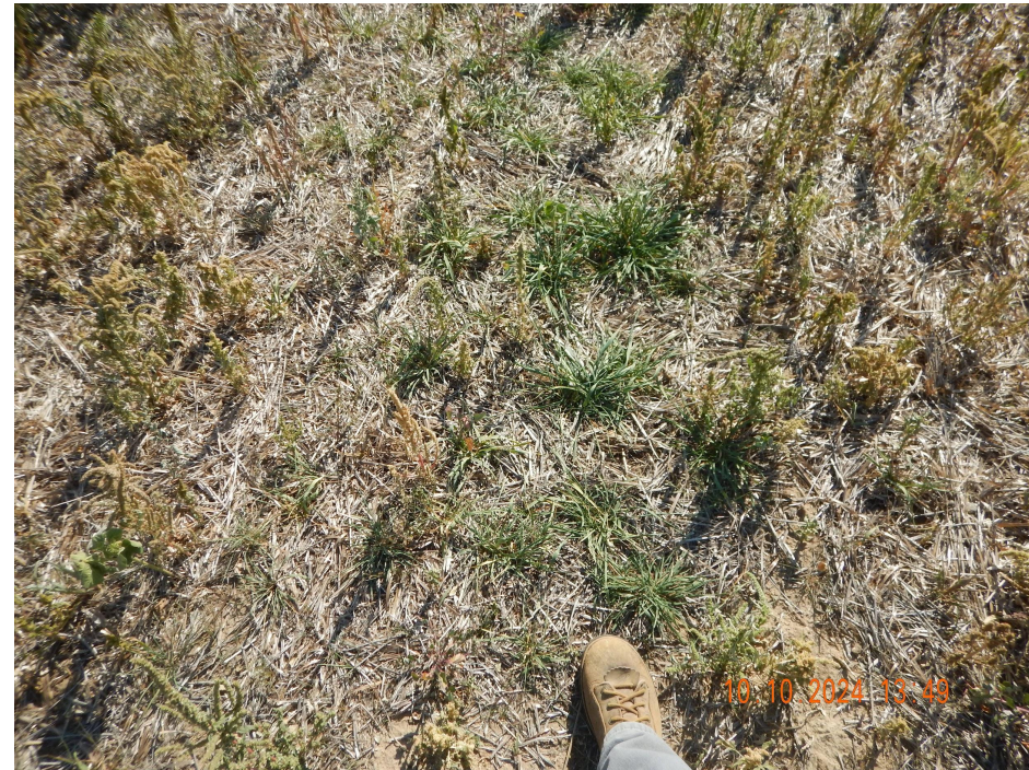
Photo 4. Photo taken along a portion of the access road along the eastern side. Photo illustrates germination of plant species within the straw mulch.