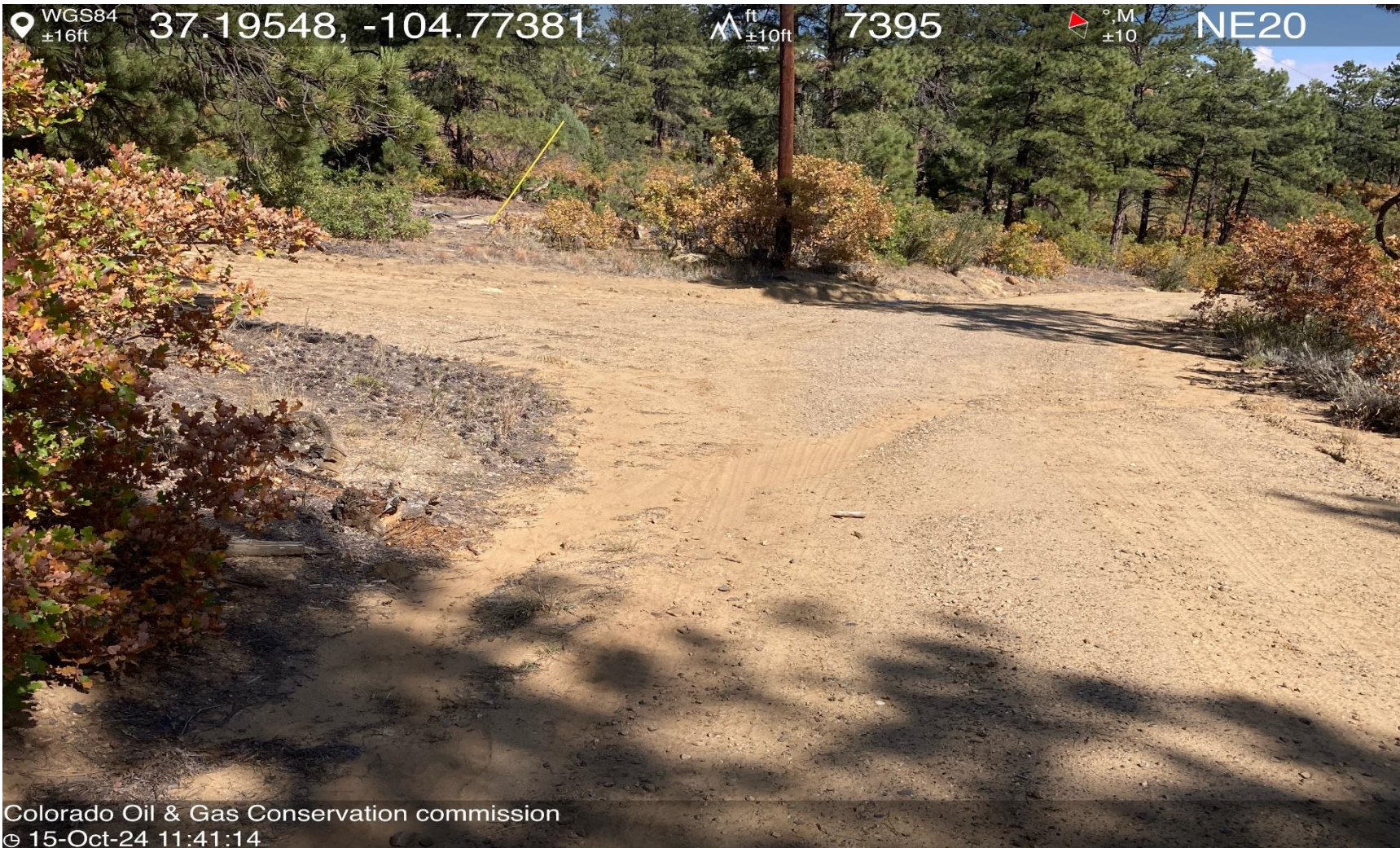
PHOTO 5: CULVERT IS COMPLETELY COVERED WITH SEDIMENT AND IS CAUSING STORMWATER TO CROSS ROAD AND ERODE ROW. CLEAN AND MAINTAIN ALL CULVERTS PER RULE 1002. CA DATE 11/15/2024.