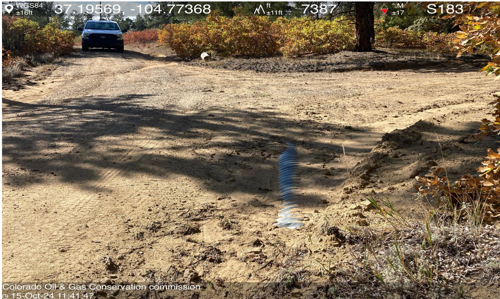
PHOTO 6: IMAGE OF CULVERT FROM THE OTHER SIDE OF INTERSECTION. CLEAN AND MAINTAIN ALL CULVERTS PER RULE 1002. CA DATE 11/15/2024.