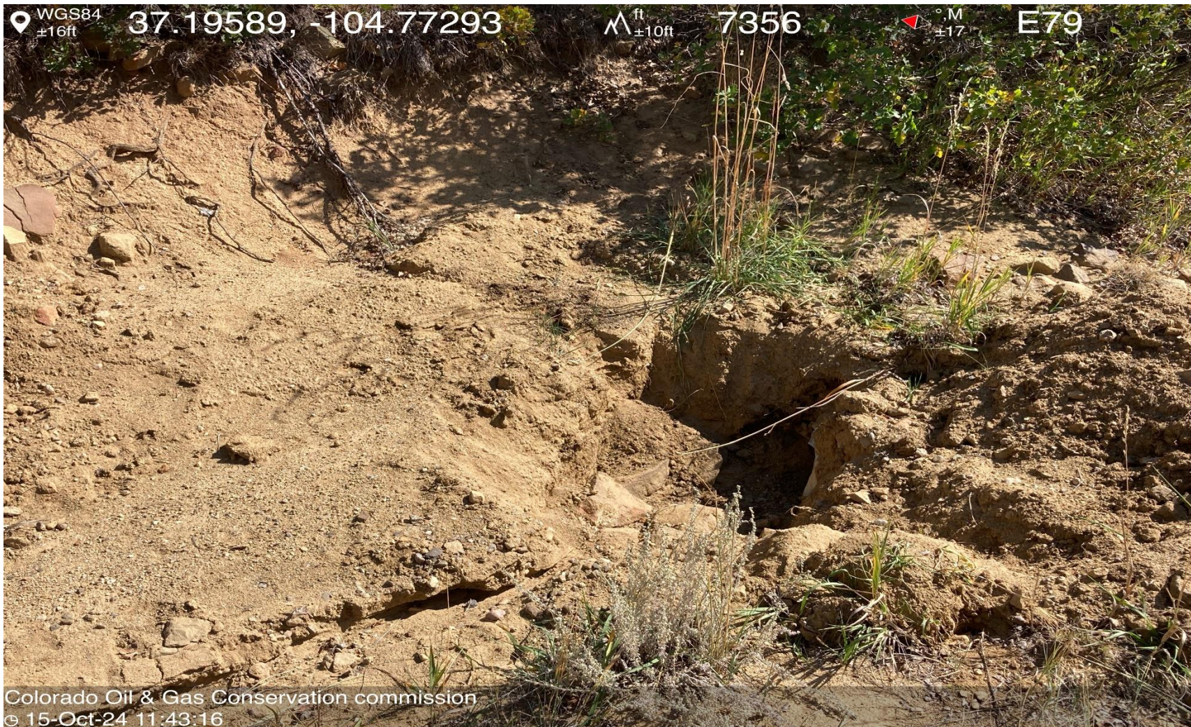
PHOTO 7: NEXT CULVERT DOWN THE HILL WAS NOT CLEANED ADDIQUATELY. CLEAN AND MAINTAIN ALL CULVERTS PER RULE 1002. CA DATE 11/15/2024.