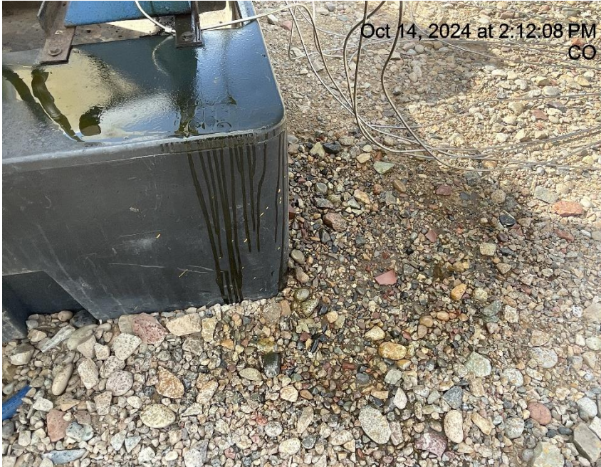
Photo # 5334 Mechanical Condition – possible leak on chemical tank pump/equipment