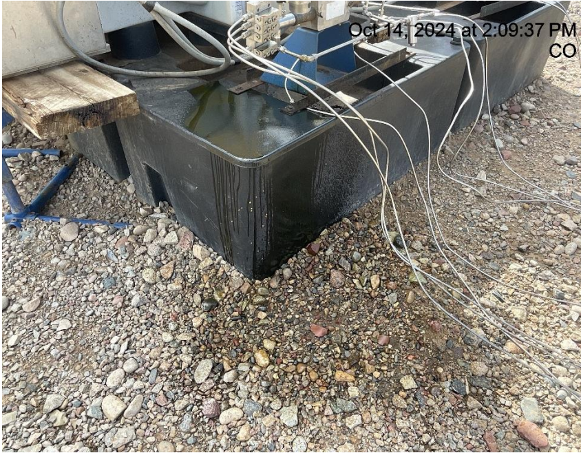
Photo # 5332 Mechanical Condition – possible leak on chemical tank pump/equipment