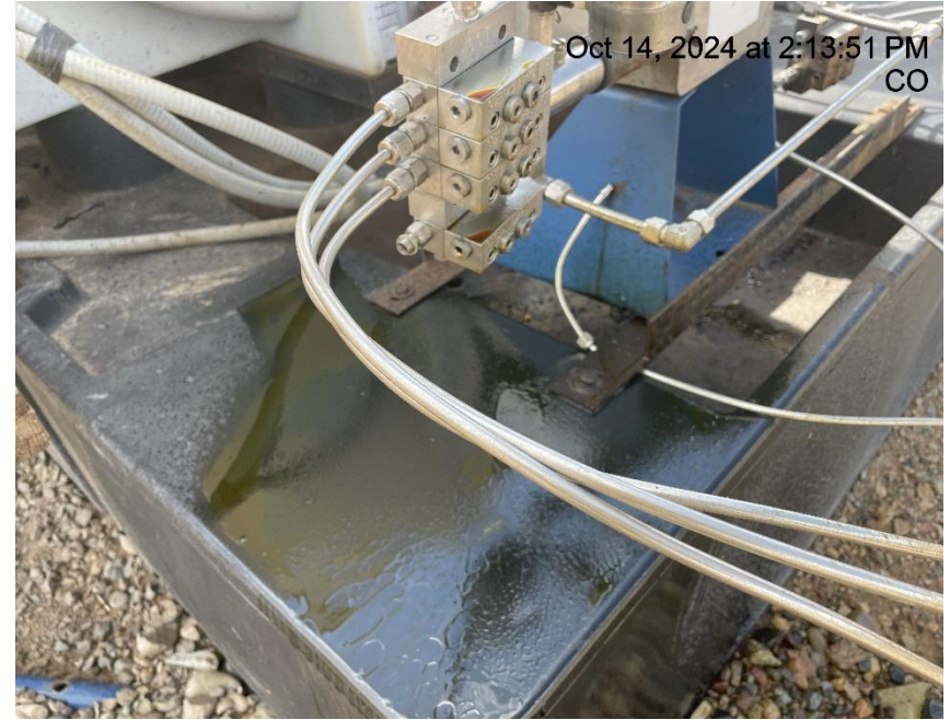
Photo # 5333 Mechanical Condition – possible leak on chemical tank pump/equipment