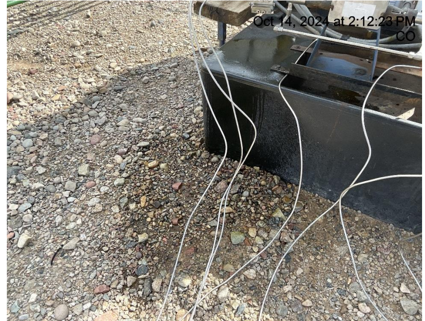
Photo # 5335 Mechanical Condition – possible leak on chemical tank pump/equipment