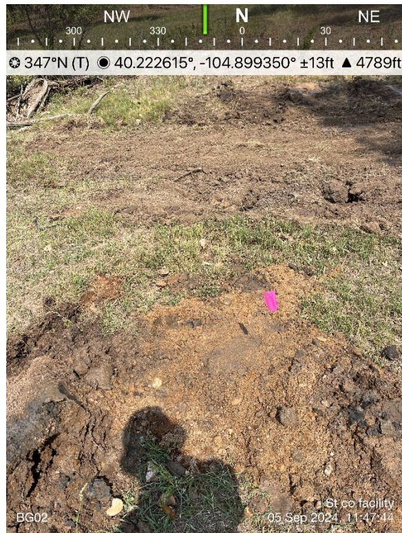
Background Sample Location 02