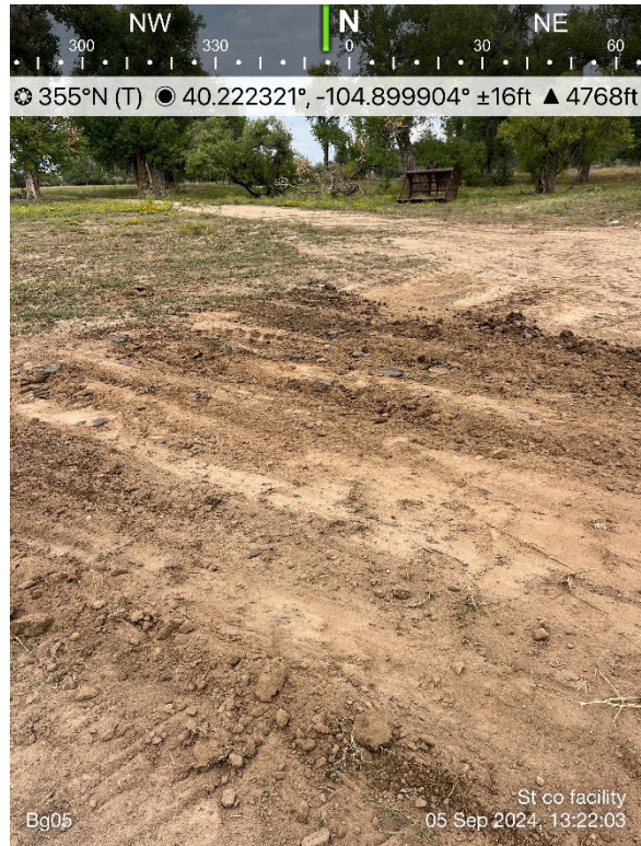
Background Sample Location 05