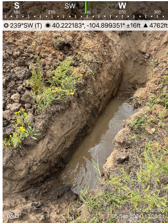
Background Sample Location 03 (Groundwater Present)