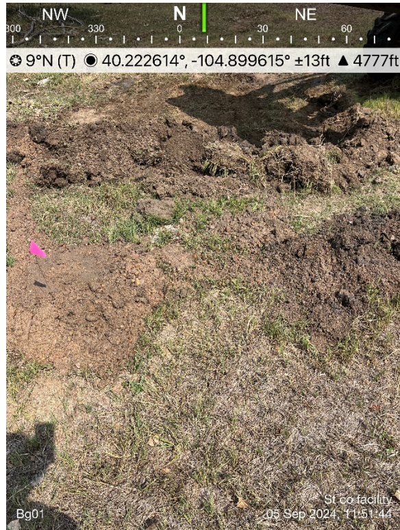
Background Sample Location 01