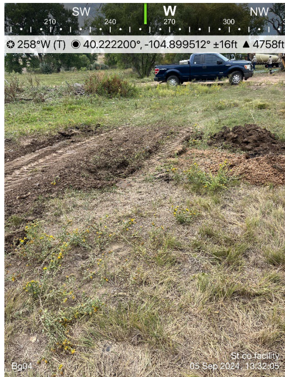
Background Sample Location 04