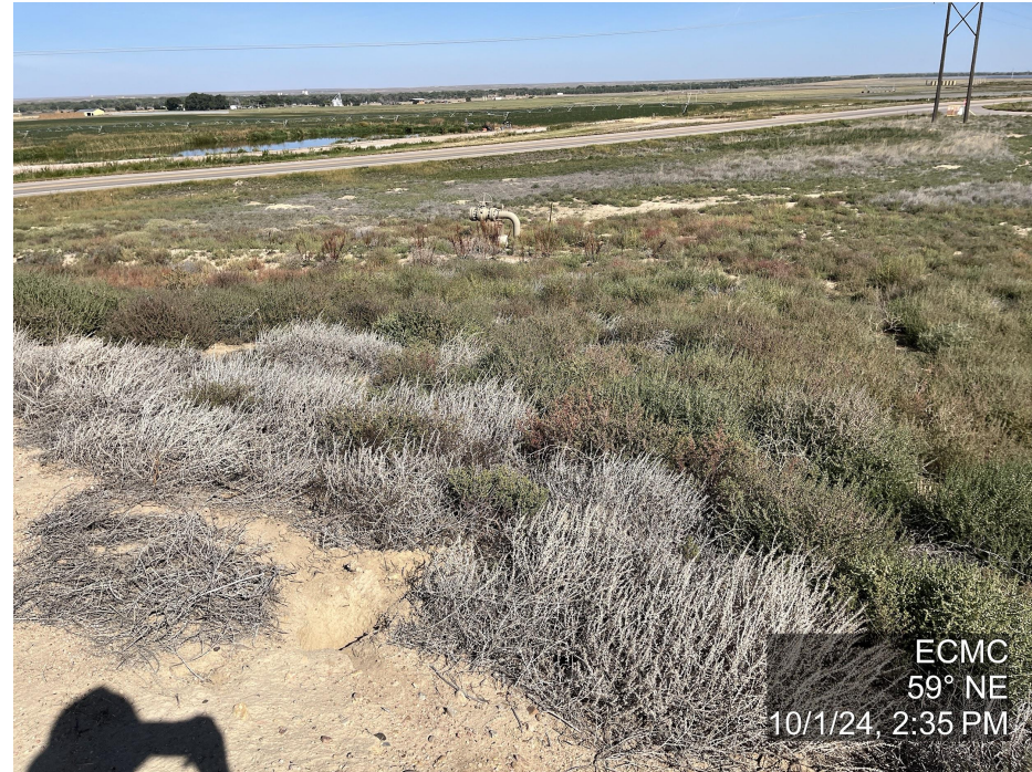
Photo 4. The photo was taken at the well location facing Northeast. Refer to the comment for photo 2.

Photo 3. The photo was taken at the well location facing Northeast. The photo illustrates a broken hose continuing to in use that should be replaced.