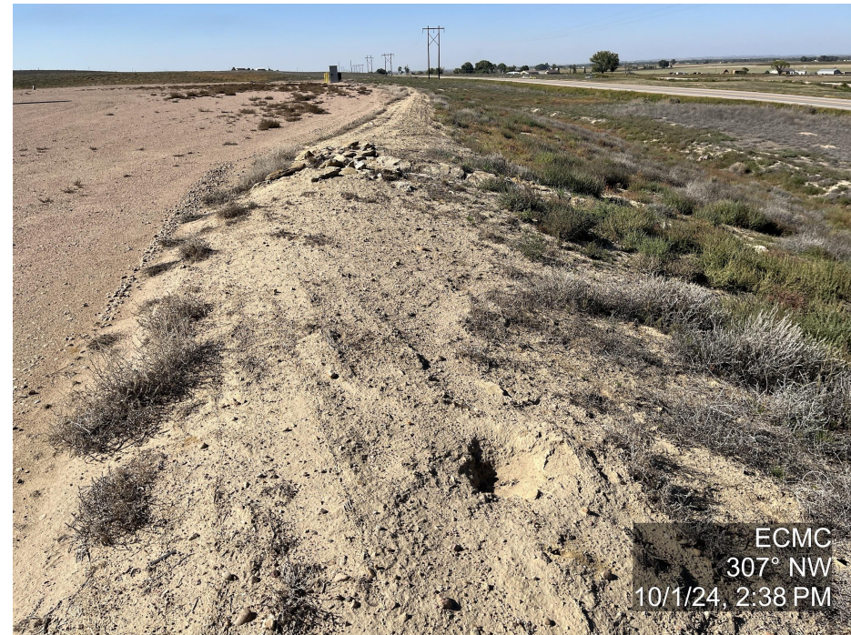
Photo 6. The photo was taken at the well location facing Northwest. Refer to the comment for photo 2.