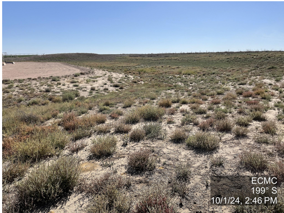
Photo 7. The photo was taken at the well location facing South. Refer to the comment for photo 2.