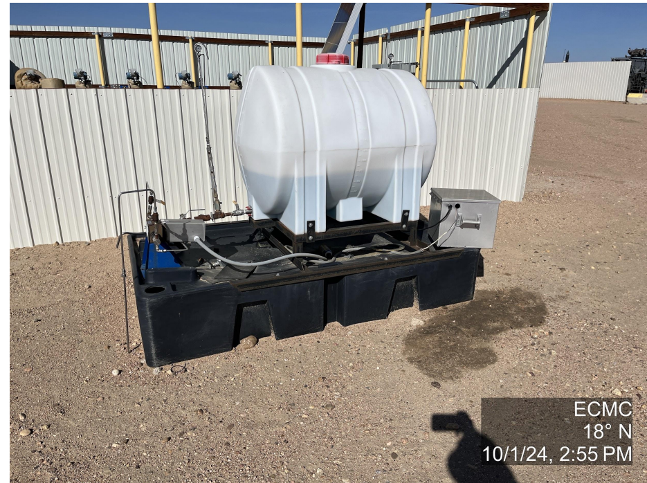
Photo 12. The photo was taken at the well location facing North. The photo illustrates stained soil on the production pad.