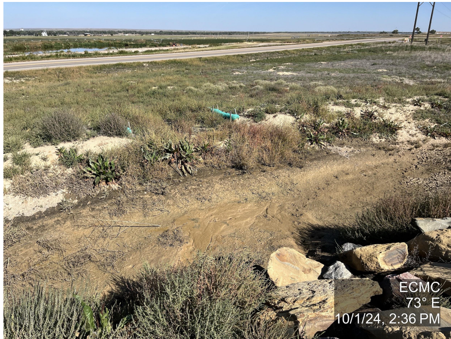
Photo 5. The photo was taken at the well location facing East. Refer to the comment for photo 2.