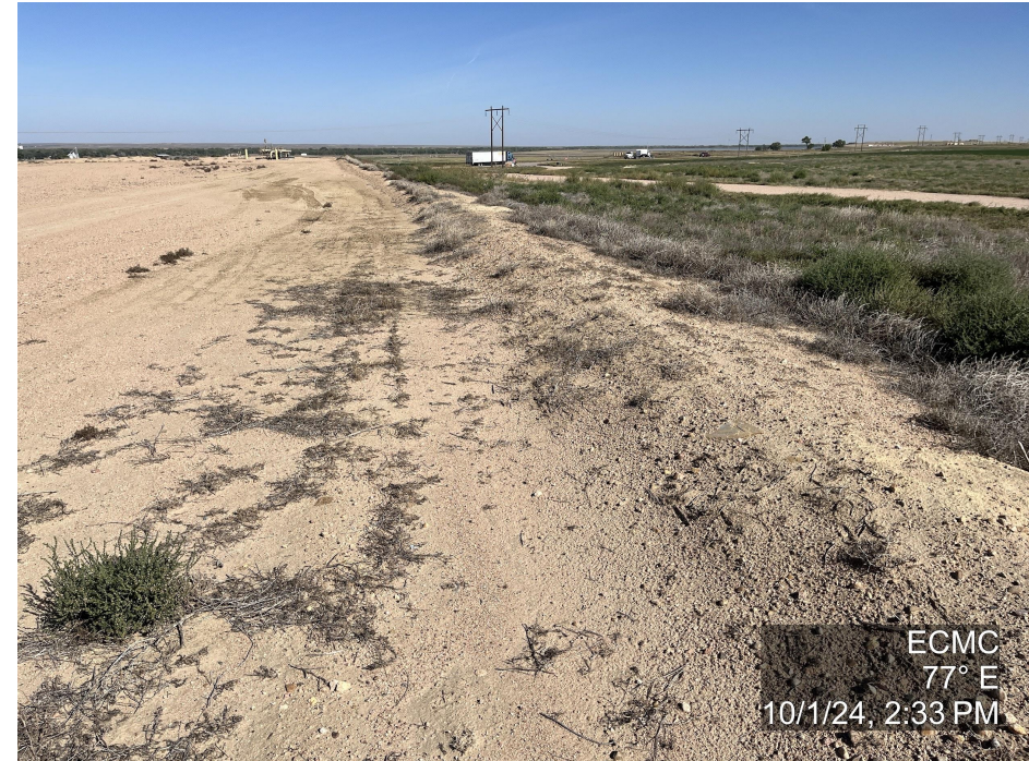
Photo 2. The photo was taken at the well location facing East. The photo illustrates the russian thistle in interim areas not being managed with both old growth and new growth.