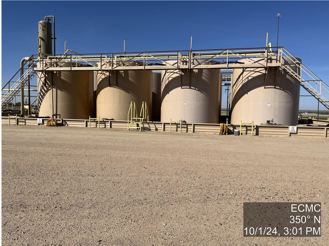
Photo 13. The photo was taken at the well location facing North. The photo illustrates the tanks are missing any identifying placards or labels.