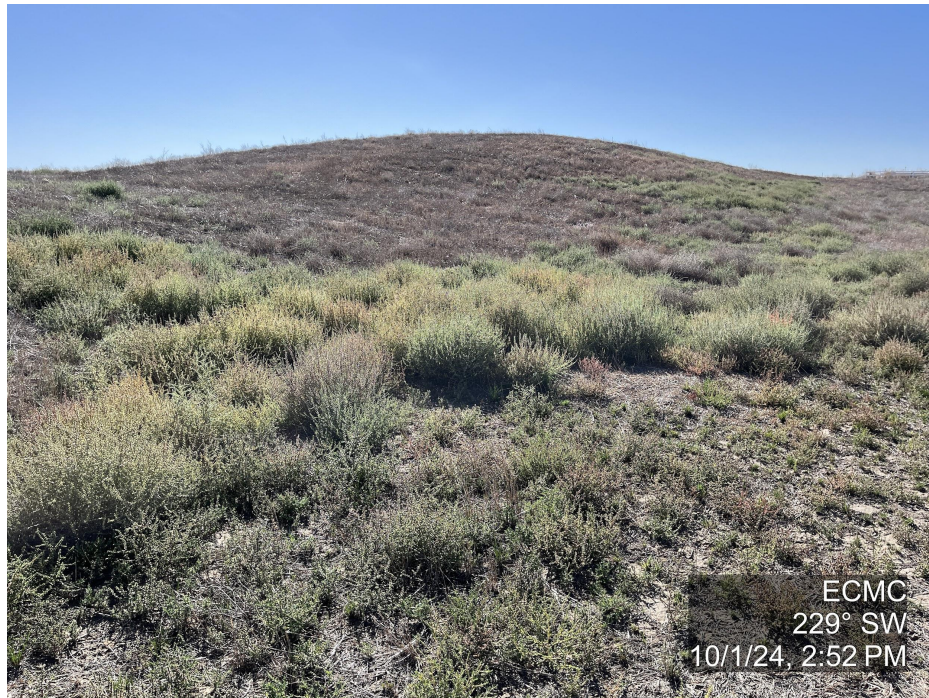
Photo 11. The photo was taken at the well location facing Southwest. The photo illustrates the topsoil stockpile is dominated by russian thistle and other tumbleweeds and has very little to no germination of desirable vegetation.