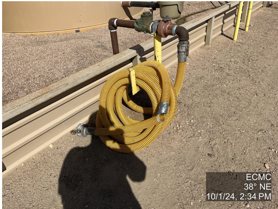
Photo 3. The photo was taken at the well location facing Northeast. The photo illustrates a broken hose continuing to in use that should be replaced.