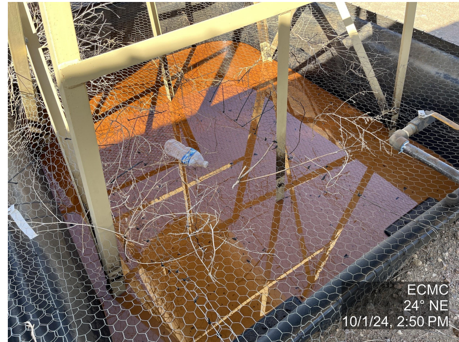
Photo 10. The photo was taken at the well location facing Northeast. The photo illustrates another secondary containment with standing orange liquid within it.