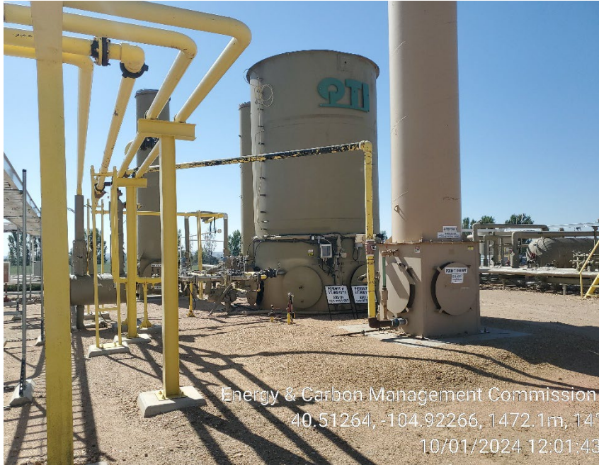
Large ECD unit