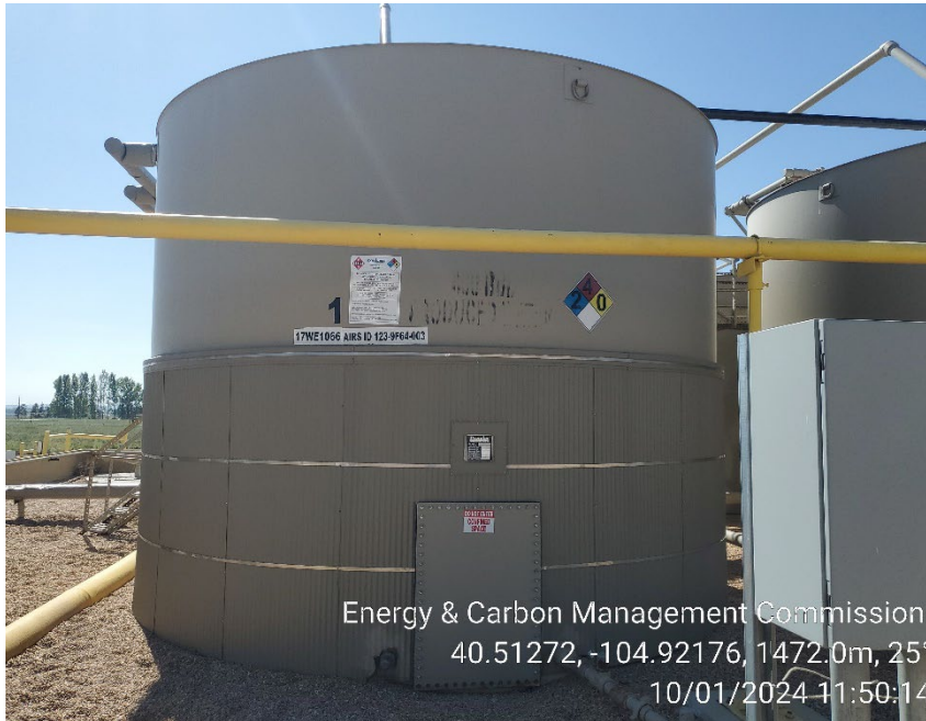
400 bbl produced water tank capacity and contents placard