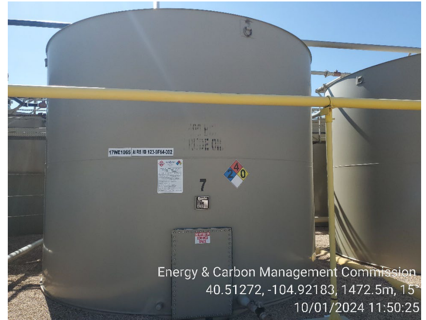
400 bbl crude oil tank capacity and contents placard