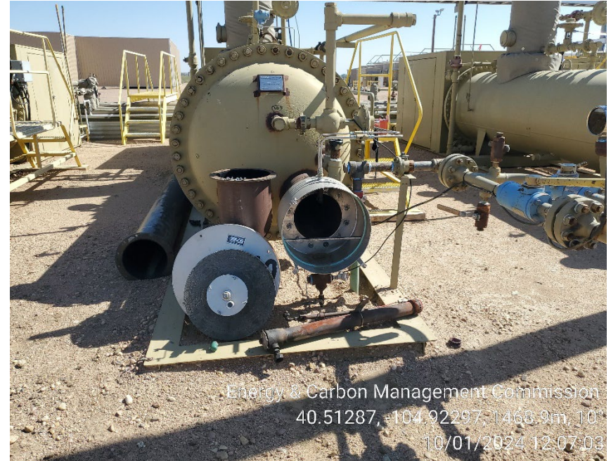
Air inlet access

Energy & Carbon Management Commission 40.51287, -104.92297, 1468.9m, 10° 10/01/2024 12:07:03