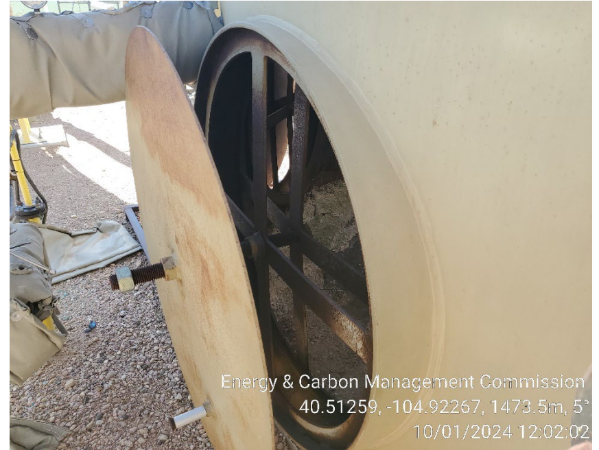
Air inlet access