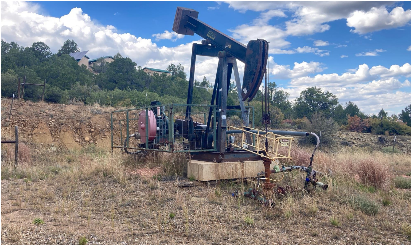
PHOTO 3: WELLHEAD AND EQUIPMENT/ WEED MAINTANANCE. MAINTAIN WEEDS PER RULE 606.