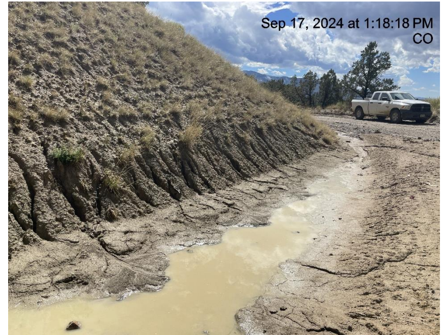
Photo # 736 Erosion on cut slope & transport of sediment onto & off of location/insufficient BMP's