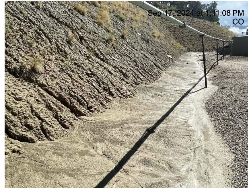
Photo # 732 Erosion on cut slope & transport of sediment onto location/insufficient BMP's