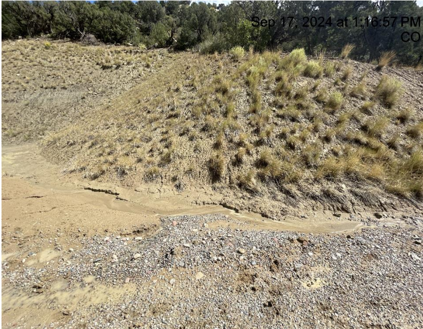
Photo # 739 Erosion & transport of sediment onto & off of location/insufficient BMP's