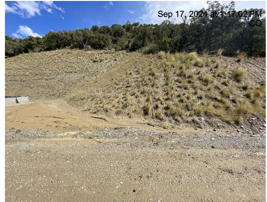
Photo # 738 Erosion & transport of sediment onto & off of location/insufficient BMP's