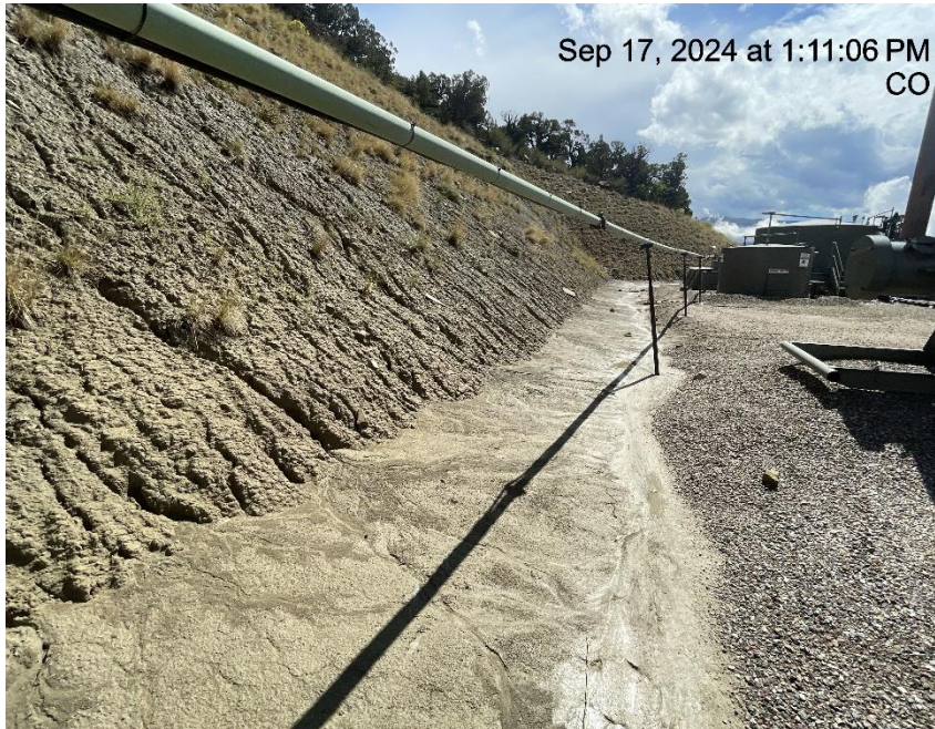
Photo # 731 Erosion on cut slope & transport of sediment onto location/insufficient BMP's