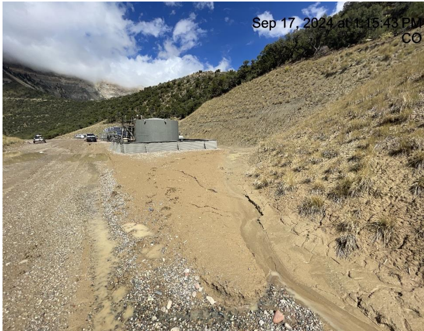
Photo # 737 Erosion & transport of sediment onto & off of location/insufficient BMP's