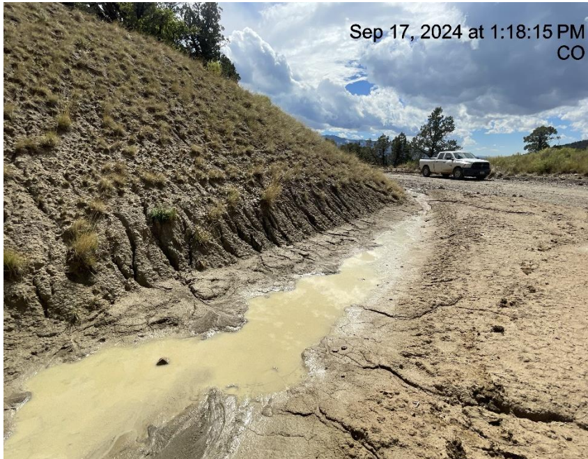
Photo # 735 Erosion on cut slope & transport of sediment onto & off of location/insufficient BMP's