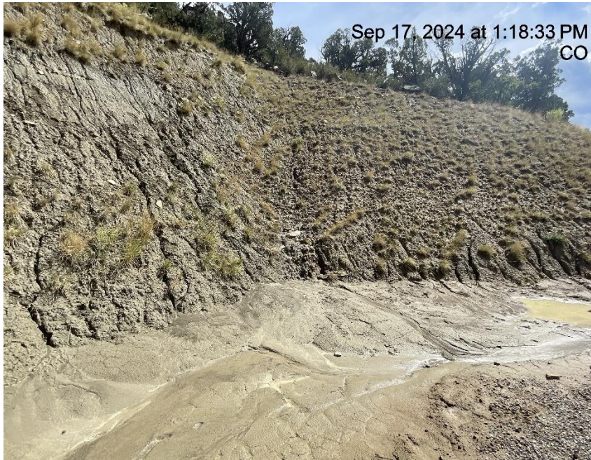
Photo # 733 Erosion on cut slope & transport of sediment onto location/insufficient BMP's