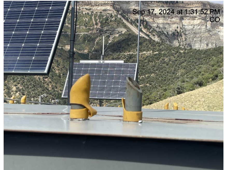
Photo # 724 PRV vent line does not comply with CECMC pressure safety device rules