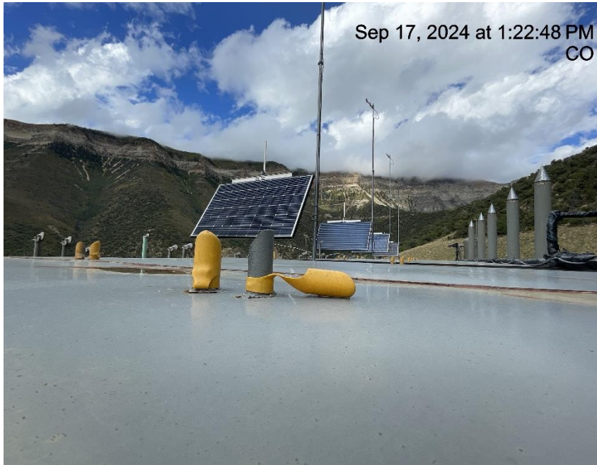
Photo # 719 PRV vent line does not comply with CECMC pressure safety device rules