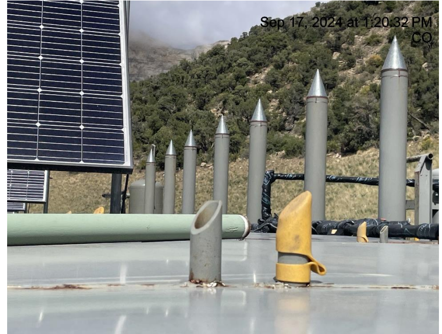
Photo # 718 Rupture disc vent line does not comply with CECMC pressure safety device rules