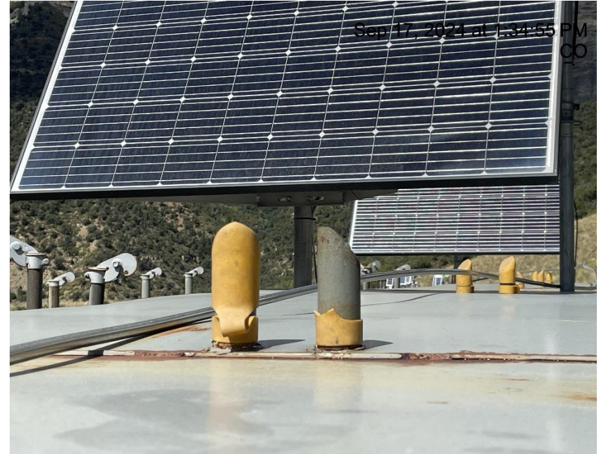
Photo # 726 PRV vent line does not comply with CECMC pressure safety device rules