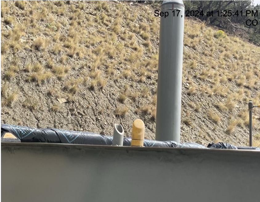
Photo # 721 PRV vent line does not comply with CECMC pressure safety device rules