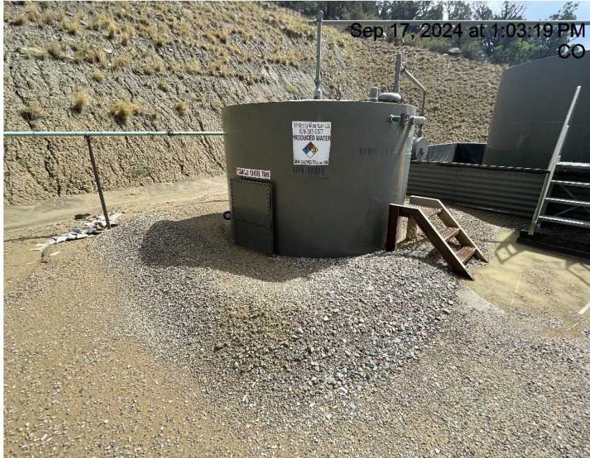
Photo # 715 Secondary containment does not comply with CECMC secondary containment rules (additionally 80 bbl tank does not appear to be in operators Form 2A or any Form 4 Sundry as required by CECMC rules)