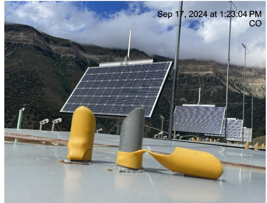
Photo # 720 PRV vent line does not comply with CECMC pressure safety device rules