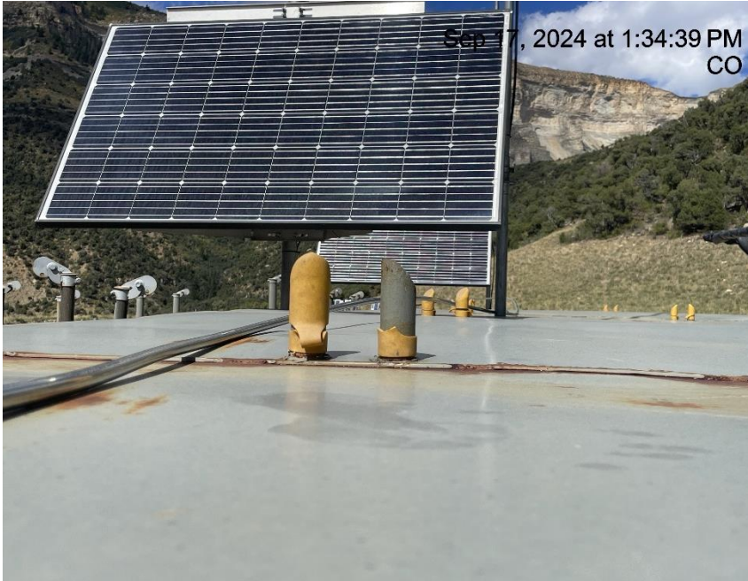
Photo # 725 PRV vent line does not comply with CECMC pressure safety device rules