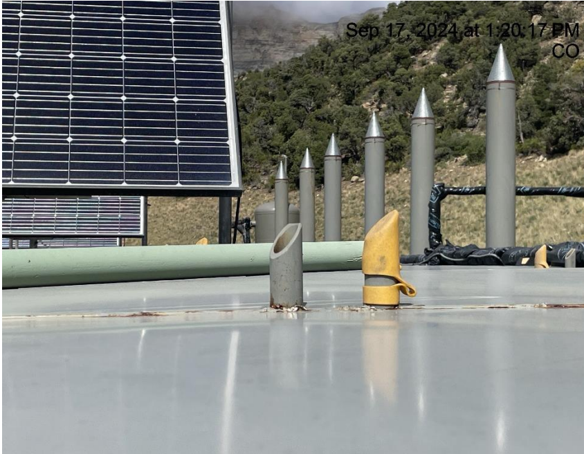
Photo # 717 Rupture disc vent line does not comply with CECMC pressure safety device rules