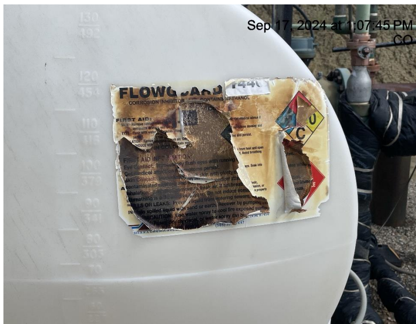
Photo # 727 Chemical tank label damaged & some required info is illegible/does not comply with CECMC rules