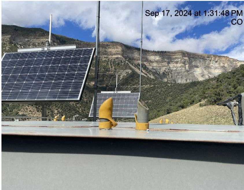
Photo # 723 PRV vent line does not comply with CECMC pressure safety device rules