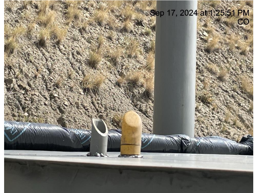
Photo # 722 PRV vent line does not comply with CECMC pressure safety device rules