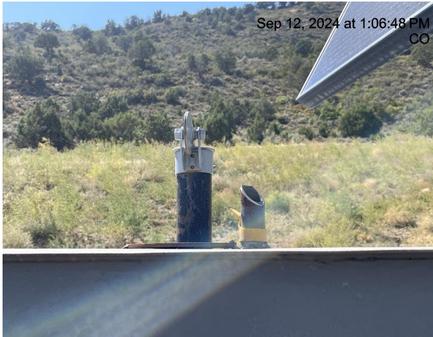
Photo # 221 Rupture disc vent line does not comply with CECMC pressure safety device rules