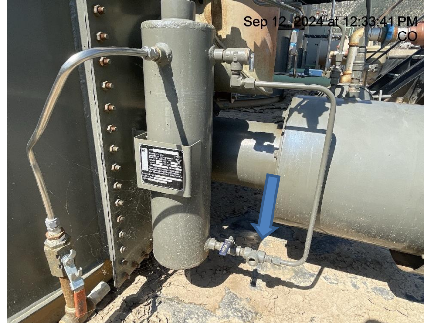
Photo # 224 PRV vent line does not comply with CECMC pressure safety device rules