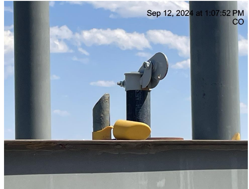
Photo # 222 Rupture disc vent line does not comply with CECMC pressure safety device rules