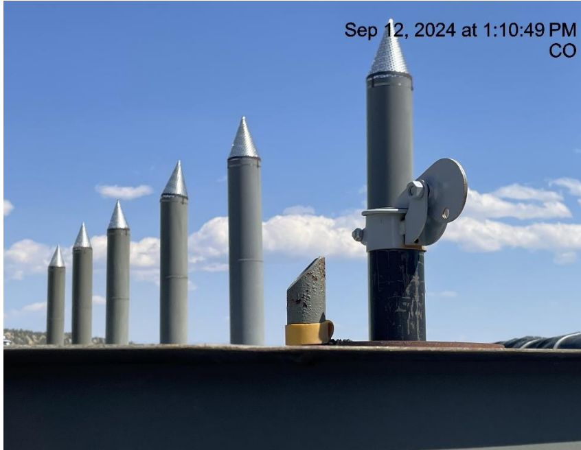
Photo # 223 Rupture disc vent line does not comply with CECMC pressure safety device rules