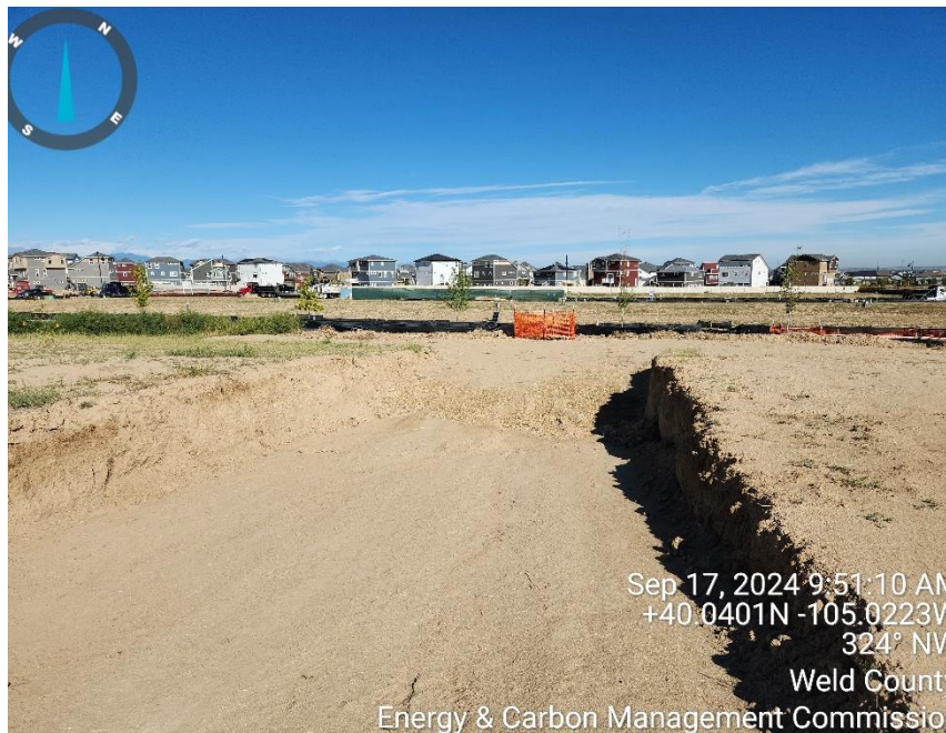
Photo 1 well head and equipment