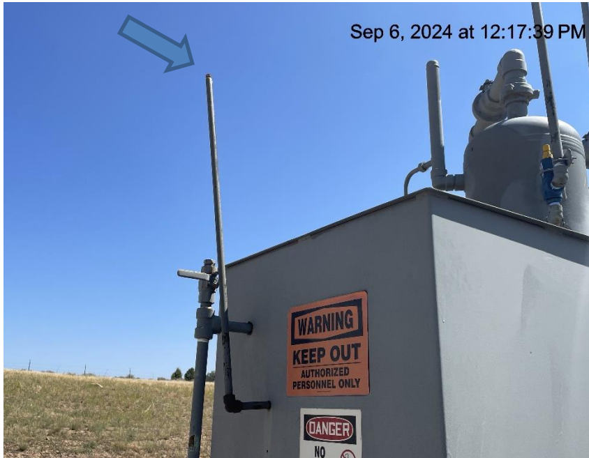
Photo # 8636 PRV vent line does not comply with CECMC pressure safety device rules