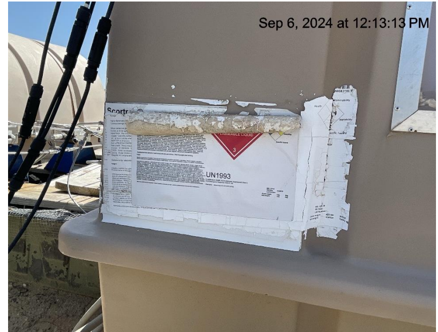
Photo # 8635 Label on chemical tank peeling & some info is illegible/does not comply with CECMC rules