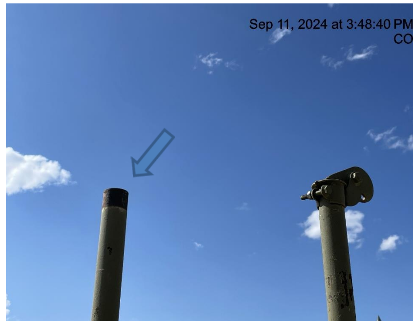
Photo # 57 Rupture disc vent line does not comply with CECMC pressure safety device rules.