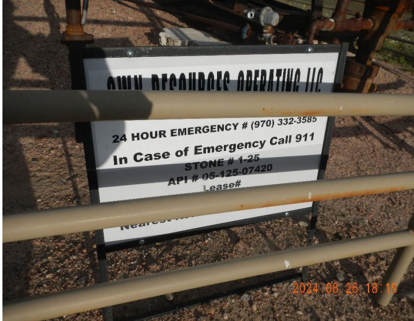
1. Well sign at well location.