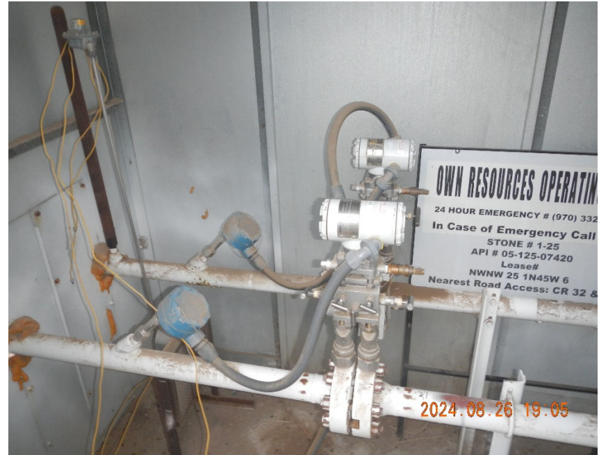
6. Gas meter inside remote shared meter shed.