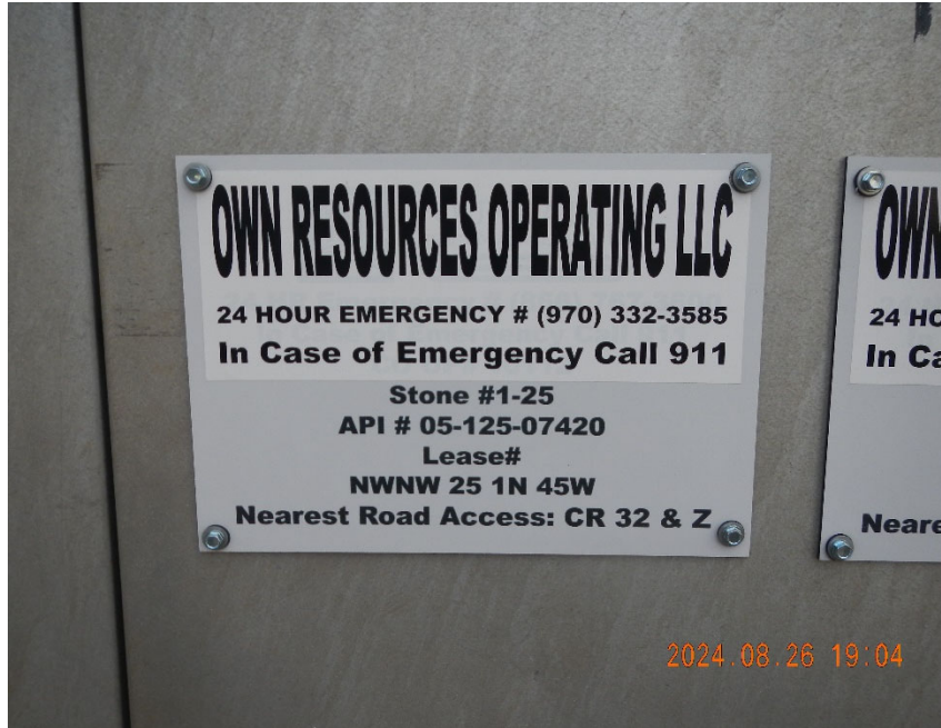
5. Well sign at remote battery.