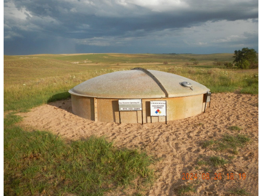
4. Produced water tank.