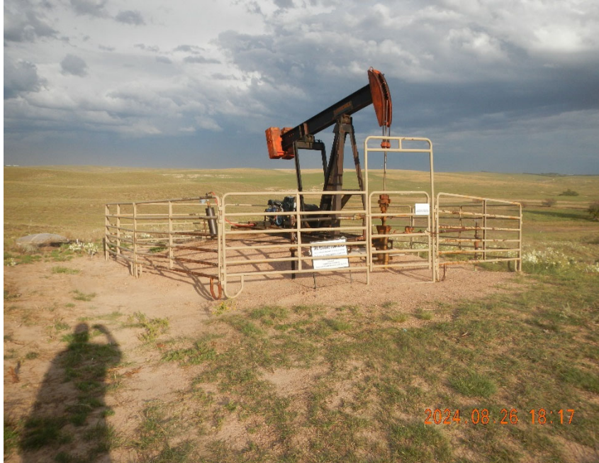
3. Well location overview.