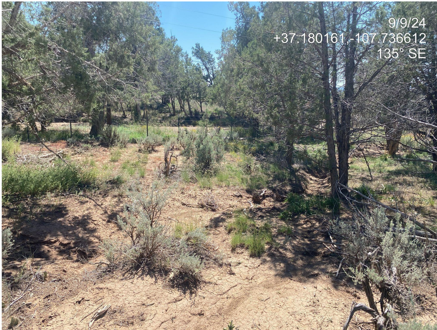
Photo 3. Reference area comprised of Grama, Sabegrush and Juniper.