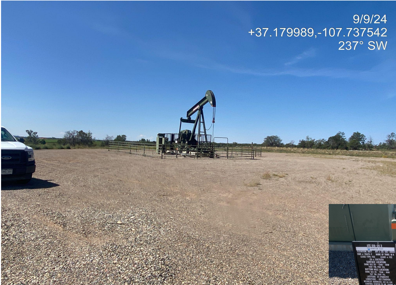
Photo 1. View of the well disturbance taken from the access point facing center.