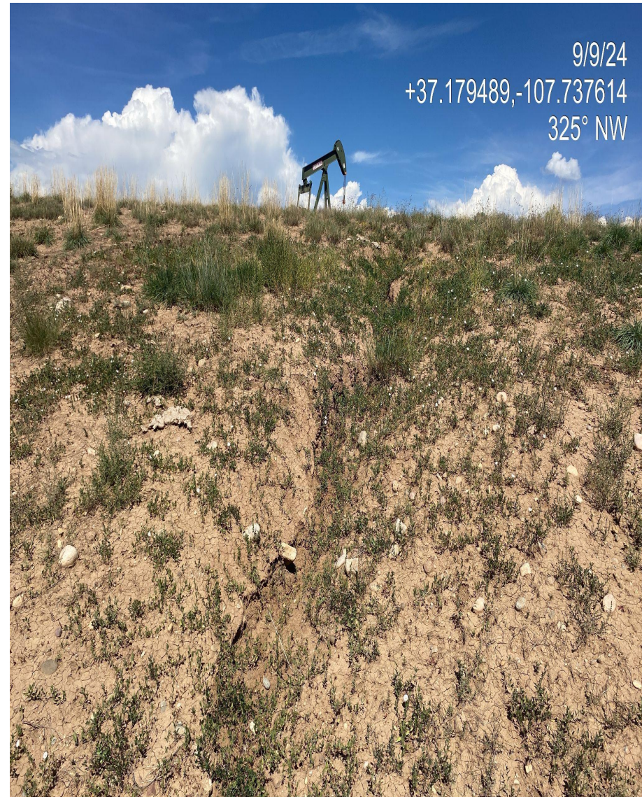
Photo 2. View of gully erosion observed in the southern portion of the interim reclamation area.