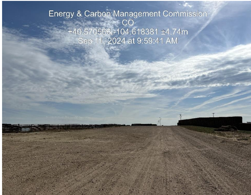
Photo 1 Entrance to location